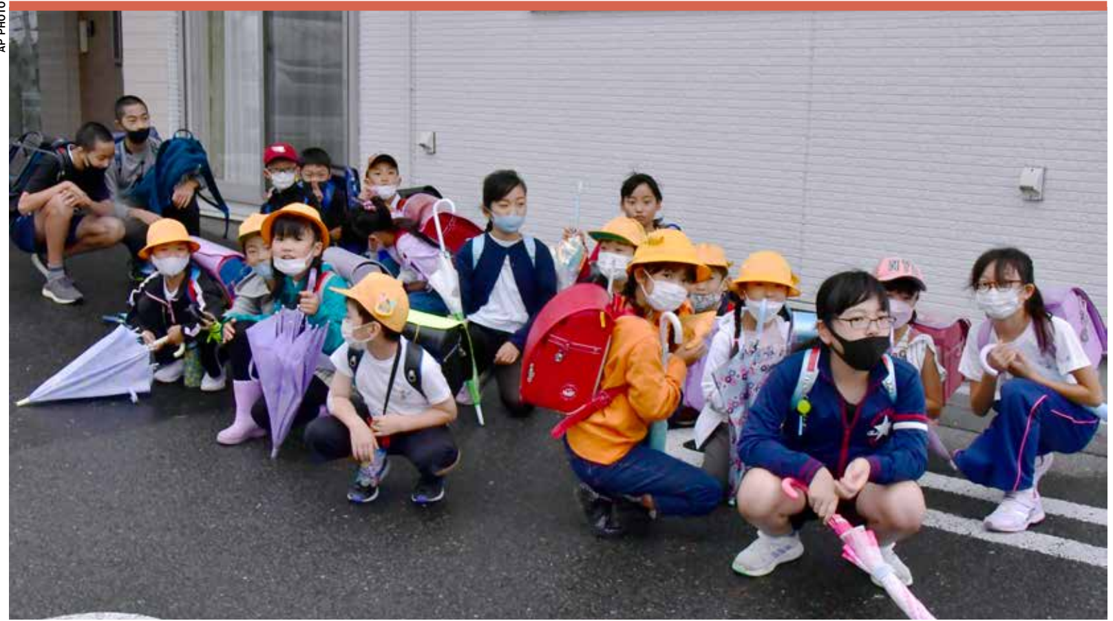
Elementary school students find shelter near a building on their way to school soon after a report of North Korea's missile launch, in Misawa, Aomori prefecture, northern Japan