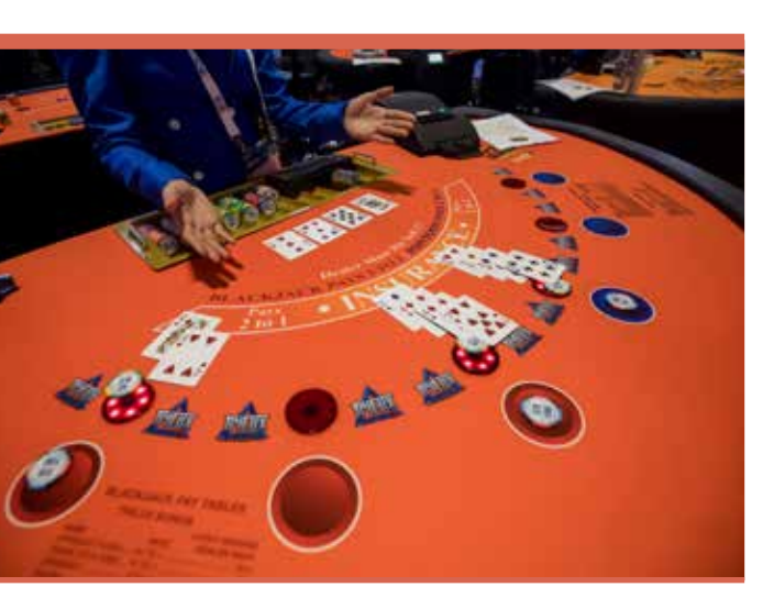
to lookdowns anticipating the r

Although September's revenue rose 35% from the previous month, the base in August was very low as the sector suffered in the wake of the travel halt caused by the city's largest outbreak in mid lung to hub