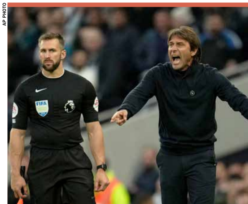
Tottenham's head coach Antonio Conte

That was always the fascinating aspect of his decision to accept the post at Tottenham, a team that