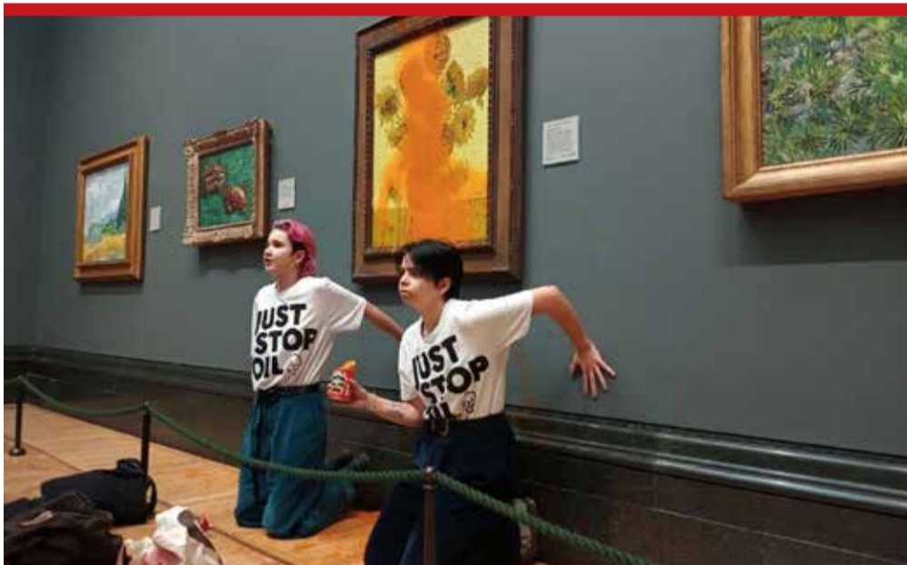
Handout photo issued by Just Stop Oil of two protesters who have thrown tinned soup at Vincent Van Gogh's famous 1888 work Sunflowers at the National Gallery in London last week