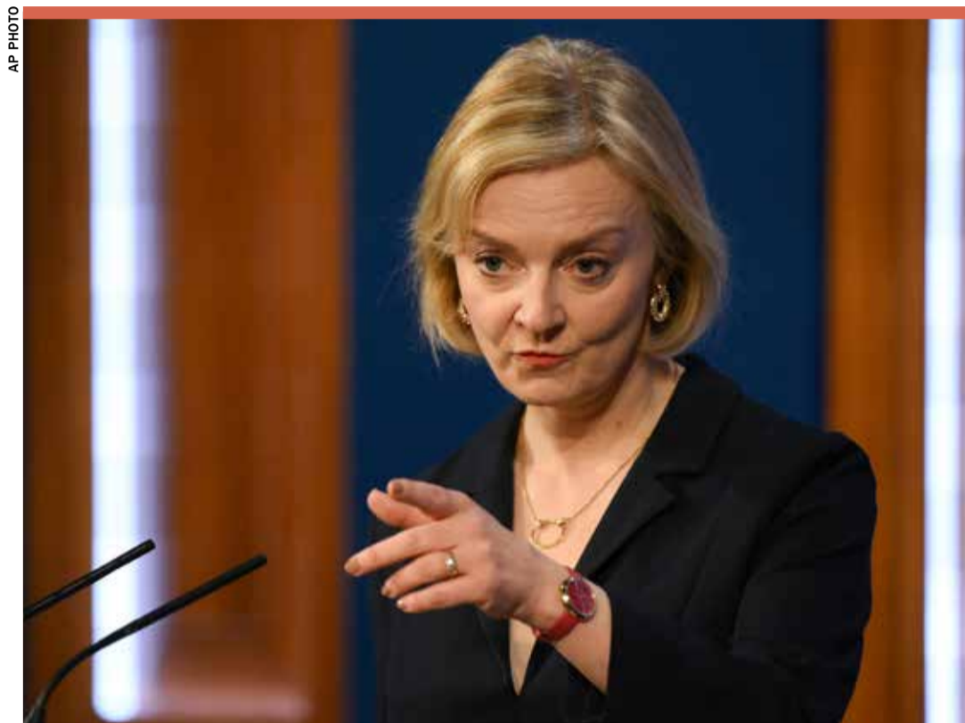
Britain's Prime Minister Liz Truss

Truss initially tried to stay the course after her govern-