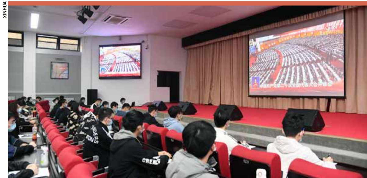
Students at Beijing Jiaotong University gather to watch the opening of the 20th CPC National Congress

Young people should steadfastly follow the Party and its guidance, aim high but stay grou-