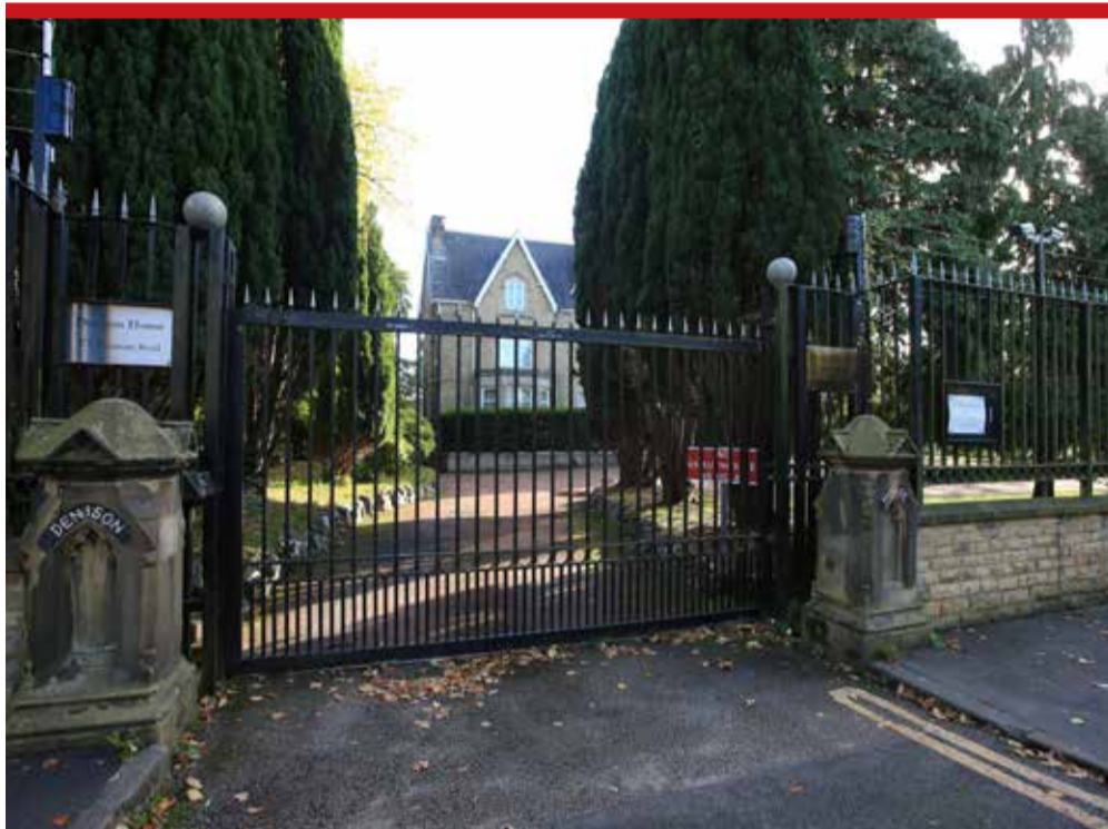
The Chinese consulate in Manchester, England