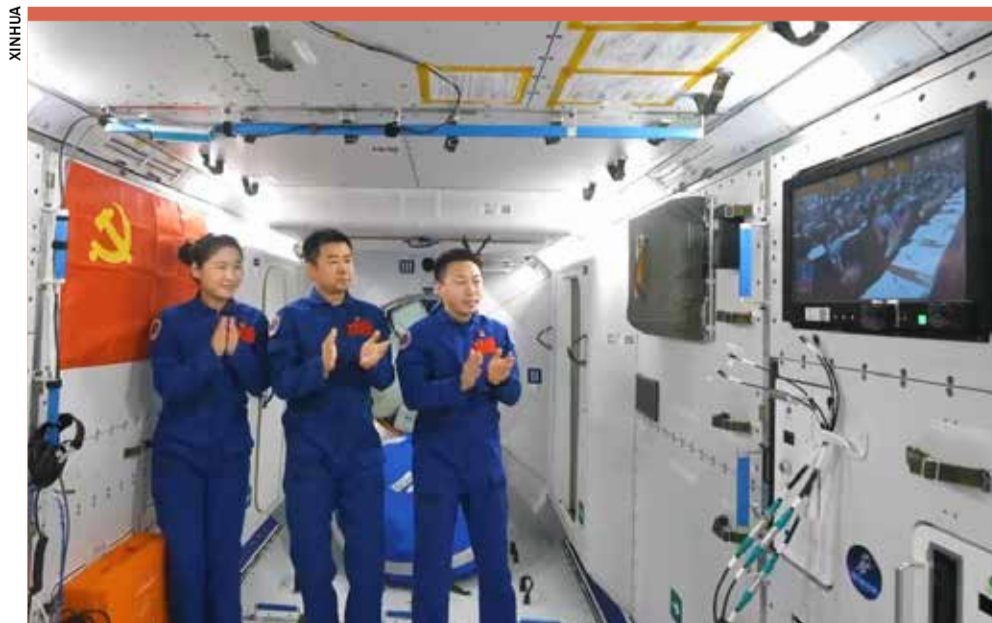
Shenzhou XIV taikonauts Chen Dong (center), Liu Yang (left) and Cai Xuzhe applaud while watching the live broadcast of the opening of the 20th National Congress of the Communist Party of China

Cai Xuzhe said the Mengtian lab will soon be launched into space and they would stay true to their mission, taking careful operation and cooperating with each other to resolutely complete building the space station.