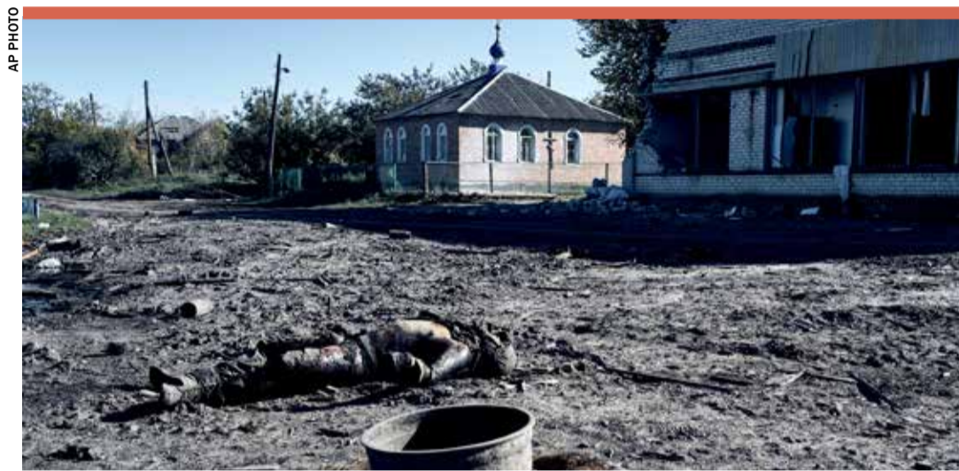
A dead Russian soldier lies on the ground, in the village of Zarechne, Donetsk region

the Ukrainian presidential office, called the evacuation "a propaganda show" and said Russia's claims that Kyiv's forces might shell Kherson were "a rather primitive tactic, given that the Armed Forces do not fire at Ukrainian cities."