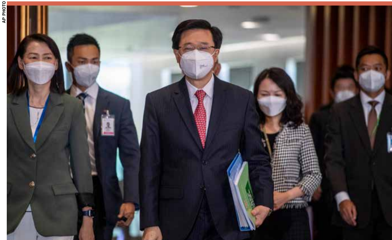
Hong Kong Chief Executive John Lee (center) enters the chamber of the Legislative Council in Hong Kong

The bid to attract talent to Hong Kong comes as hundreds of thousands of residents have left the city in recent years, driven by an ongoing political crackdown and diminished freedoms following the implemen-