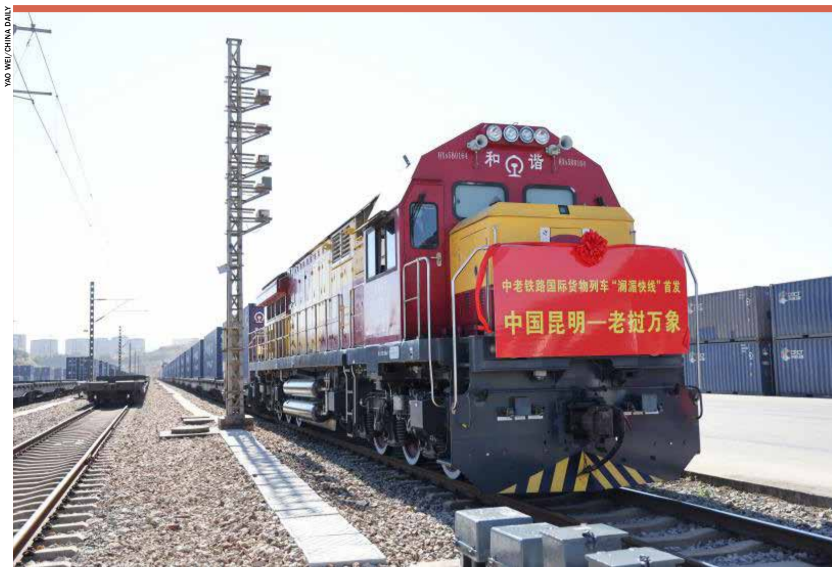
The Lancang-Mekong Express starts its first trip from Kunming in Yunnan province to Laos, the capital of Vientiane, on Jan 10, 2022

China's experience offers “China's solution” and China's inspiration to developing countries that want to develop while maintaining their independence, he added.