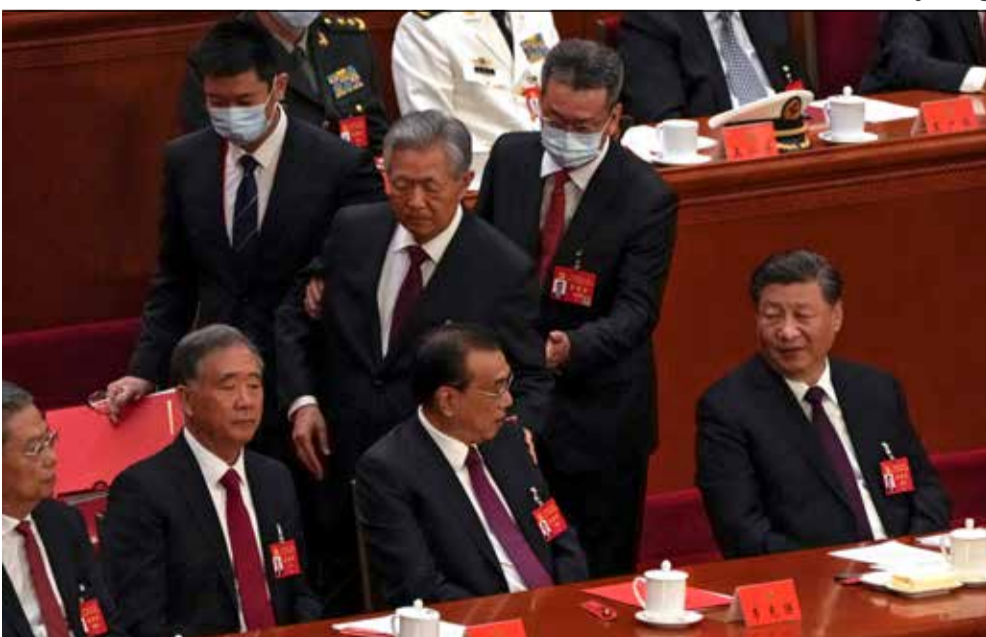
Former Chinese President Hu Jintao (standing at center) is escorted to leave the hall during the closing ceremony of the 20th National Congress of the Communist Party of China in Beijing, Saturday — because he was "not feeling well," according to Xinhua.