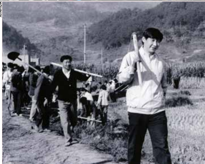
Xi Jinping (right) then secretary of the Ningde Prefecture Committee of the Communist Party of China (CPC), participates in farm work during his investigation in the countryside in 1988