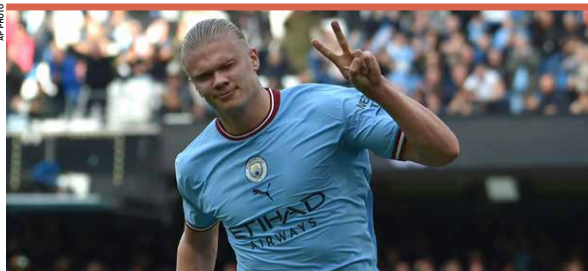
Manchester City's Erling Haaland celebrates after scoring his side's second goal

With 17 goals in the league, Haaland needs just six more to