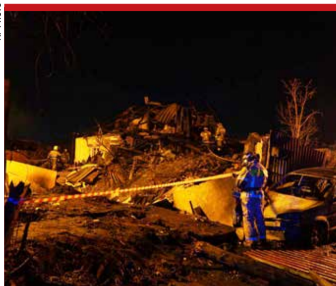
Firefighters work at the scene after a warplane crashed into a residential area in Irkutsk, Russia, yesterday

The United Aircraft Corporation, a state-controlled conglomerate of Russian