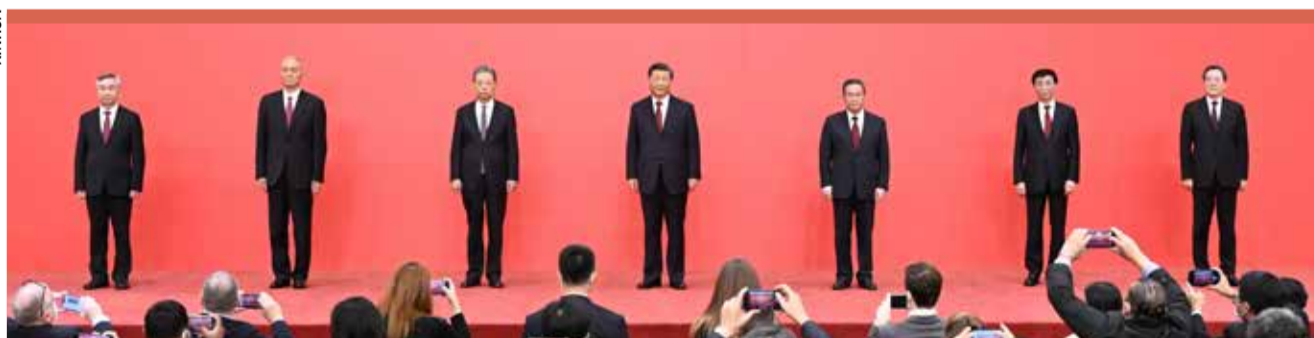
Xi Jinping (center) and the other six members of the Politburo Standing Committee: Li Qiang, Zhao Leji, Wang Huning, Cai Qi, Ding Xuexiang, Li Xi

Committee Secretariat nominated by the Standing Committee of the Political Bureau of the CPC Central Committee.