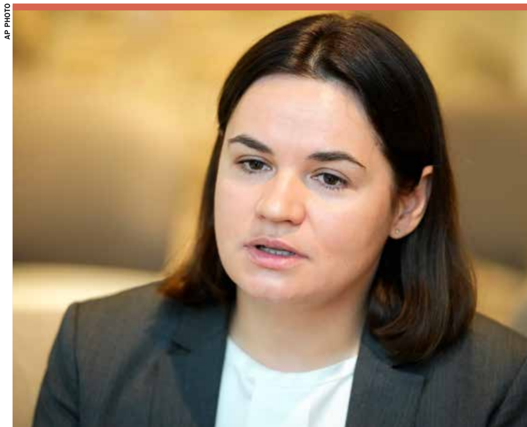
Belarus exiled opposition leader Sviatlana Tsikhanouskaya speaks during her interview with AP in Tallinn, Estonia

Lukashenko has publicly supported Russia's attack on Ukraine, drawing inter-