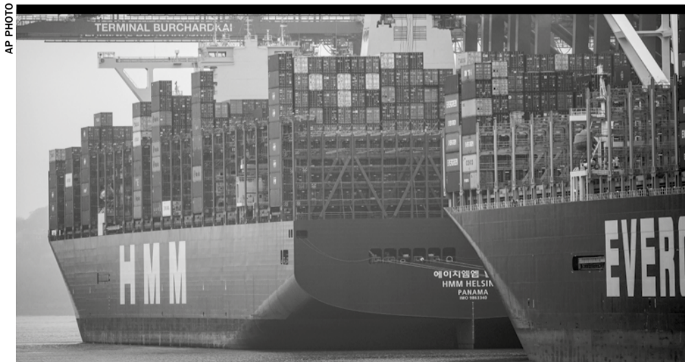
The Terminal Burchardkai at the port in Hamburg

The ministry said the decision was made to prevent a “strategic investment” by COSCO in the terminal and “reduces the acquisition to a purely financial investment.”