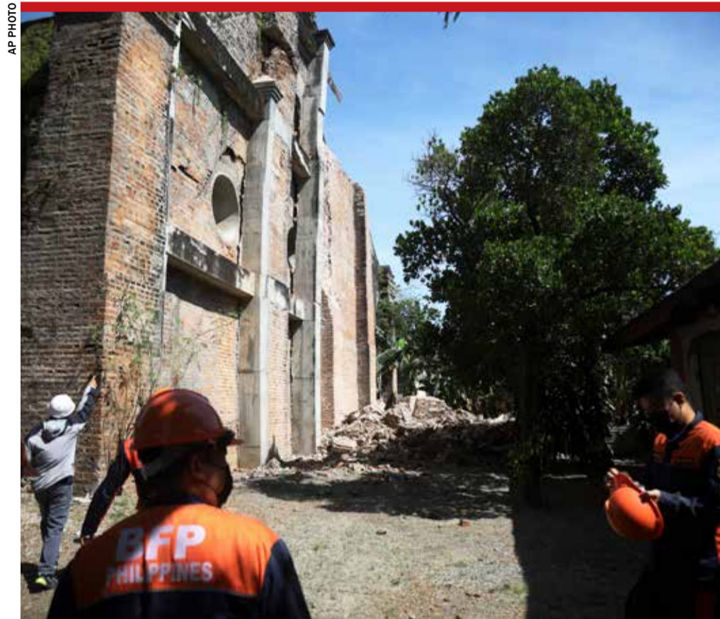
Firemen stand beside a damaged church after a strong earthquake at Ilocos Norte, Northern Philippines, yesterday

The Nobel Foundation said it saw no reason to reconsider its previous decision to leave out the Sweden Democrats, noting that the Nobel Prizes are "based on respect for science, culture, humanism and internationalism."