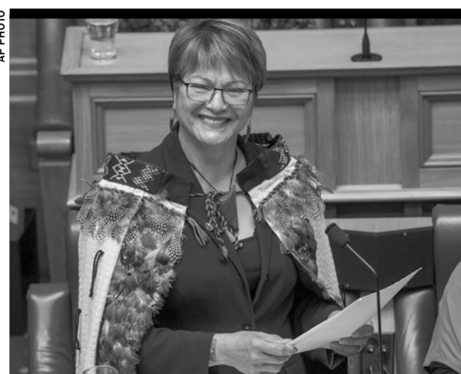
New Labour MP Soraya Peke-Mason smiles during her maiden speech at Parliament in Wellington

F OR the first time in New Zealand's history, a majority of lawmakers are women.