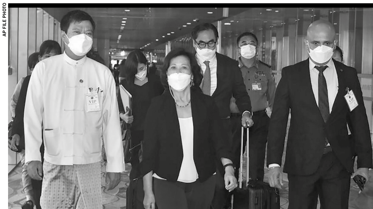
United Nations special envoy for Myanmar Noeleen Heyzer

Heyzer said she made six requests during the meeting with the military's commander-in-chief, including to end aerial bombing and the burning of civilian infrastructure; deliver humanitarian aid without discriminating; release all children and political prisoners; institute a moratorium on executions; en-