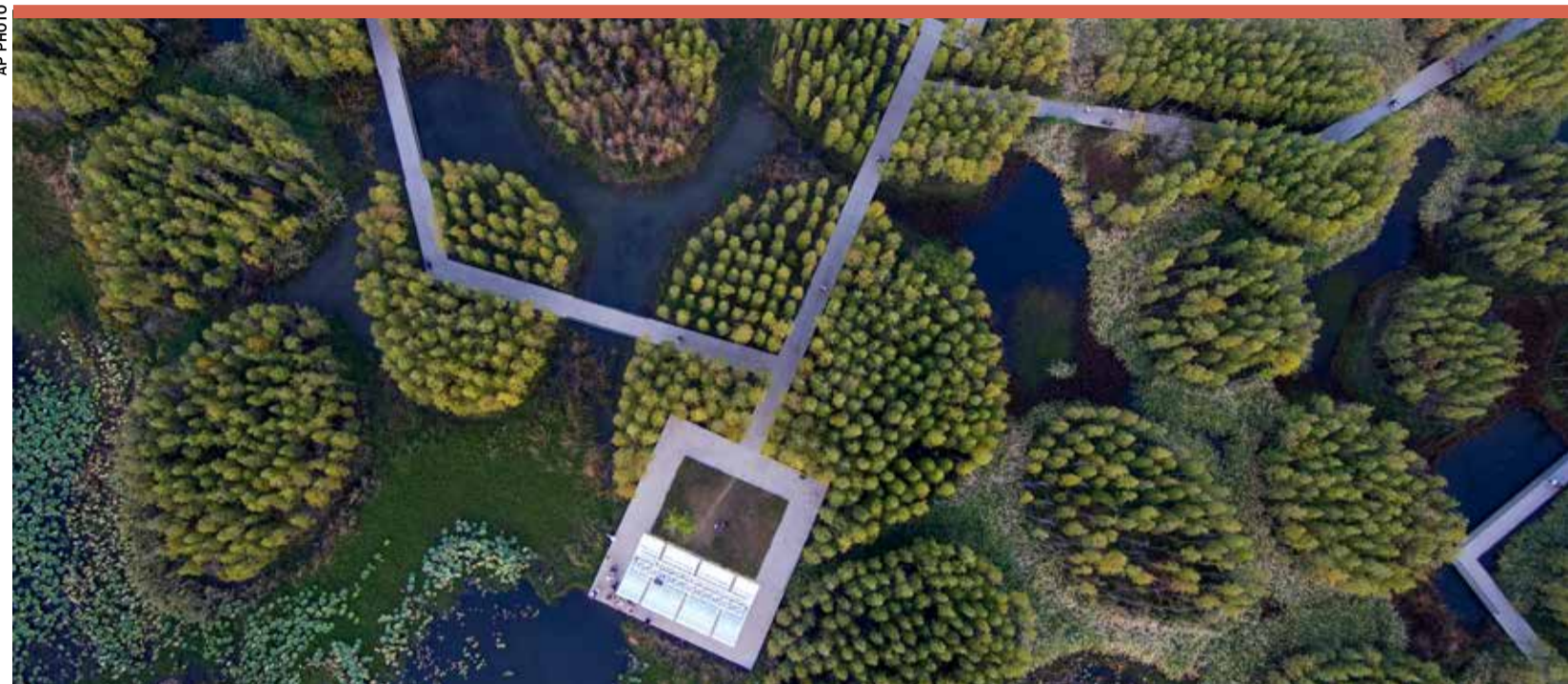
A walkway goes through ponds and islets at the "Fish Tail" sponge park that's built on a former coal ash dump site in Nanchang in Jiangxi province

Instead, Yu proposes using natural resources, or "green infrastructure" to create water-resilient cities. It's part of a global shift among landscape design and civil engineering professionals toward working more in concert with the natural environment. By creating large spaces to hold water in city centers — such as parks and ponds — stormwater can be retained on site, helping prevent floods, he says. Sponge infrastructure also, in theory, offers ways for