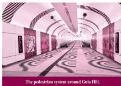
The pedestrian system around Gula Hill.