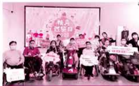
Enhance support for the use of assistive equipment for persons with disabilities, to improve quality of life and care.