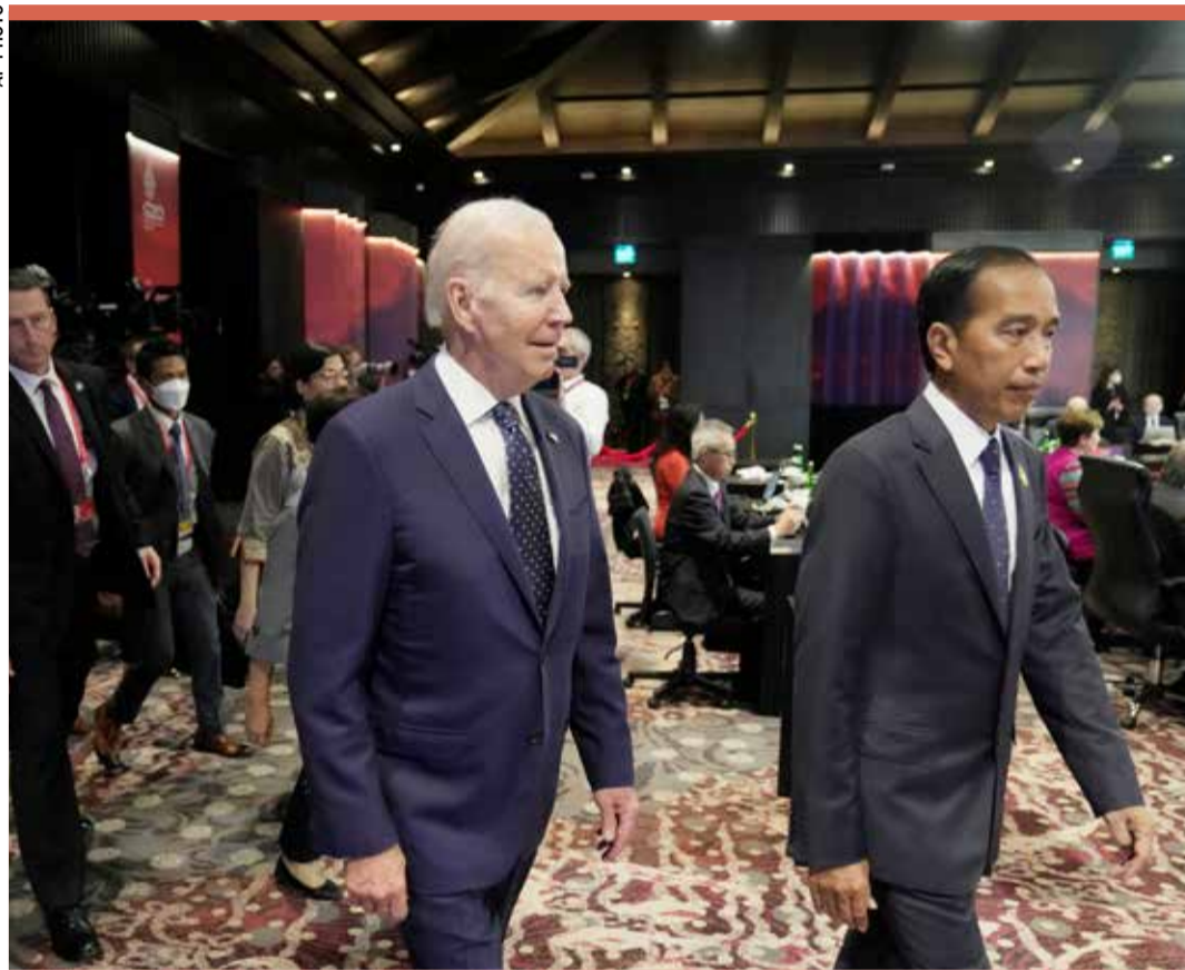
U.S. President Joe Biden (left) and Indonesia President Joko Widodo

A senior U.S. administration official, speaking on the condition of anonymity to discuss the summit, said yesterday that the summit's final communique will make clear that "most" of the nations condemn Russia's invasion