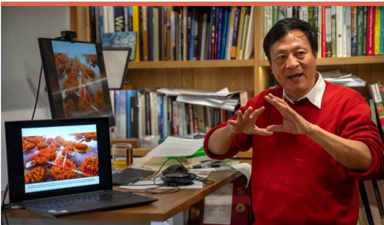
Architect Yu Kongjian at his firm's office in Beijing

surrounding neighborhoods and business districts. The fly ash, a byproduct of coal combustion, was mixed with soil to create mini-islands in the lake that allow water to permeate. Fang said the mixture, held in place by plant roots, prevents the ash from flowing into the water. Whether it prevents the