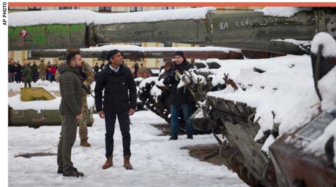
Ukrainian President Volodymyr Zelenskyy, left, and British Prime Minister Rishi Sunak observe destroyed Russian military vehicles installed in downtown Kyiv, Ukraine, Saturday

Former U.K. Prime Minister Boris Johnson, who stepped down in July, won wide praise in Ukraine for his backing. Sunak is keen to reassure Ukrai-