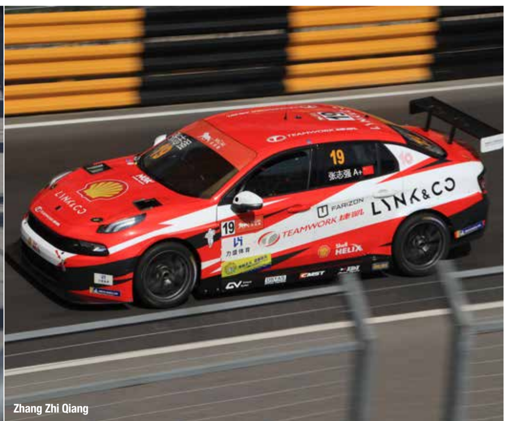
Zhang Zhi Qiang

day just behind Zhang Zhi Qiang in a Lynk & Co 03 TCR that had been the