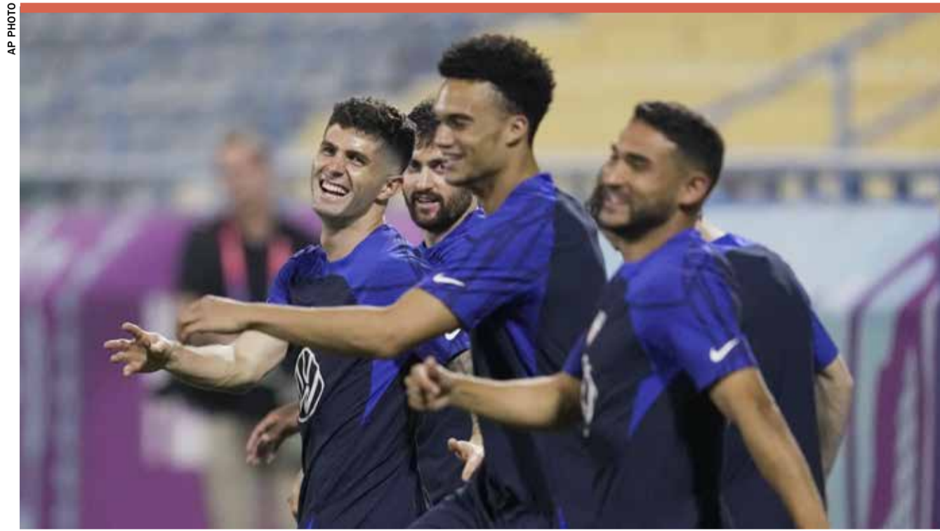
United States forward Christian Pulisic (left) and other players participate in an official training session at Al-Gharafa SC Stadium, in Doha

A Friday match against England follows and group play ends Nov. 29 against Iran, which famously eliminated the U.S. from the 1998 World Cup in France.