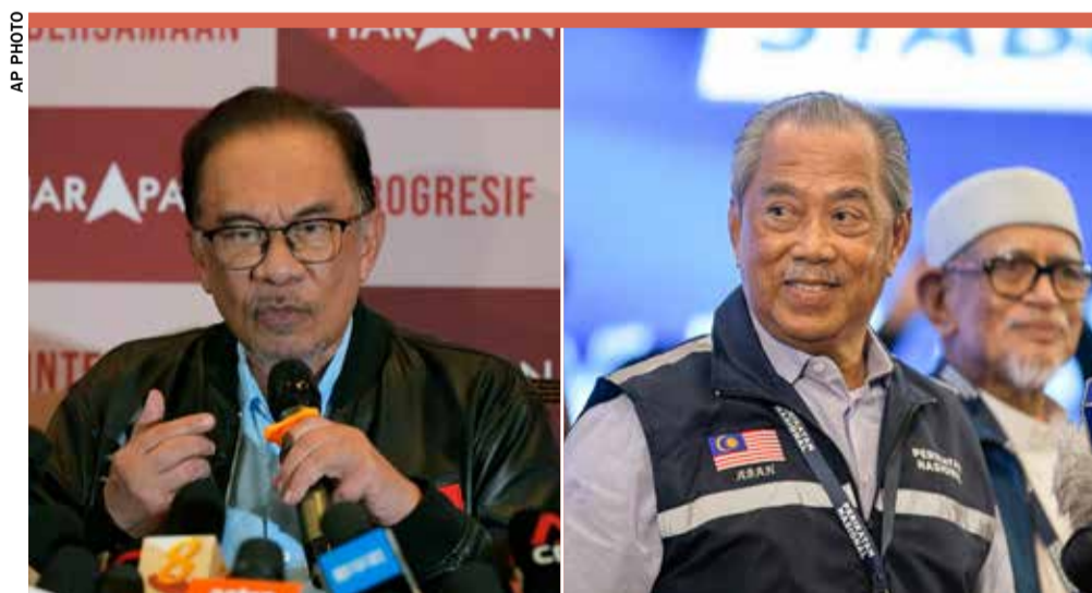
Malaysian opposition leader Anwar Ibrahim (left) and Perikatan Nasional (National Alliance) President Muhyiddin Yassin

The Malay-centric Perikatan Nasional, or National Alliance, led by former Prime Minister Muhyiddin Yassin, was an underdog that enjoyed an unexpected surge of support with 73 out of 222 Parliamentary seats.