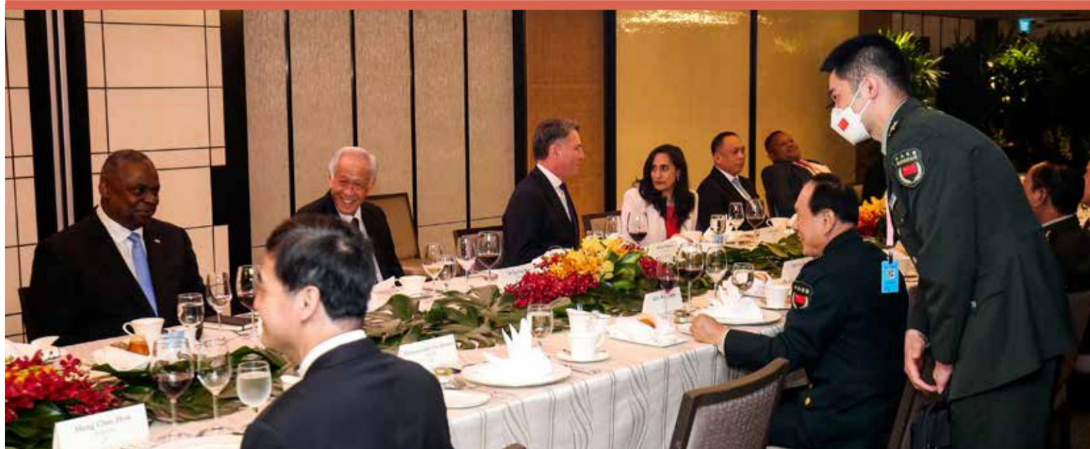
FILE - China's Defense Minister, Gen. Wei Fenghe, center right, talks with U.S. Secretary of Defense Lloyd Austin, left, during the 19th International Institute for Strategic Studies (IISS) Shangri-la Dialogue, Asia's premier defense forum, in Singapore