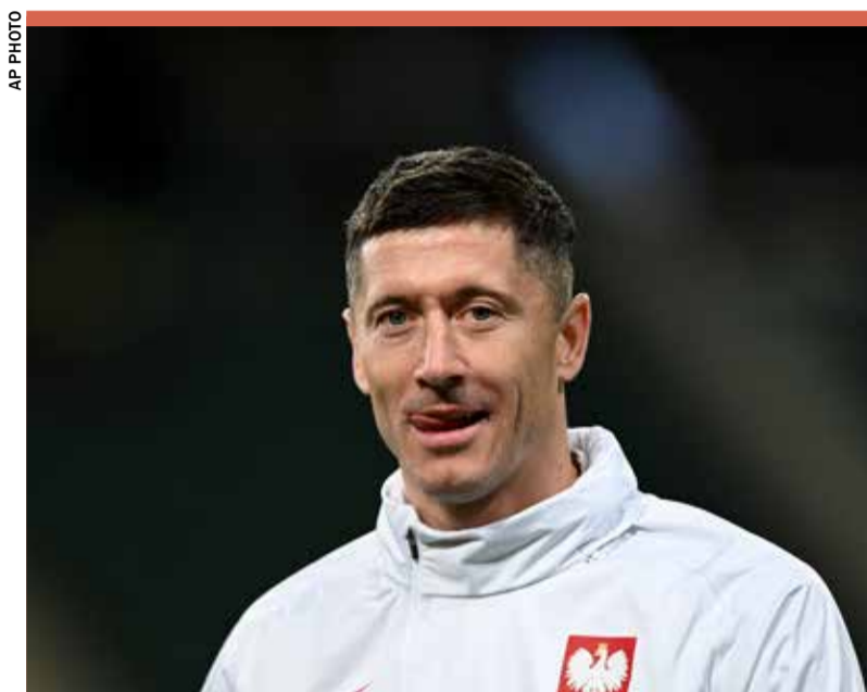
Poland star Robert Lewandowski

Poland, ranked No. 26 in the world, didn't even make the 2010 or 2014 World Cups and the team