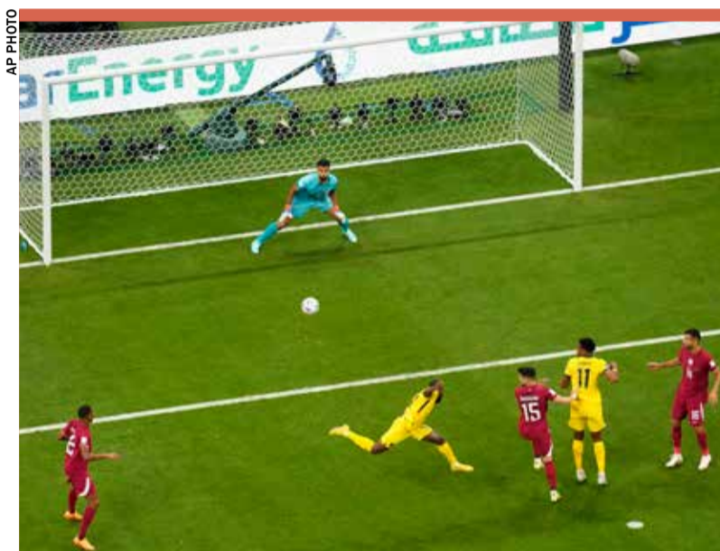
Ecuador's Enner Valencia heads the ball to score his side's second goal

The match took place after a colorful 30-minute opening