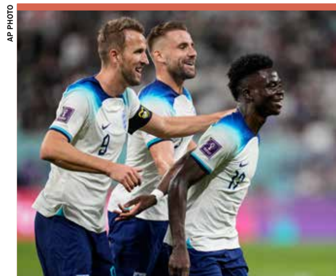
England's Bukayo Saka (right) celebrates with teammates after scoring his side's fourth goal

The game was delayed for several minutes in the first half when Iran goalkeeper Ali Beiranvand clashed heads with a teammate. He was eventually taken off the field on a stretcher with the score still 0-0.