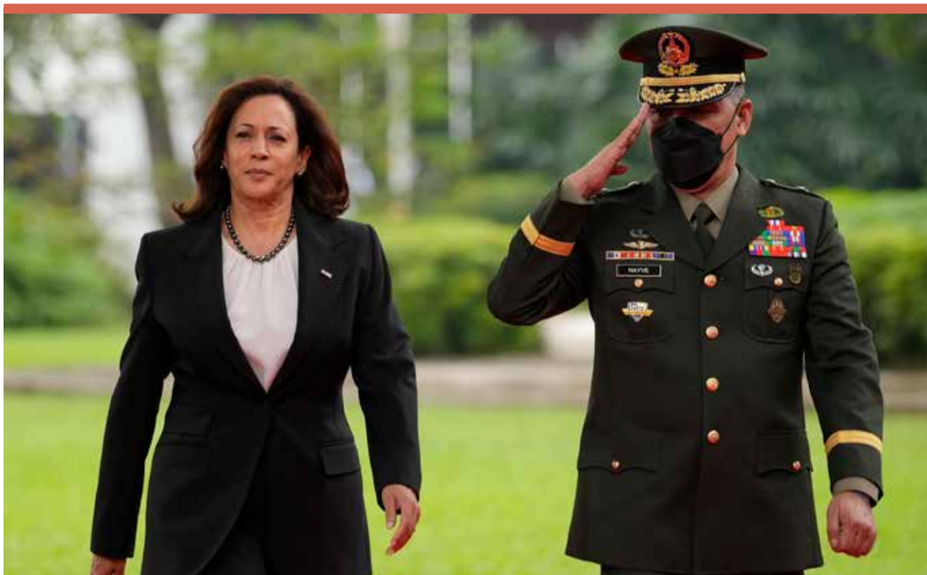
U.S. Vice President Kamala Harris, left, reviews an honor guard at the Malacanang presidential palace in Manila, yesterday

rehouses, living quarters, joint training facilities and store combat equipment, except nuclear arms. The Philippines could take over those buildings and facilities when the Americans leave.