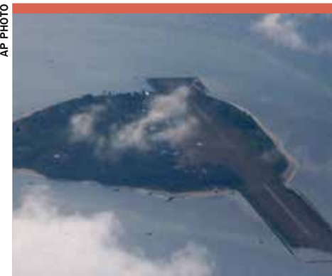
Thitu Island off the South China Sea on April 21, 2017