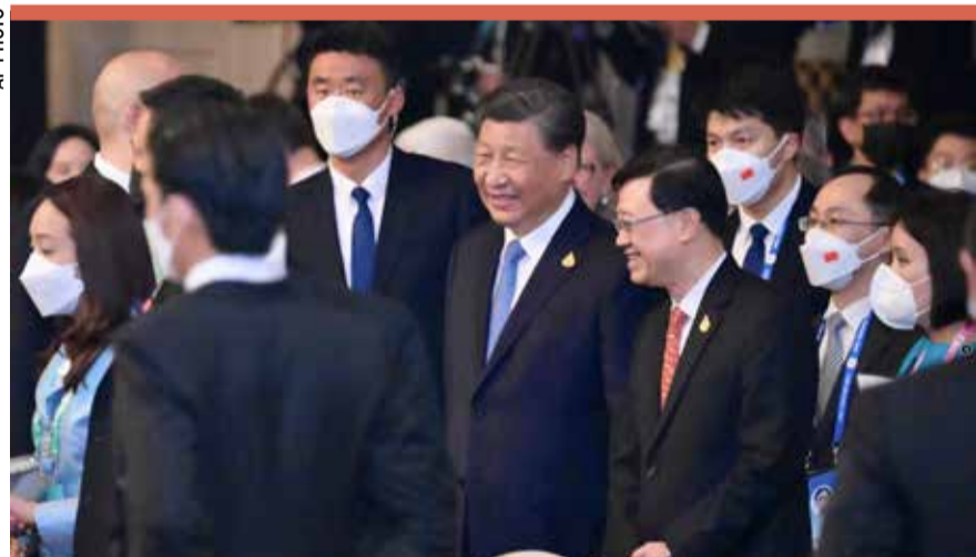
Hong Kong Chief Executive John Lee (center right) stands next to President Xi Jinping during a gala dinner at the APEC Summit in Bangkok, on Nov. 17

Guangdong province, home to Guangzhou, reported the largest number of new cases Monday with 9,085 out of a total of 27,095 cases nationwide.