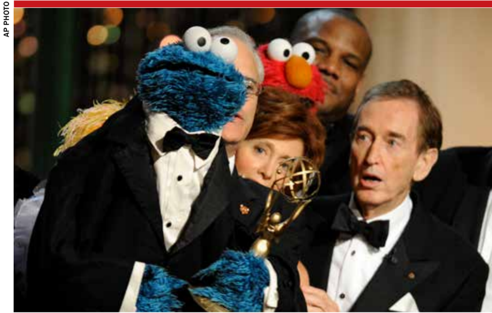
Bob McGrath (right) looks at the Cookie Monster as they accept the Lifetime Achievement Award for “Sesame Street” at the Daytime Emmy Awards in August 2009, in Los Angeles

He also urged town residents to show solidarity and take in those fleeing their homes to avoid being killed by “merciless gangs” and “be with them during these difficult times.”