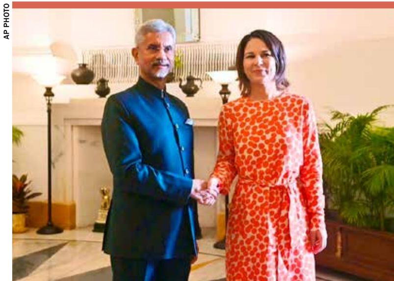
Jaishankar and German Foreign Minister Annalena Baerbock, pose for a photograph during their meeting in New Delhi, yesterday