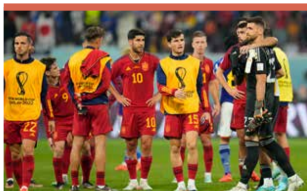
Spain players leave the pitch at the end of the World Cup group E loss against Japan

Few expected Spain would have such a hard time getting through the group stage in Qatar after opening with a 7-0 thrashing of Costa Rica.