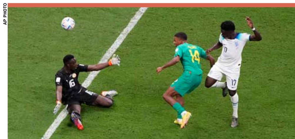
England's Bukayo Saka, right, scores his side's 3rd goal

It certainly was a good time for Kane to end his dry spell in Qatar because Kylian Mbappe, the tournament's leading scorer with five goals, is waiting to face England on Saturday at Al