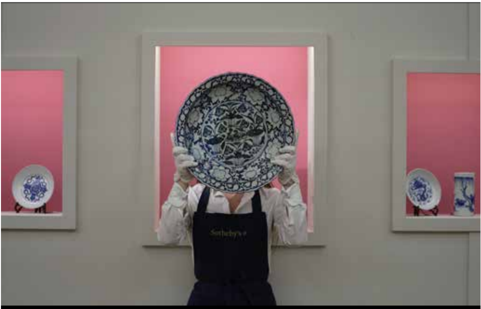
Piece of work. A member of staff holds the moulded “mandarin duck and lotus pond” dish in Chinese Yuan dynasty, from the collection of the late Sir Joseph Hotung, on display during a media preview of Sotheby’s auction, in London, yesterday. The piece, valued at 700,000-1,000,000 pounds and will go on auction on Dec. 7 and 8.