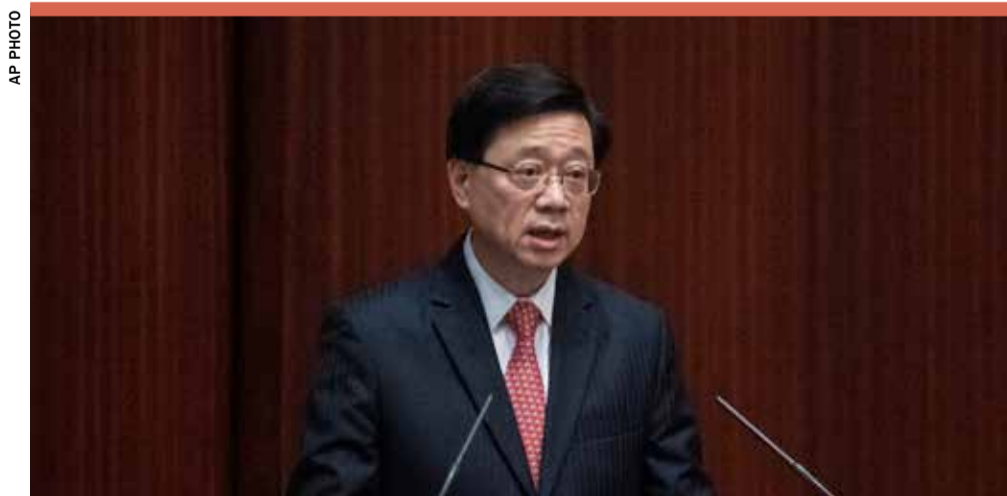
HK Chief Executive John Lee

The comments by John Lee, Hong Kong's chief executive, followed several big sporting events — including a rugby tournament in South Korea and powerlifting event in Dubai — where the pro-democracy protest song "Glory to Hong Kong" was played as the city's anthem instead of the Chinese national anthem, "March of the Volunteers."