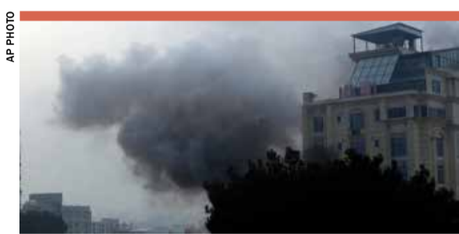
Smoke rises from a hotel building after an explosion and gunfire in the city of Kabul, Monday

Hours later, the regional affiliate of the Islamic State group — a key rival of the Taliban since they seized