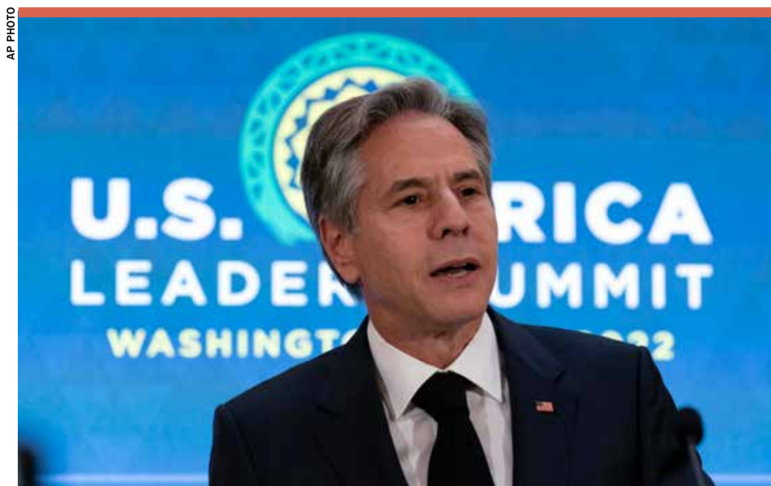
U.S. Secretary of State Antony Blinken speaks during U.S. Africa leaders Summit at Department of State in Washington

curity adviser Jake Sullivan yesterday [Macau time] also said that the administration would commit to spending $55 billion in Africa over the next three years on "a wide range of sectors to tackle the core challenges of our time."