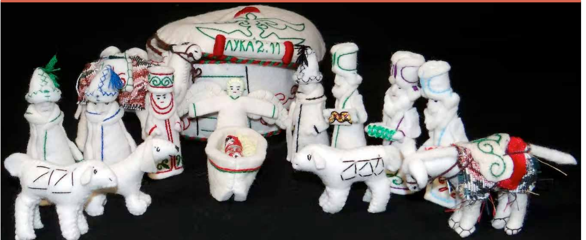
A handmade Nativity from Kyrgyzstan by an unknown artisan. Instead of a stable, it features a yurt, the traditional home of nomadic Kyrgyz people