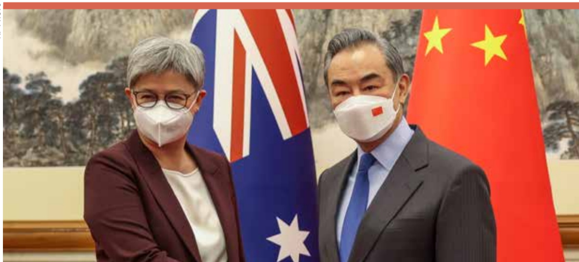
Foreign Minister Wang Yi welcomes Australian Foreign Minister Penny Wong in Beijing, yesterday

thaw in relations between the two nations since Australian Prime Minister Anthony Albanese won an election victory in May, replacing the more conservative Scott Morrison in the top role.