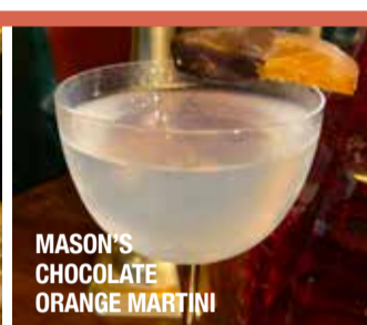
MASON'S CHOCOLATE ORANGE MARTINI