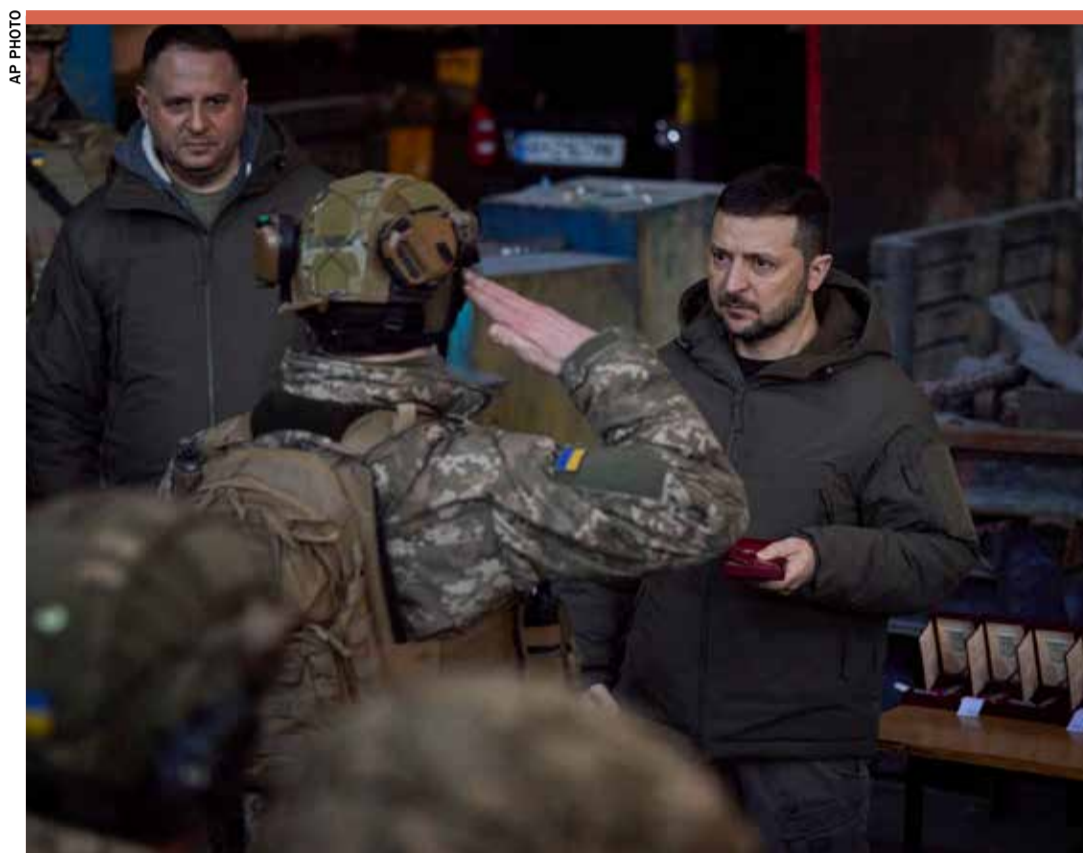
Ukrainian President Volodymyr Zelenskyy (right) awards a serviceman at the site of the heaviest battles with the Russian invaders in Bakhmut

"The visit will underscore the United States' steadfast commitment to supporting