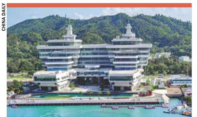
Zhuhai Yunzhou Intelligence Technology, headquartered in Zhuhai, focuses on manufacturing multifunctional unmanned boats and above-water robots

The robot's controller resembles a pistol, with a screen displaying the device's speed, battery level, and other data. Holding the controller, rescue workers command the robot via microwaves, and it can be used for rescue work up to 800 meters offshore.