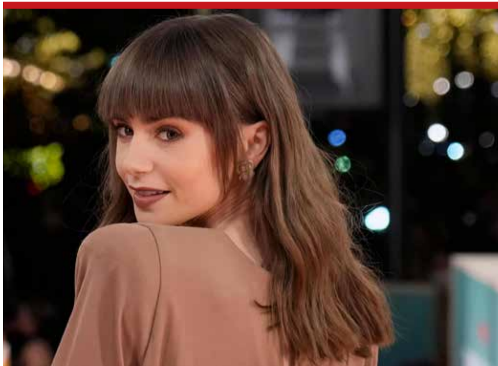
Lily Collins arrives the World Premiere of the Netflix Series "Emily in Paris" season 3, at the Theatre des Champs Elysees, in Paris