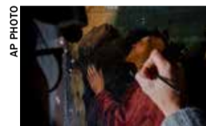
USA When most people think of “carpaccio,” they think of the thinly sliced raw beef appetizer made famous by Venice’s iconic Harry’s Bar. Few people know that the dish is named for a lesser-known Venetian, the Renaissance painter Vittore Carpaccio, because of the intense red hues he favored. Carpaccio the painter has recently been getting more attention outside his native Venice. In November, the National Gallery in Washington inaugurated the first retrospective exhibit of his work outside Italy. The show, “Vittore Carpaccio: Master Storyteller of Renaissance Venice,” is set to move to Venice’s showcase Palazzo Ducale on March 18.