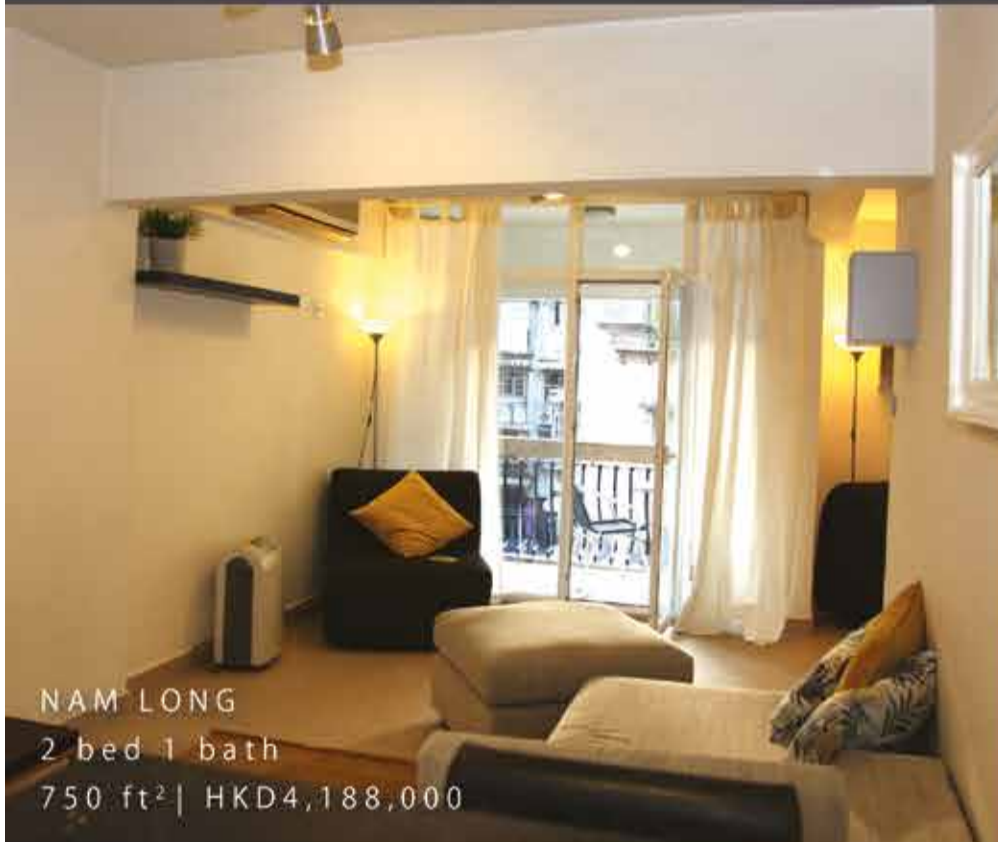
NAM LONG 2 bed 1 bath 750 ft 2 | HKD4,188,000