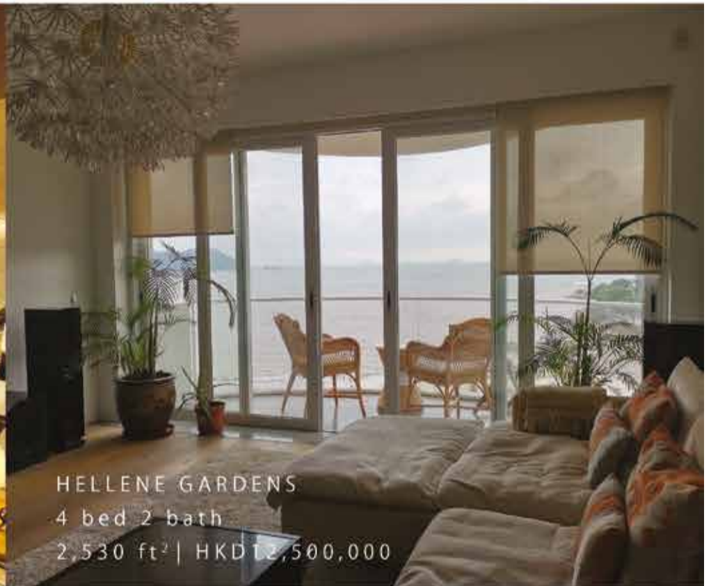
HELLENE GARDENS 4 bed 2 bath 2,530 ft 2 | HKD12,500,000