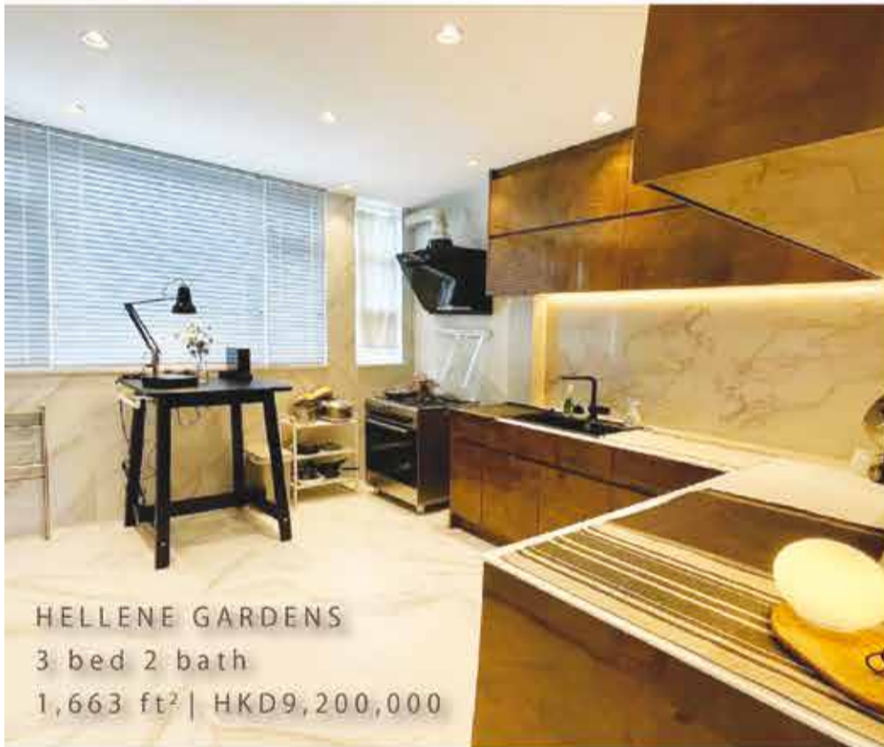
HELLENE GARDENS 3 bed 2 bath 1,663 ft 2 | HKD9,200,000