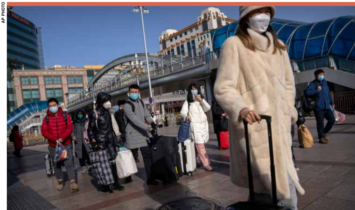
CNY warm up: Travelers wearing face masks walk toward the entrance of the Beijing Railway Station in Beijing