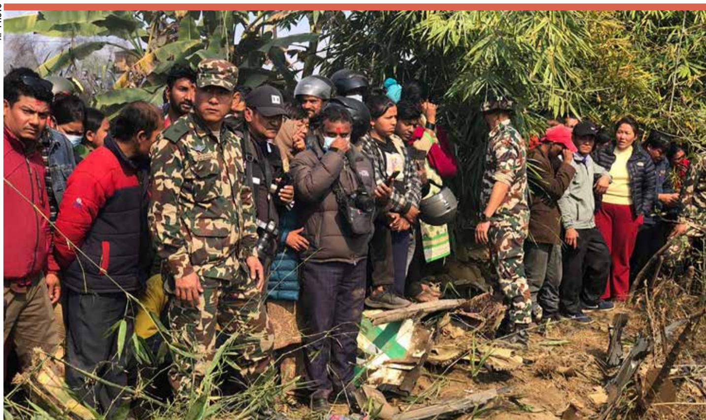
Locals watch the wreckage of a passenger plane in resort town Pokhara yesterday