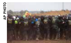
Germany Thousands of people demonstrated in persistent rain this weekend to protest the clearance and demolition of the Luetzerath village in western Germany that is due to make way for the expansion of a coal mine. There were standoffs with police as some protesters tried to reach the edge of the mine and the village itself. Swedish climate campaigner Greta Thunberg joined the demonstrators who chanted “Every village stays” and “You are not alone.”

Meanwhile, Dirt Jr. — or D.J. — another rescue cat, still resides at the museum. MDT/AP