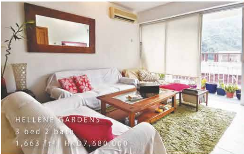
HELLENE GARDENS 3 bed 2 bath 1,663 ft 2 | HKD7,680,000