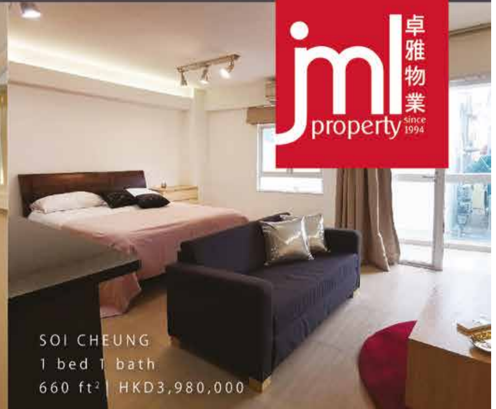
SOI CHEUNG 1 bed 1 bath 660 ft 2 | HKD3,980,000