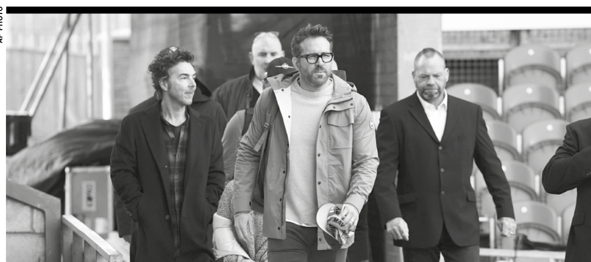
Wrexham co-owner, actor Ryan Reynolds arrives prior to the English FA Cup 4th round Soccer match between Wrexham and Sheffield United

Reynolds and one of his daughters flew in for the fourth-round match at the atmospheric Racecourse Ground in north Wales, about 28 miles south of Liver-