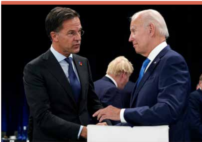
Netherlands Prime Minister Mark Rutte (left) and U.S. President Joe Biden during a round table meeting at a NATO summit in Madrid, Spain, last June

used to make advanced computer chips, a person familiar with the agreement told The Associated Press yesterday [Macau time].