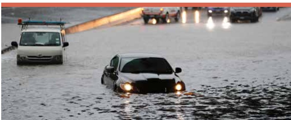
Vehicles are stranded by flood water in Auckland, Saturday

nding districts was lifted yesterday morning. But Auckland Mayor Wayne Brown warned that dangerous conditions were forecast to return today.