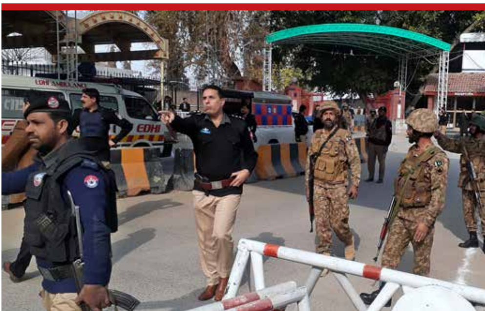
Army soldiers and police officers clear the way for ambulances rushing toward a bomb explosion site, at the main entry gate of police offices, in Peshawar, yesterday