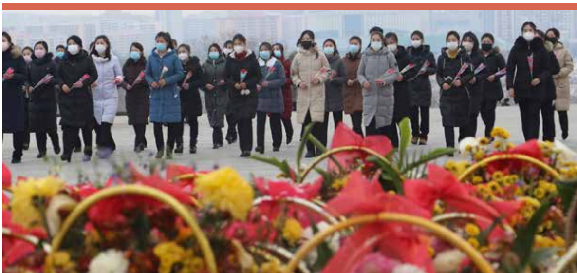
North Koreans visit and pay respect to the statues of late leaders Kim Il Sung and Kim Jong Il on Mansu Hill in Pyongyang, last week

news website, cited a North Korean government notice to report that health officials had imposed a five-day lockdown in Pyongyang in an effort to stem the spread of respiratory illnesses.