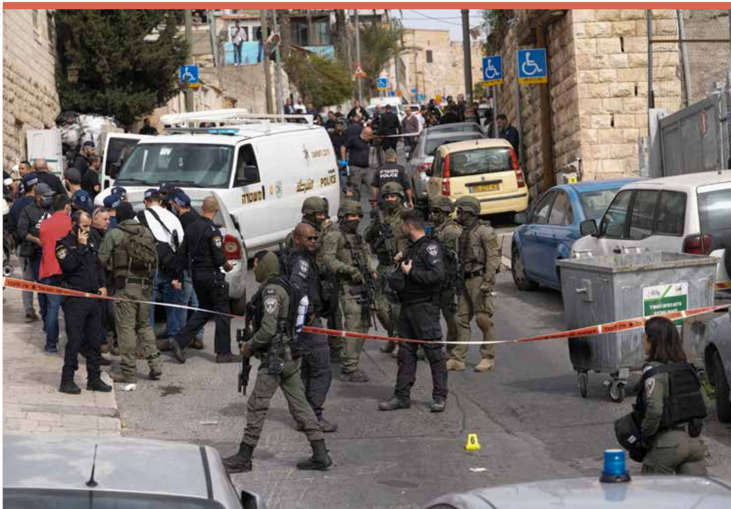
An Israeli policeman secures a shooting attack site in east Jerusalem