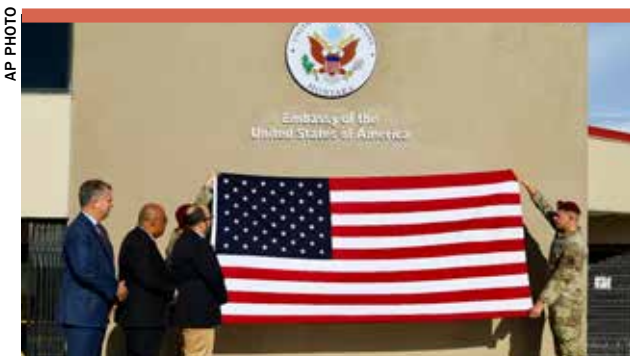
A flag raising ceremony took place yesterday to celebrate the opening of the U.S. embassy in Honiara of the Solomon Islands

The Solomon Islands switched allegiance from the self-ruled island of Taiwan to Beijing in 2019, threatening the close ties with the U.S. that date to World War II.