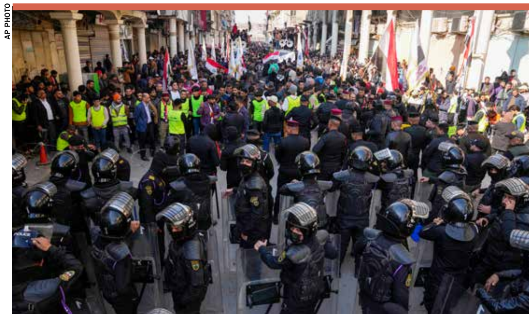
Security forces stand guard during a demonstration in front of the Iraqi central bank as currency plummets against the U.S. dollar, in Baghdad, last week

Since the U.S. invasion of Iraq in 2003, Iraq's foreign currency reserves have been housed at the United States' Federal Reserve, giving the Americans significant control over Iraq's supply of dollars. The Central Bank of Iraq requests dollars from the Fed and then sells them to commercial banks and