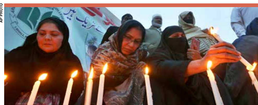
Women light candles during a prayer ceremony for victims of Monday's suicide bombing inside a mosque, in Peshawar

During a ceremony to inaugurate a drug addiction treatment center in the capital of Kabul, Muttaqi asked Pakistan's government to launch a serious