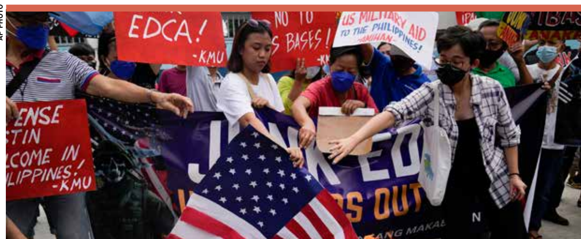
Not everybody agrees: Demonstrators burn a mock U.S. flag as they protest against the visit of U.S. Defense Secretary in Manila

The allies also said in a joint statement that "substantial" progress has been made in projects at five Philippine military bases, where U.S. military personnel were earlier granted access by Filipino officials under the Enhanced Defense Cooperation Agreement, or EDCA. Construction of American facilities in the camps has been underway for years but has been hampered by unspecified local issues.