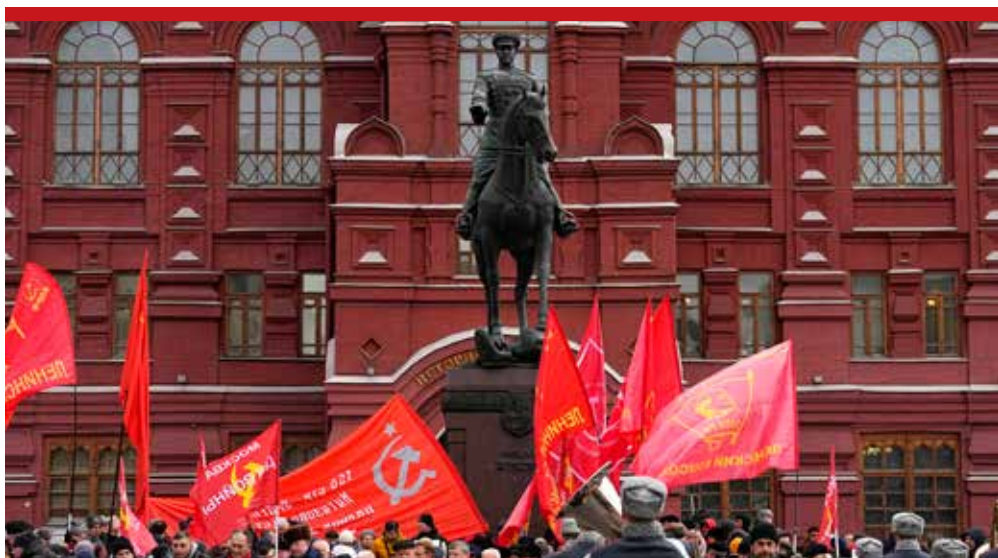
Communist's party supporters near the Kremlin Wall attending commemorations marking the 80th anniversary of the Soviet victory in the battle of Stalingrad, in Moscow yesterday