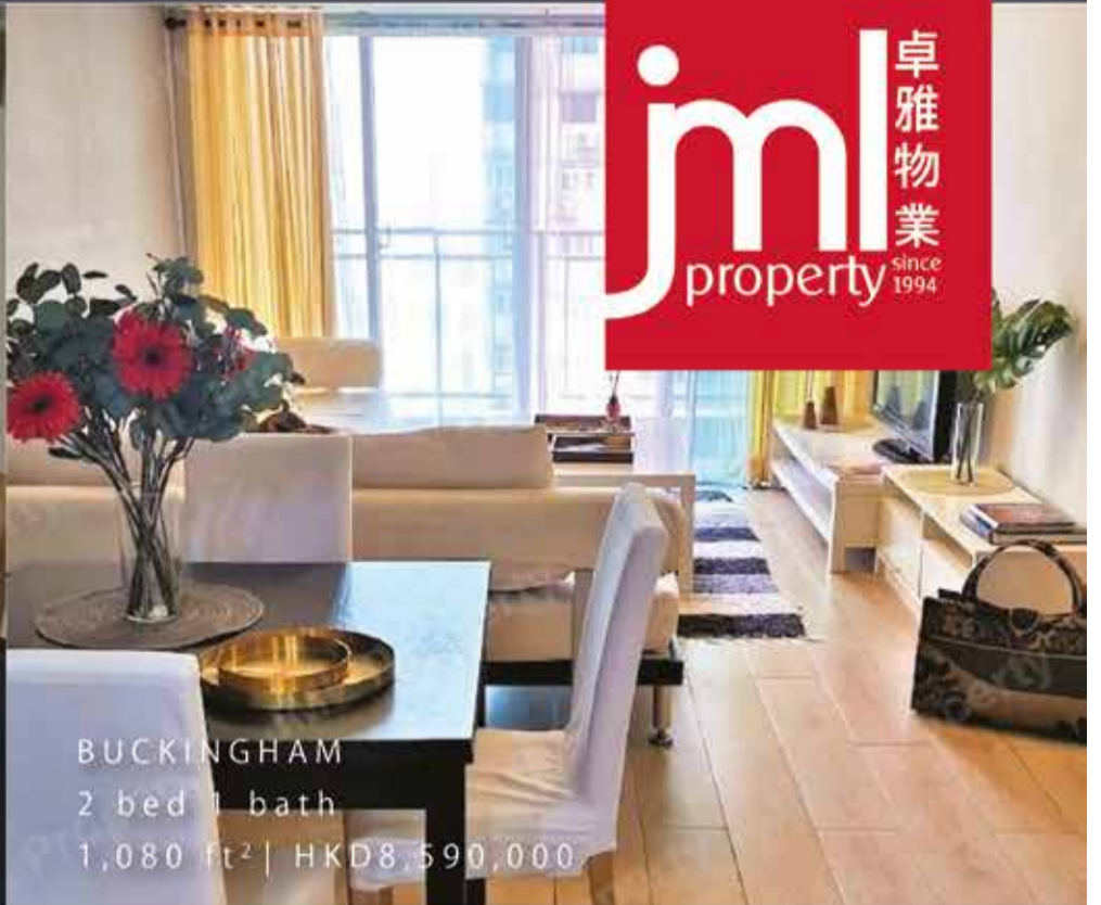
BUCKINGHAM 2 bed 1 bath 1,080 ft 2 | HKD8,590,000