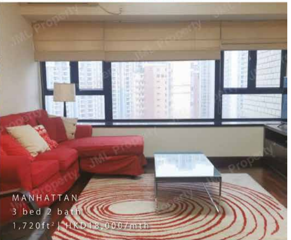
MANHATTAN 3 bed 2 bath 1,720ft 2 | HKD18,000/mth