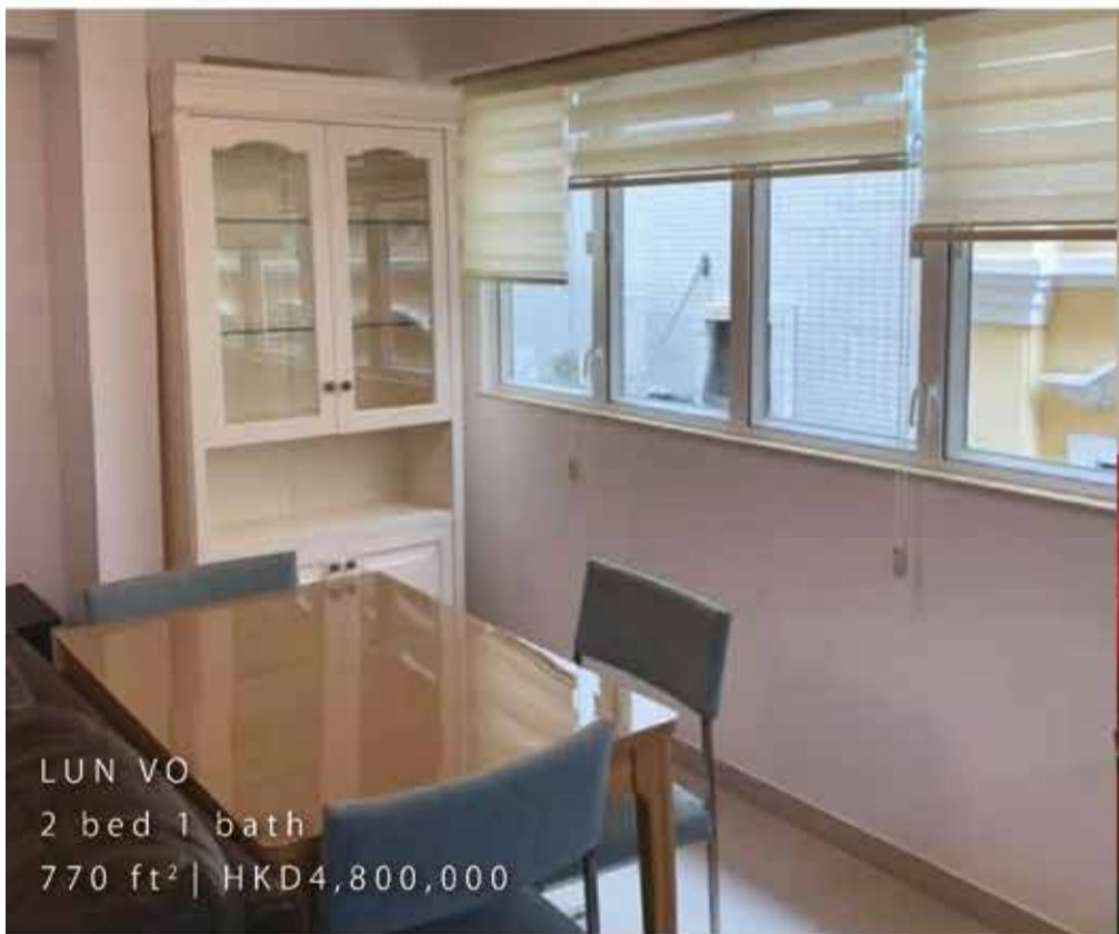
LUN VO 2 bed 1 bath 770 ft 2 | HKD4,800,000