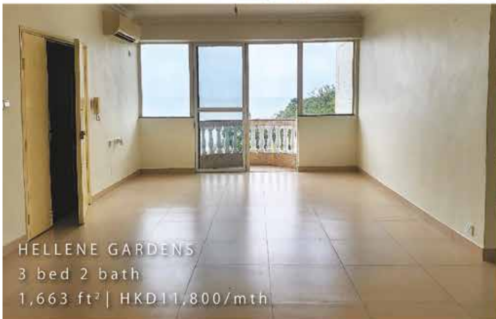
HELLENE GARDENS 3 bed 2 bath 1,663 ft 2 | HKD11,800/mth