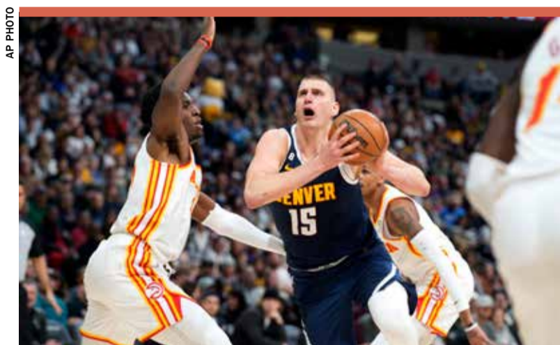
Denver Nuggets center Nikola Jokic, right, drives to the rim as Atlanta Hawks forward Onyeka Okongwu defends in the second half of an NBA basketball game Saturday, Feb. 4, 2023, in Denver

"We can't underestimate any team. We've got to come prepared. We've got a target on our backs," Murray said. "We've seen that,