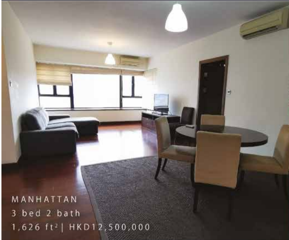
MANHATTAN 3 bed 2 bath 1,626 ft 2 | HKD12,500,000