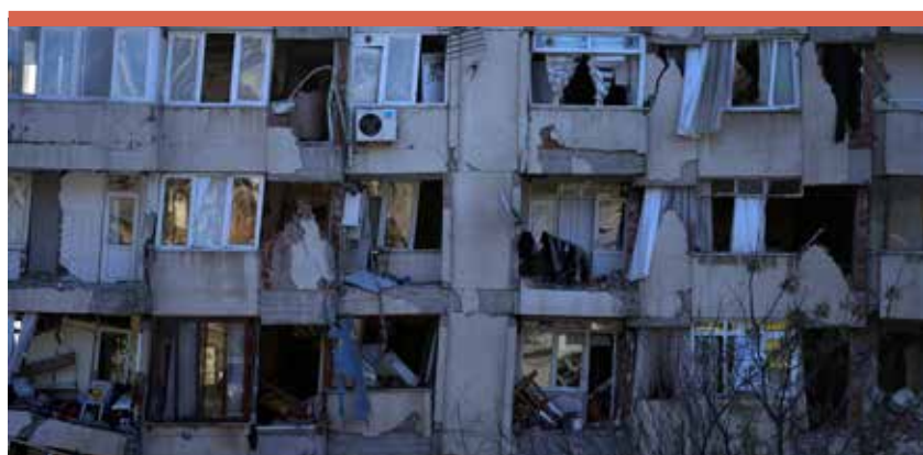
FILE - A destroyed building in Antakya, southern Turkey, Wednesday, Feb. 8, 2023.