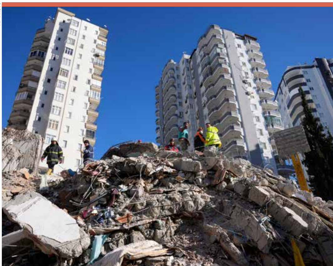
Emergency teams search for people in the rubble of a destroyed building in Adana, southern Turkey

A day earlier, Turkey's Justice Ministry announced the