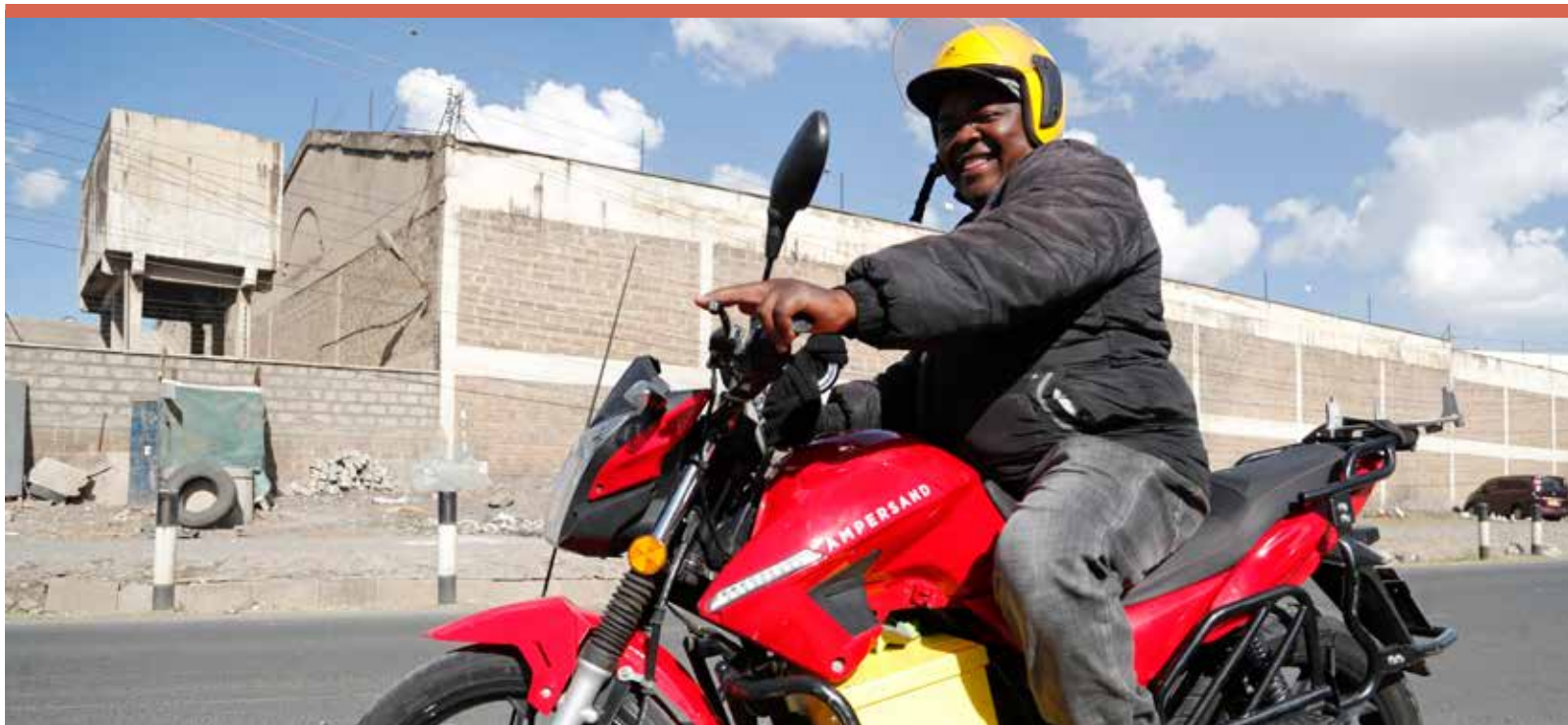
A man rides an electric motorcycle from Ampersand on a test drive in Nairobi