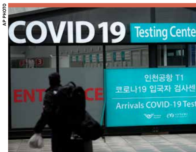
A traveler walks outside of a COVID-19 testing center at the Incheon International Airport in Incheon, South Korea, last week

quired all passengers from China, Hong Kong and Macau to submit proof of negative tests taken with 48 hours before their arrival and put