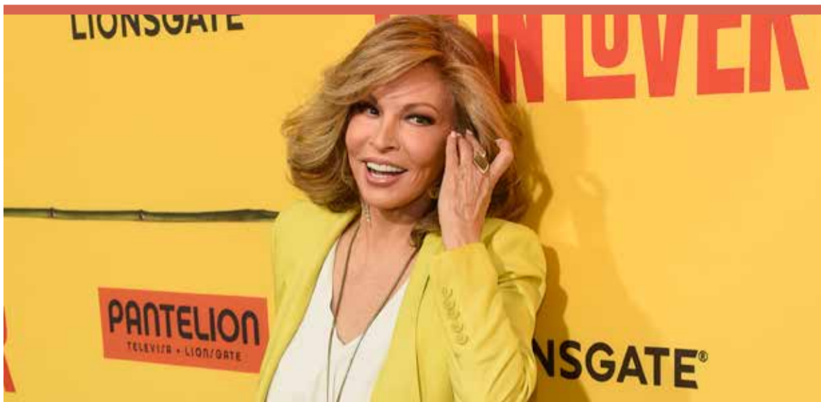
Raquel Welch appears at the Los Angeles premiere of "How to Be a Latin Lover" on April 26, 2017