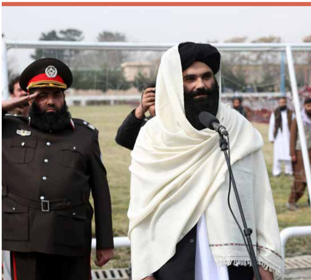
Taliban acting Interior Minister Sirajuddin Haqqani speaks during a graduation ceremony at the police academy in Kabul, last March

Haqqani said now that the Taliban have taken power, "more responsibility has been placed on our shoulders and it requires patience and good behavior and engagement with the people." He said the Taliban must "soothe the wounds of the people" and act in a way that the people do not come to hate them