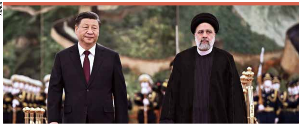
President Xi Jinping and Iranian President Ebrahim Raisi, after reviewing an honor guard during a welcome ceremony at the Great Hall of the People in Beijing, Tuesday

"The two sides ... called on the Afghan rulers to form an inclusive government in which all ethnic groups and political groups actually participate, and cancel all discriminatory measures against women, ethnic minorities and other religions," the statement