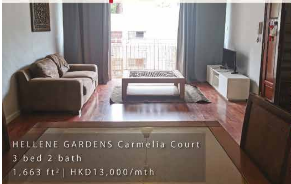
HELLENE GARDENS Carmelia Court 3 bed 2 bath 1,663 ft 2 | HKD13,000/mth

Wonderful location with daily fresh breeze from Ha Sac beach