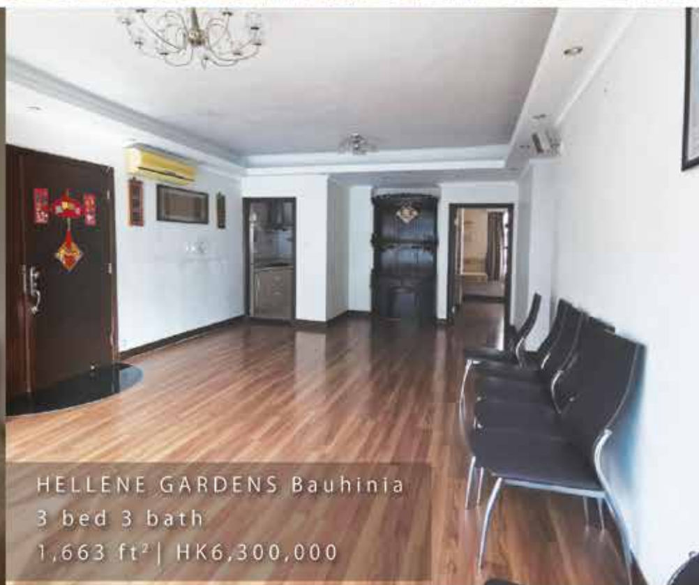
HELLENE GARDENS Bauhinia 3 bed 3 bath 1,663 ft 2 | HK6,300,000