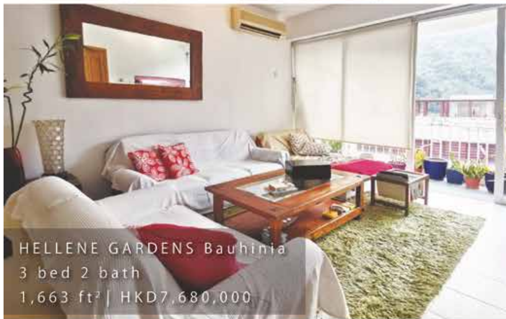
HELLENE GARDENS Bauhinia 3 bed 2 bath 1,663 ft 2 | HKD7,680,000