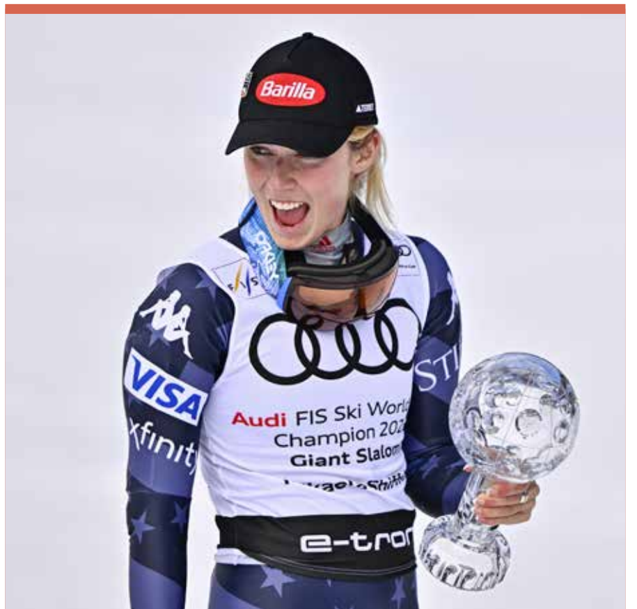
United States' Mikaela Shiffrin holds up the alpine ski, women's World Cup giant slalom discipline trophy, in Soldeu, Andorra, yesterday