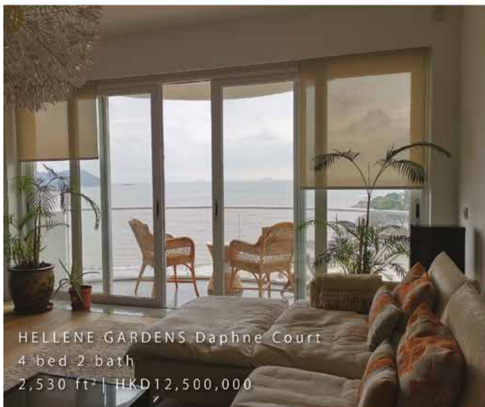
HELLENE GARDENS Daphne Court 4 bed 2 bath 2,530 ft 2 | HKD12,500,000