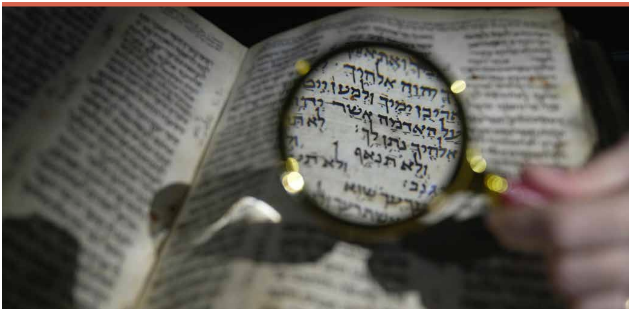
The Hebrew Bible "Codex Sassoon", that dates back more than 1,000 years, on display during a media preview of Sotheby's auction, in London