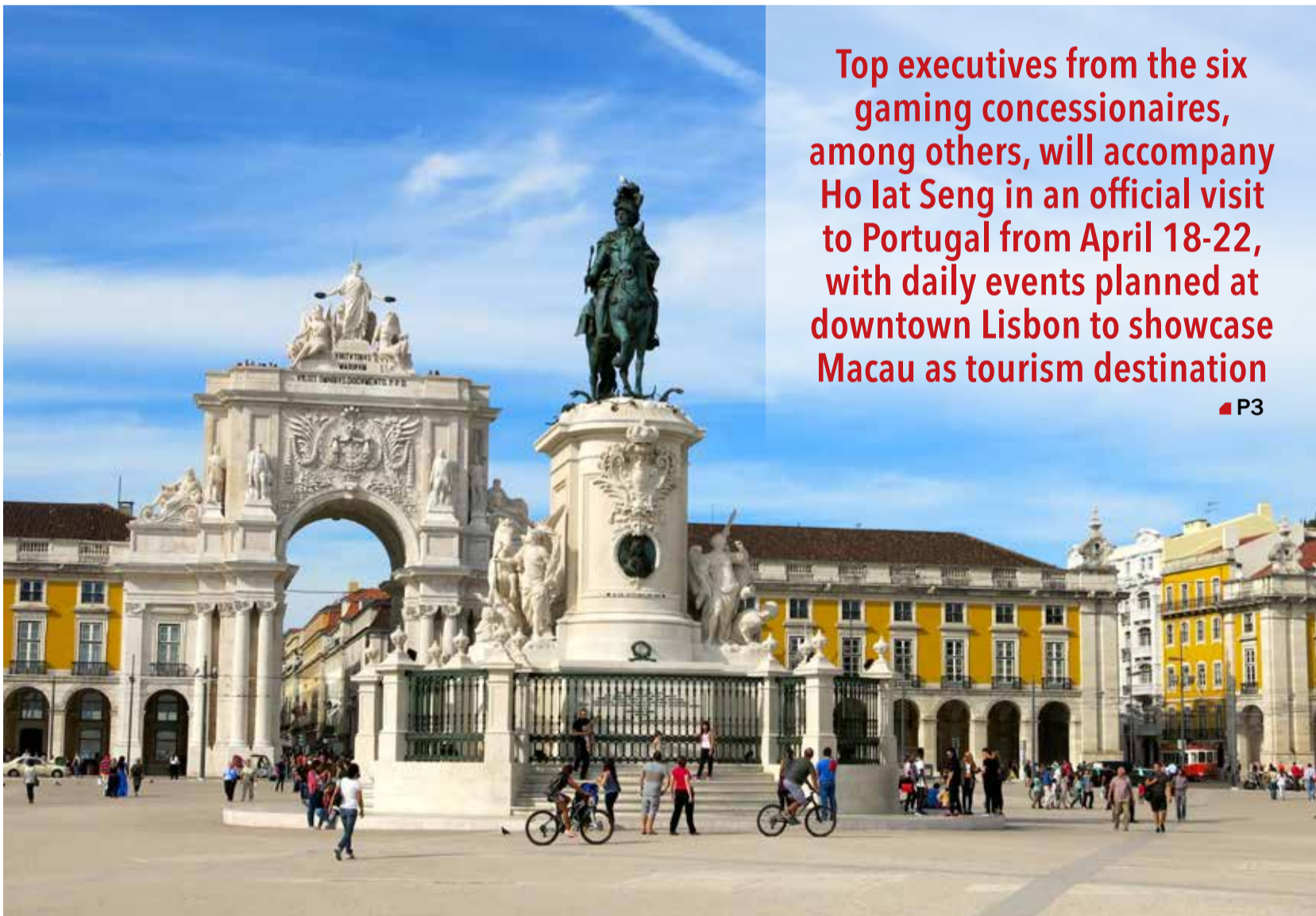
PRAÇA DO COMÉRCIO, LISBON

Top executives from the six gaming concessionaires, among others, will accompany Ho Iat Seng in an official visit to Portugal from April 18-22, with daily events planned at downtown Lisbon to showcase Macau as tourism destination