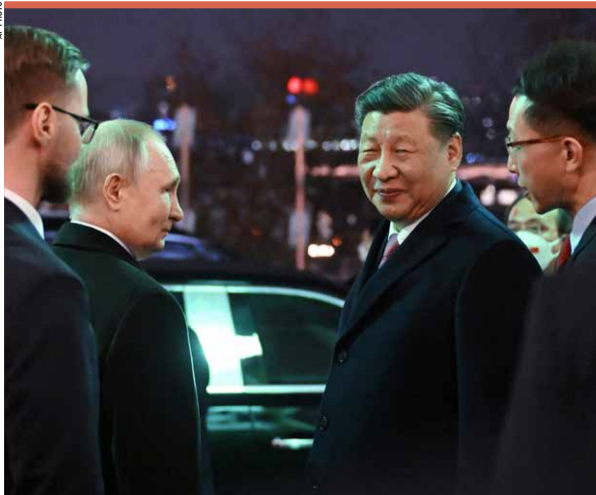
Leaving Moscow: President Xi Jinping and Russian President Vladimir Putin talk to each after their dinner at The Palace of the Facets in the Moscow Kremlin

international legal order" and pledged to "continue to support Ukraine until peace is back on the beautiful Ukrainian lands."