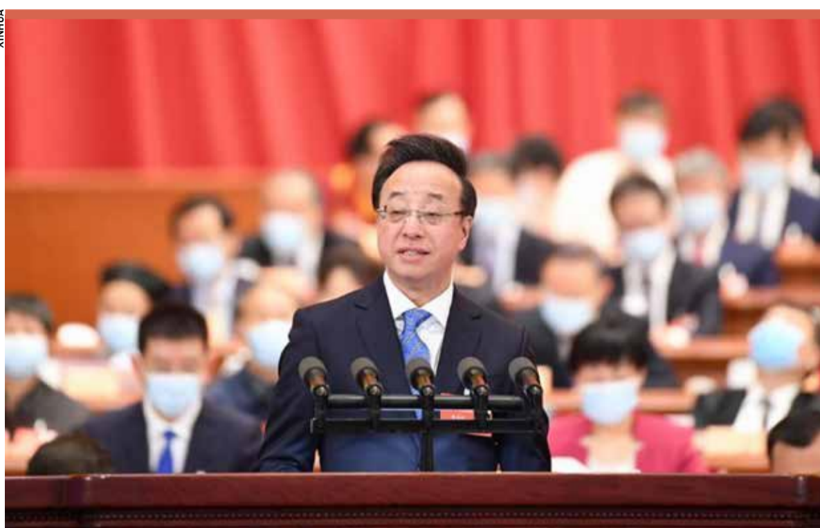
Tu Haiming delivers a speech at the second plenary meeting of the third session of the 13th CPPCC National Committee, Beijing, 2020

Therefore, Tu noted that although Hong Kong and Macau have their own advantages, "they are small economies that need