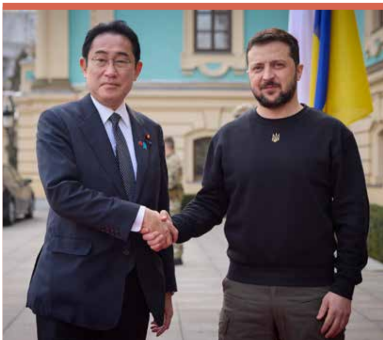
Japanese Prime Minister Fumio Kishida and Ukrainian President Volodymyr Zelenskyy in Kyiv