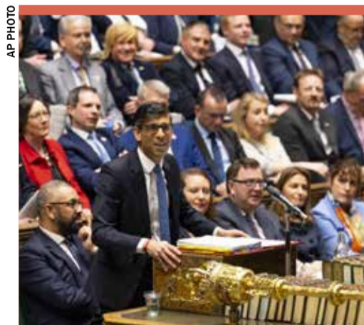
Britain's Prime Minister Rishi Sunak speaks during Prime Minister's Questions in the House of Commons in London

Johnson, who led Britain out of the EU in 2020, said the deal was "not acceptable" because it kept some EU laws in operation in Northern Ireland, restricting the U.K.'s ability to diverge from the bloc's rules and "take advantage of Brexit."