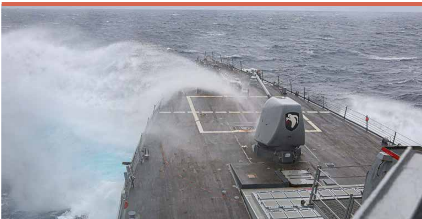
the Arleigh Burke-class guided-missile destroyer USS Milius steams in the Philippine Sea, on March 13