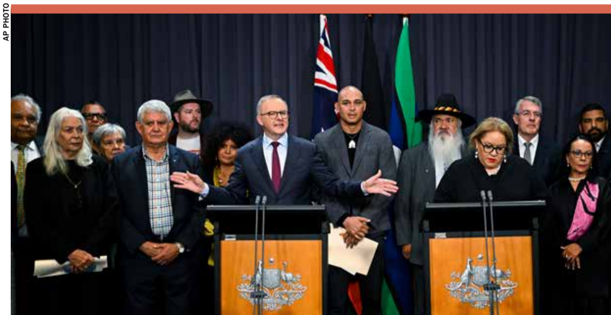
Australian Prime Minister Anthony Albanese, at the left podium, is surrounded by members of the First Nations Referendum Working Group during a press conference at Parliament House in Canberra

"This prime minister, this government, has listened respectfully, genuinely, authentically," she added.