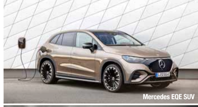
Mercedes EQE SUV