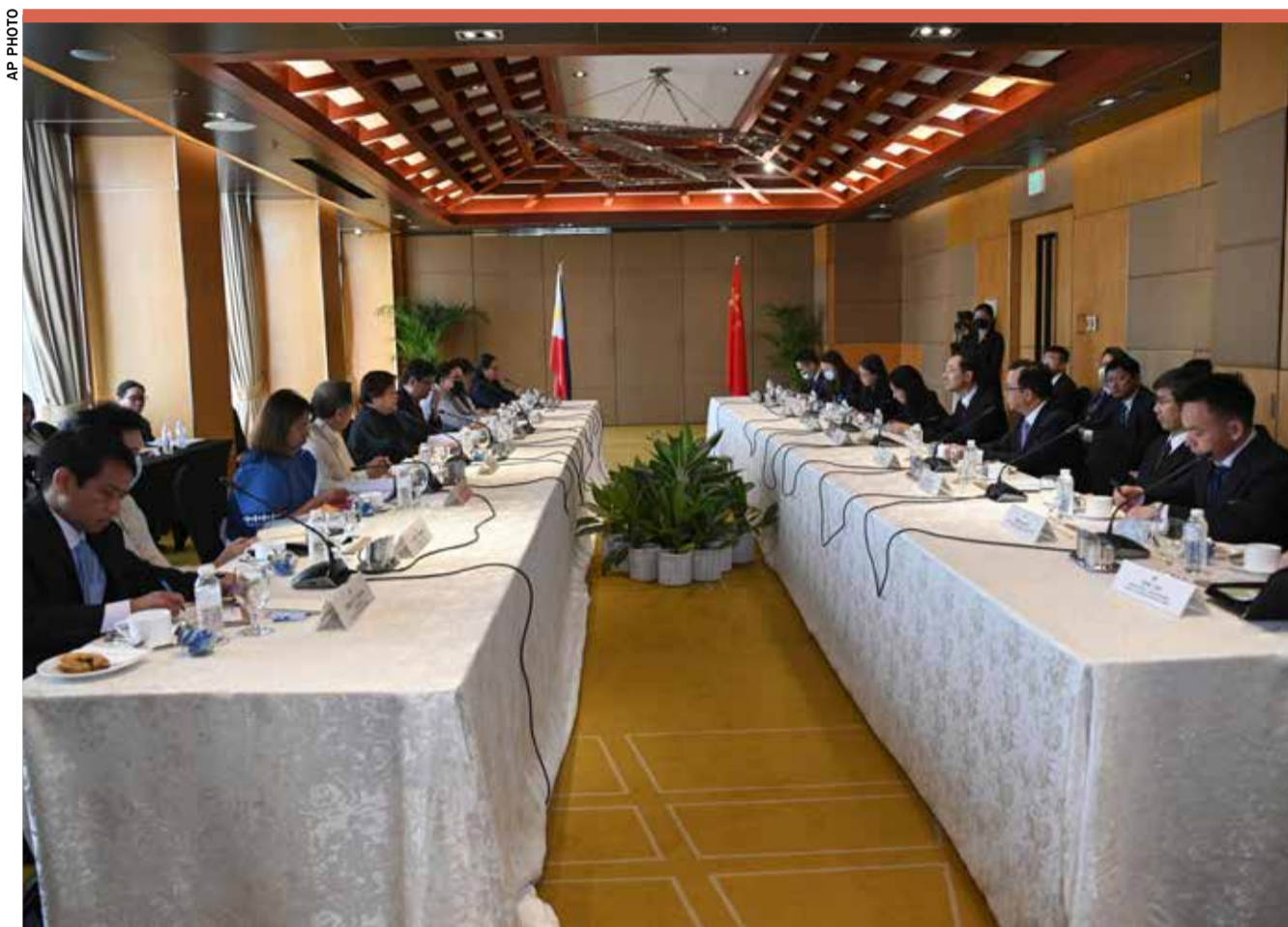
The Philippines-China Foreign Ministry consultation meeting at a hotel in Manila, yesterday

That included a Feb. 6 incident when a Chinese coast guard ship aimed a military-grade laser that briefly blinded some crew mem-