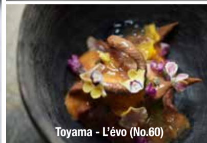
Toyama - L'évo (No.60)