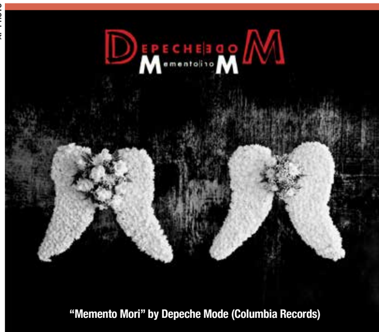
"Memento Mori" by Depeche Mode (Columbia Records)