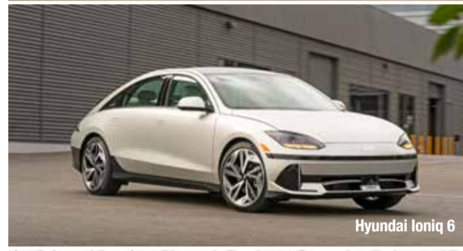
Hyundai Ioniq 6