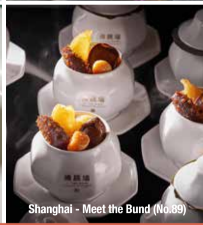
Shanghai - Meet the Bund (No.89)