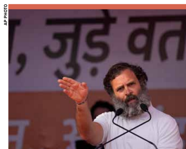
India's Congress party leader Rahul Gandhi

Gandhi, a lawmaker, is one of the main opposition leaders in India and the heir to a political dynasty – both his father, Ragiv, and his grandmother, Indira, were murdered for political motives while serving as premiers. He will most likely go up against Modi when he seeks his third term as prime minister in 2024.