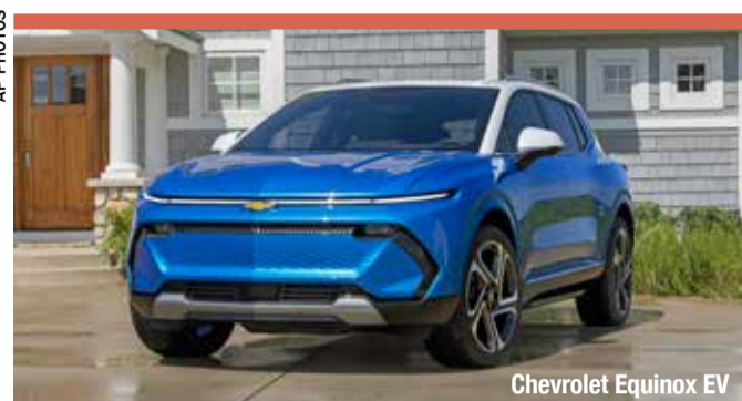
Chevrolet Equinox EV