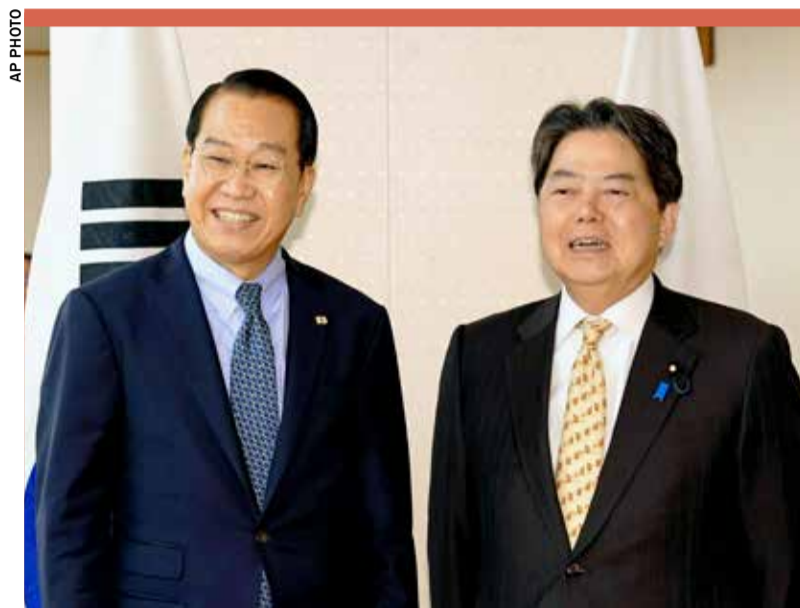
S.Korean Unification Minister Kwon Youngse (left) and Japanese Foreign Minister Yoshimasa Hayashi in Tokyo, yesterday

Kwon Youngse is in Tokyo for talks with Japanese ministers and top governing party officials,