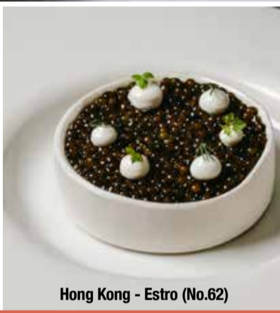
Hong Kong - Estro (No.62)