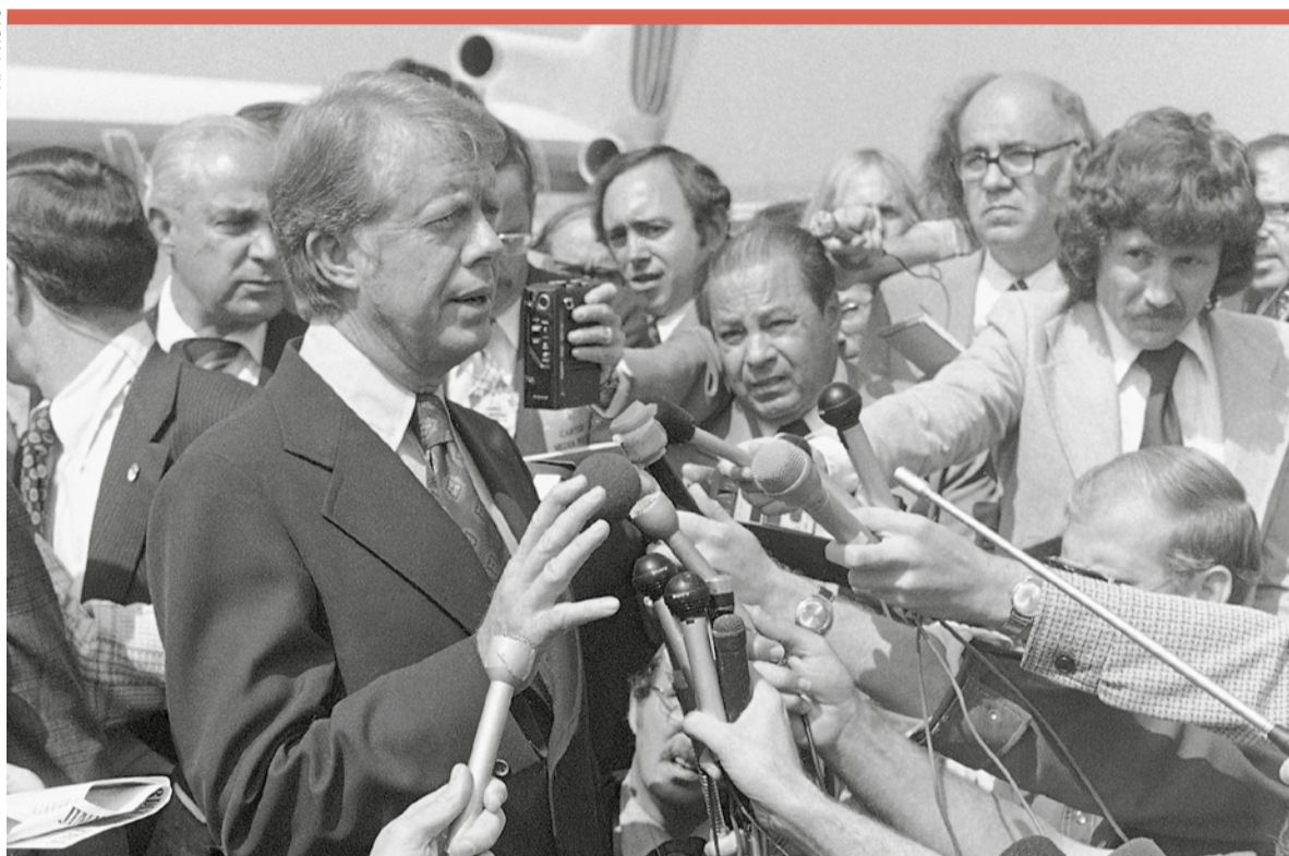
Democratic presidential nominee Jimmy Carter speaks to reporters on his arrival at Hobby International Airport in Houston on Friday, Sept. 24, 1976

son pressed Carter on whether his piety would make him a “rigid, unbending president” unable to represent all Americans.