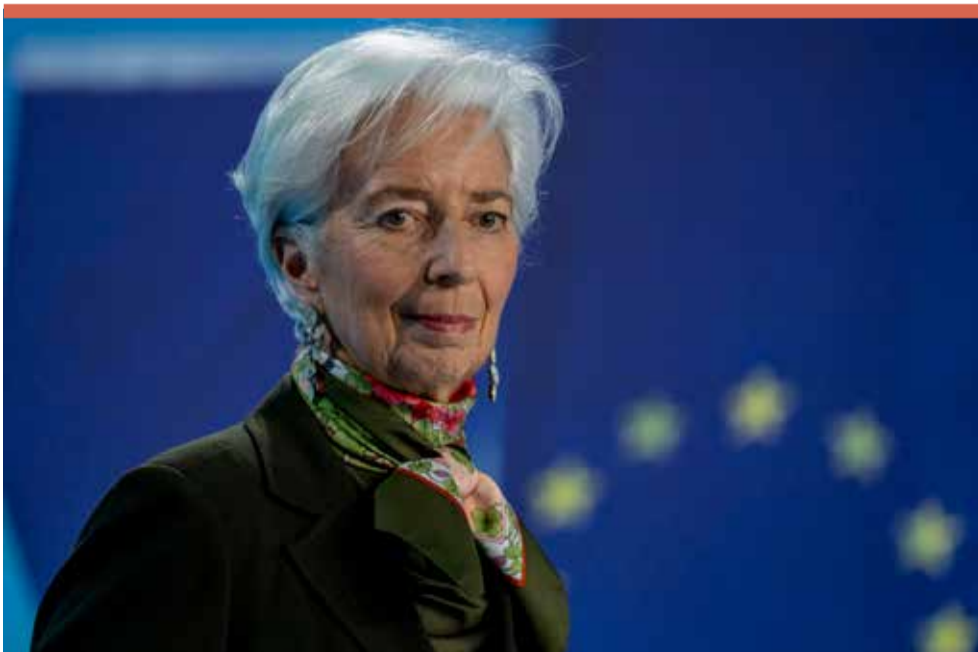
Christine Lagarde, president of the European Central Bank

cellphones and computer hard drives, among other products.