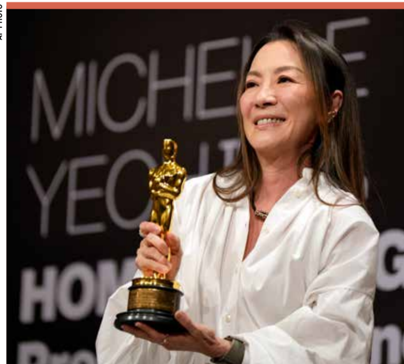
Malaysian actress Michelle Yeoh holds up the Oscar statuette during a press conference in Kuala Lumpur, yesterday