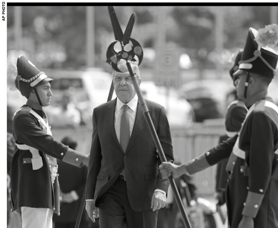
Russia's Foreign Minister Sergey Lavrov arrives to Itamaraty Palace in Brasilia

Lula's recent comments, particularly ascribing any blame to Ukraine for Russia's invasion in Feb. 2022, run counter to the position held by the European Union, the U.S. and Ukrainian President Volodymyr Zelenskyy. And any talk of a ceasefire is viewed as an opportunity for Russia to regroup its forces for a new offensive. Zelenskyy told The Associated Press last month that a loss anywhere at this stage in the war could put Ukraine's hard-fought momentum at risk.