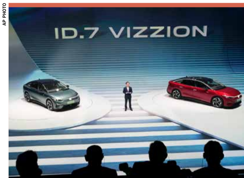
Volkswagen's ID.7 Vizzion, its new electric flagship sedan, is unveiled in a world premiere on the eve of the Auto Shanghai 2023 show in Shanghai

The show is the auto industry's first full-scale sales event in its biggest market since 2019 following