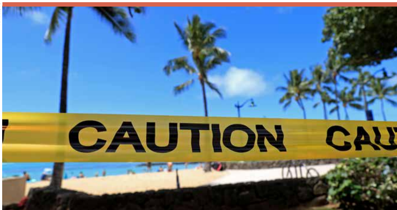
Yellow caution tape lines an area of Waikiki beach in Honolulu during the Covid-19 pandemic