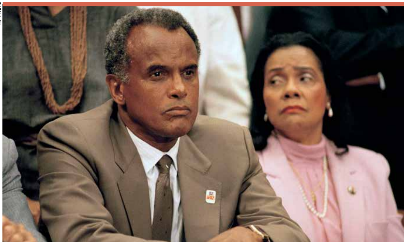
Harry Belafonte, and Coretta Scott King, widow of slain civil rights leader Dr. Martin Luther King, Jr., listen to a speaker during an anti-apartheid demonstration on Capitol Hill in Washington on Aug. 12, 1985