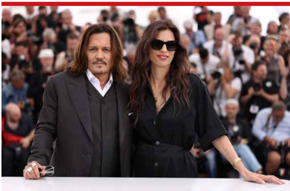
Johnny Depp and director Maiwenn pose for photographers at the photo call for the film 'Jeanne du Barry' in Cannes