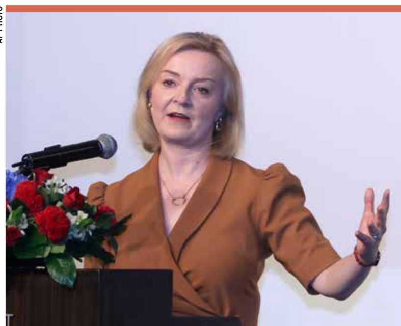
Former Britain's Prime Minister Liz Truss delivers a speech on the second day of her five-day visit in Taipei

"They have already formed alliances with other nations that want to see the free world in decline. They have already made a