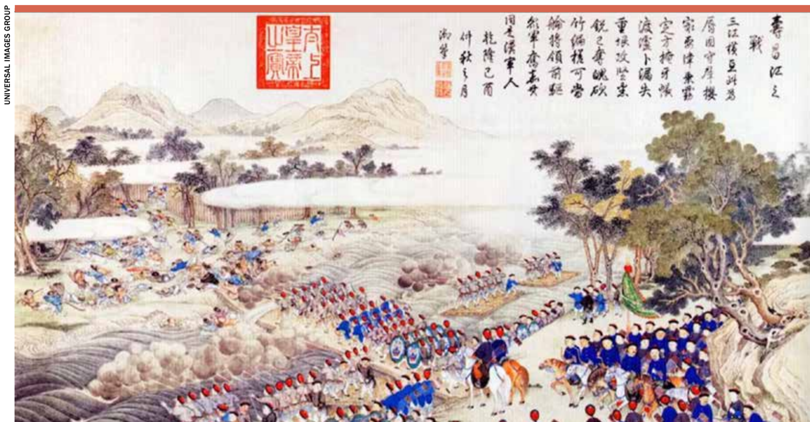
Painting of a battle between Chinese and Vietnamese forces during the Qing invasion of Vietnam in 1788

Daoism views existence as composed of constant cycles of change, in which power ebbs and flows. Meanwhile, the "Dào," or "the way," directs all things in nature toward fulfilling their inherent potential, like water flowing downhill.