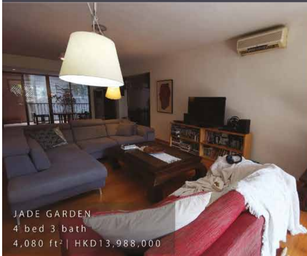
JADE GARDEN 4 bed 3 bath 4,080 ft 2 | HKD13,988,000