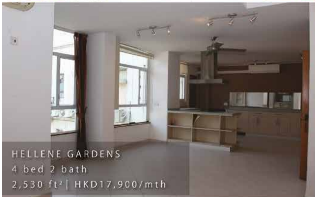
HELLENE GARDENS 4 bed 2 bath 2,530 ft 2 | HKD17,900/mth