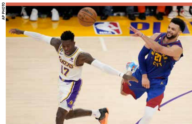
Denver Nuggets guard Jamal Murray, right, passes over Los Angeles Lakers guard Dennis Schroder (17) in the second half of Game 3 of the NBA basketball Western Conference Final series

Kentavious Caldwell-Pope scored 12 of his 17 points in the second half against his former team for the top-seeded Nuggets,