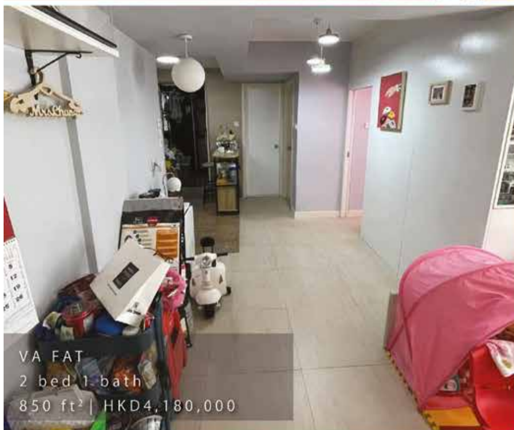
VA FAT 2 bed 1 bath 850 ft 2 | HKD4,180,000