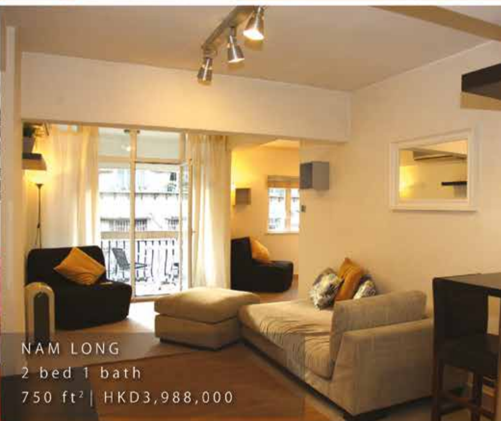
NAM LONG 2 bed 1 bath 750 ft 2 | HKD3,988,000