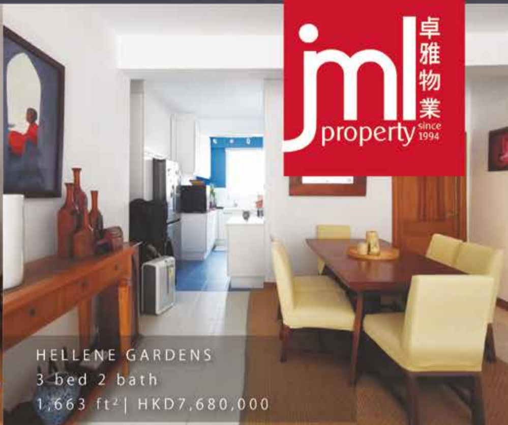
HELLENE GARDENS 3 bed 2 bath 1,663 ft 2 | HKD7,680,000