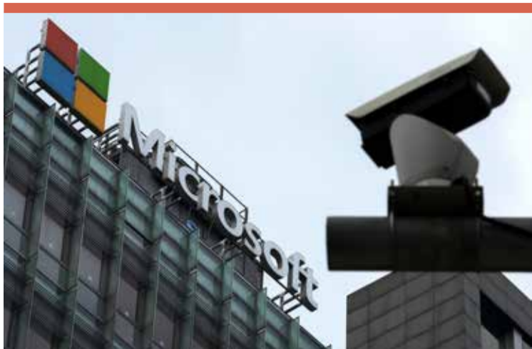
Microsoft office building in Beijing