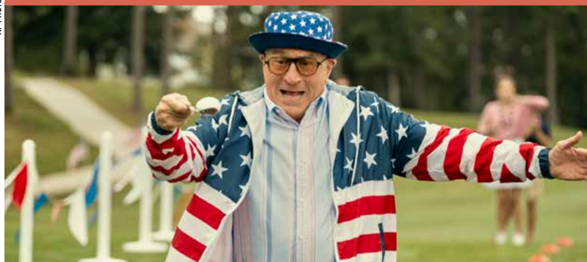
Robert De Niro as Salvo in a scene from "About My Father"

about the push and pull of blood. "The family is not just one thing. It's everything," is the motto the Maniscalco clan live by. It would have been a powerful message in 1972.