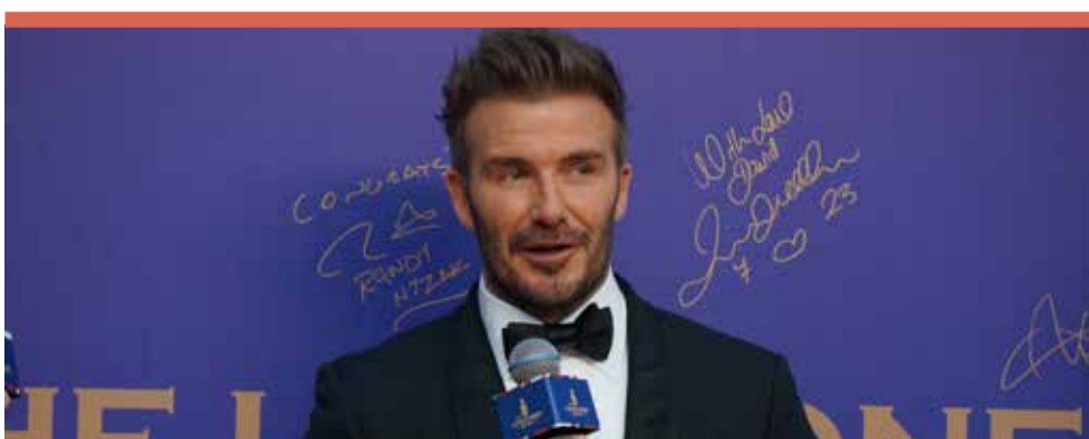
David Beckham, brand ambassador of The Londoner Macao