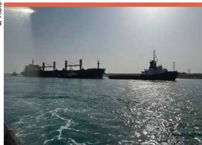
In this photo provided by The Suez Canal Authority in Egypt, the bulk carrier ship Xin Hai Tong 23 (left) is towed after it ran aground at the southern mouth of the Suez Canal yesterday