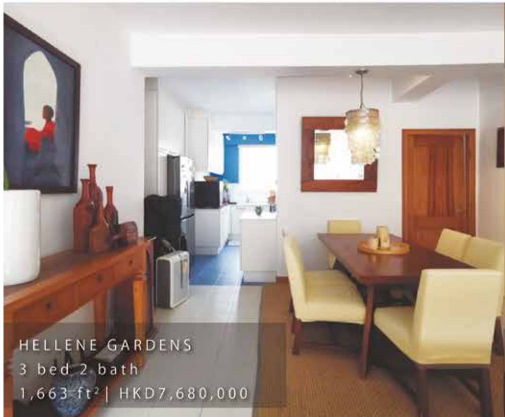
HELLENE GARDENS 3 bed 2 bath 1,663 ft 2 | HKD7,680,000