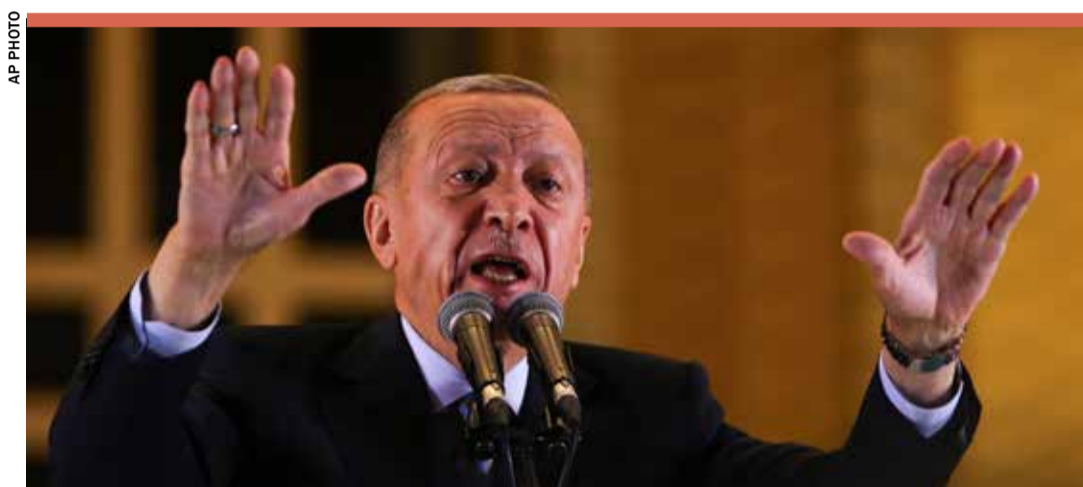
Turkish President and People's Alliance's presidential candidate Recep Tayyip Erdogan makes a speech at the presidential palace, in Ankara

"The only winner today is Turkey," Erdogan said outside the presidential palace in Ankara, promising to work hard for Turkey's second century, which he called the "Turkish century." The country marks its centennial this year.