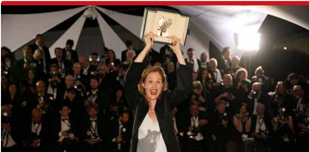
Justine Triet, winner of the Palme d’Or for ‘Anatomy of a Fall, at Cannes