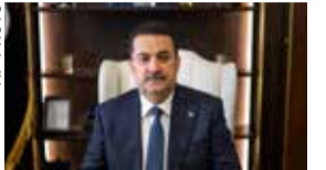
Iraq Prime Minister Mohammed Shia al-Sudani (pictured) announced plans for a $17 billion regional transportation project intended to facilitate the flow of goods from Asia to Europe. The announcement was made at a one-day conference in Baghdad that convened transport ministers and representatives from Iraq, the Gulf countries, Turkey, Iran, Syria, and Jordan.