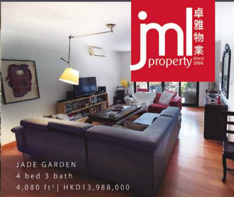
JADE GARDEN 4 bed 3 bath 4,080 ft 2 | HKD13,988,000