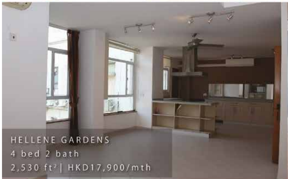
HELLENE GARDENS 4 bed 2 bath 2,530 ft 2 | HKD17,900/mth