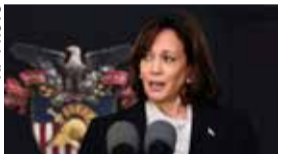
USA Vice President Kamala Harris, the first woman to deliver a commencement speech at West Point, lauded graduating cadets for their noble sacrifice in serving their country, but noted they were entering an “unsettled world” because of Russian aggression and the rising threats from China. “The world has drastically changed,” Harris told the roughly 950 graduating cadets. She referred to the global pandemic that took millions of lives, as well as the fraught shifts in global politics in Europe and in Asia.