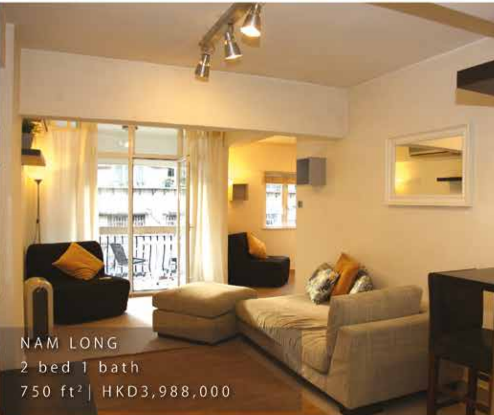
NAM LONG 2 bed 1 bath 750 ft 2 | HKD3,988,000