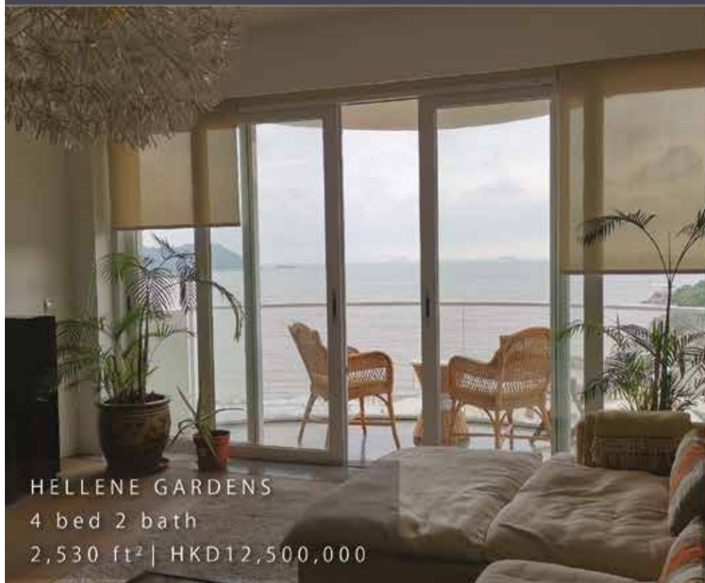
HELLENE GARDENS 4 bed 2 bath 2,530 ft 2 | HKD12,500,000