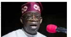
Nigeria Bola Tinubu (pictured) will today take over as president of Africa’s most populous country at a period of unprecedented challenges. A former governor of Lagos, the country’s economic hub, Tinubu, 71, will succeed President Muhammadu Buhari to lead a country that by 2050 is forecast to become the third most populous nation in the world, tied with the United States after India and China.