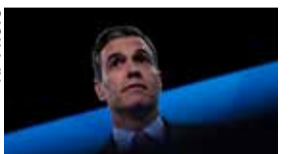
Spanish Prime Minister Pedro Sánchez yesterday called an early general election for July 23 in a surprise move after his Socialist party took a serious battering in local and regional elections. Prior to Sunday’s debacle, Sánchez had insisted that he would ride out his four-year term with leftist government coalition partner United We Can, indicating that an election would be held in December.