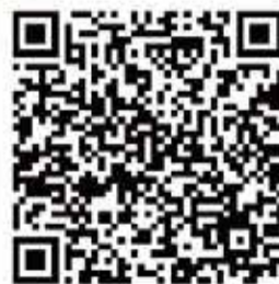
論壇介紹 About the Forum