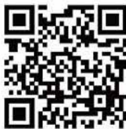
掃碼報名 Scan to register

The forum will also be held online with simultaneous interpretation in Chinese/English.