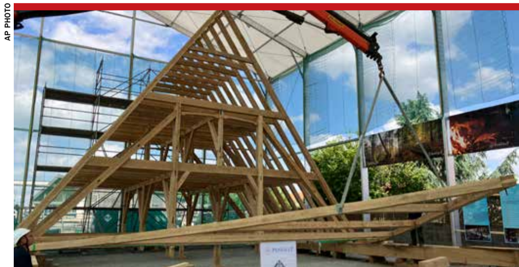
A crane lifts a part of the new roof of the Notre Dame de Paris cathedral, last week

Countries around the world are scrambling to come up with regulations for the developing technology, with the European Union blazing the trail with its AI Act expected to be approved later this year.