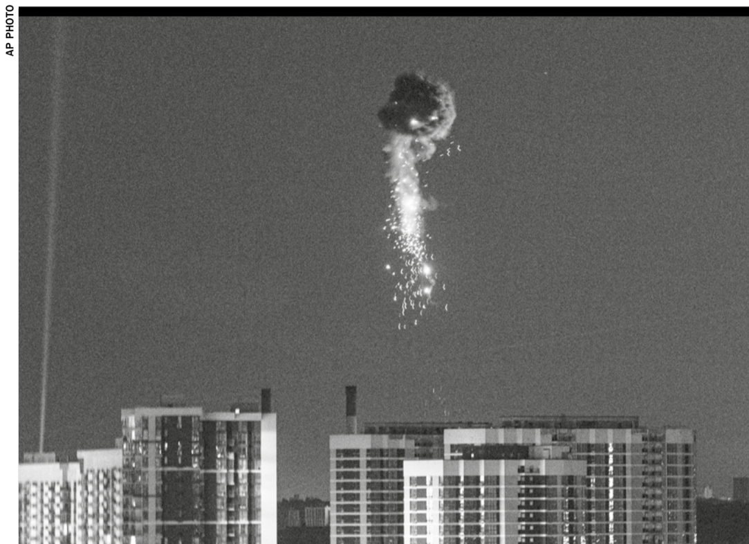
Ukrainian air defense intercepts a Shahed drone mid-air in the third Russia aerial attack on the capital in the last 24 hours in Kyiv

behaving like this, does he really not understand and fear the consequences?" she wrote in a Telegram post. "Apparently he isn't afraid, and everything is built on the idea that has been voiced more than once about a patient people who will understand everything and endure everything."