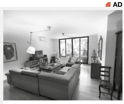
Jade Garden HKD 13,988,000 4 beds 3 bath