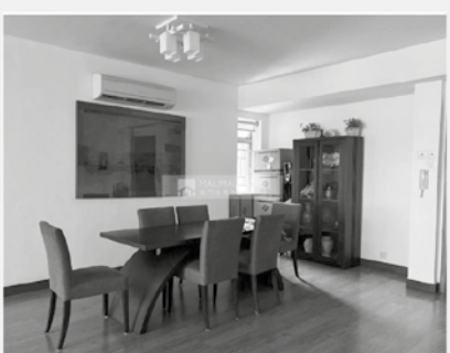
Supreme Flower City HKD 22,000/mth 4 bed 3 bath