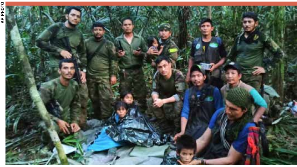
In this photo released by Colombia's Armed Forces Press Office, soldiers and Indigenous men pose for a photo with the four Indigenous children who were missing after a deadly plane crash, in the Solano jungle

"When the plane crashed, they took out (of the wreckage) a fariña, and with that, they survived," the children's uncle, Fidencio