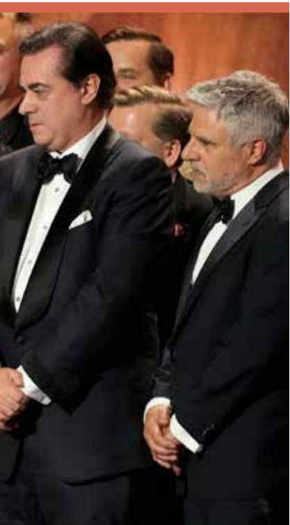
76th annual Tony Awards