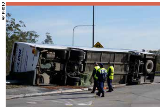
Police inspect a bus on its side near the town of Greta following a crash in the Hunter Valley, north of Sydney

It was Australia's most deadly road accident since