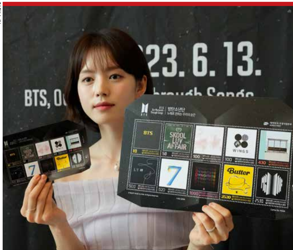
A model shows sheets of postage stamps marking the 10th debut anniversary of K-pop band BTS at a post office in Seoul