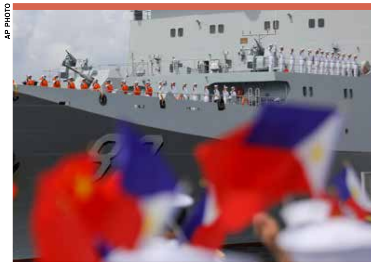
Chinese navy sailors wave as they arrive on board their naval training ship, Qi Jiguang, for a goodwill visit at Manila's port, yesterday

come increasingly assertive in pressing its broad claims to the strategic South China Sea, which has put it at odds with the Philippines, Vietnam, Malaysia and Brunei.