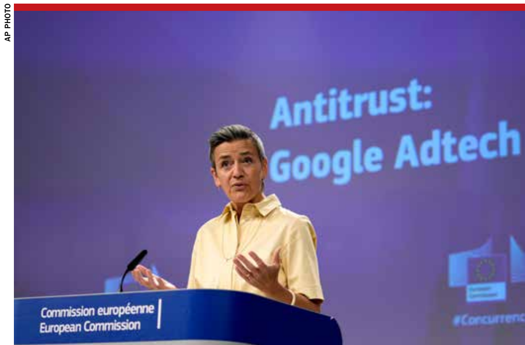
European Commissioner for Europe fit for the Digital Age Margrethe Vestager

Libyan authorities have launched a major crackdown on migrants earlier this month across eastern Libya. Activists have said several thousand migrants, including Egyptians, Syrians, Sudanese and Pakistanis, have been detained. Libyan authorities deported many Egyptians to their home country through a land crossing point.