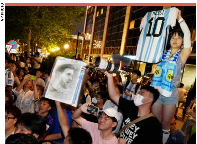
Chinese fans wait to catch a glimpse of the soccer superstar Lionel Messi in Beijing, Tuesday night

Before then, he's with the Argentina squad that is scheduled