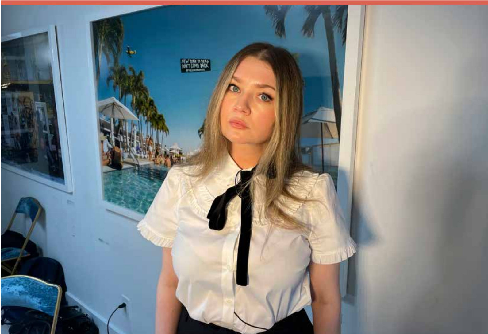
Anna Delvey, also known as Anna Sorokin, is on house arrest at her apartment in New York