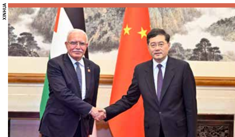
Chinese State Councilor and Foreign Minister Qin Gang meets with Palestinian Foreign Minister Riyad Al-Maliki in Beijing

China has appointed a special envoy to meet with Israeli and Palestinian officials, but its experience in the region is mainly limited to construction, manufacturing and other eco-