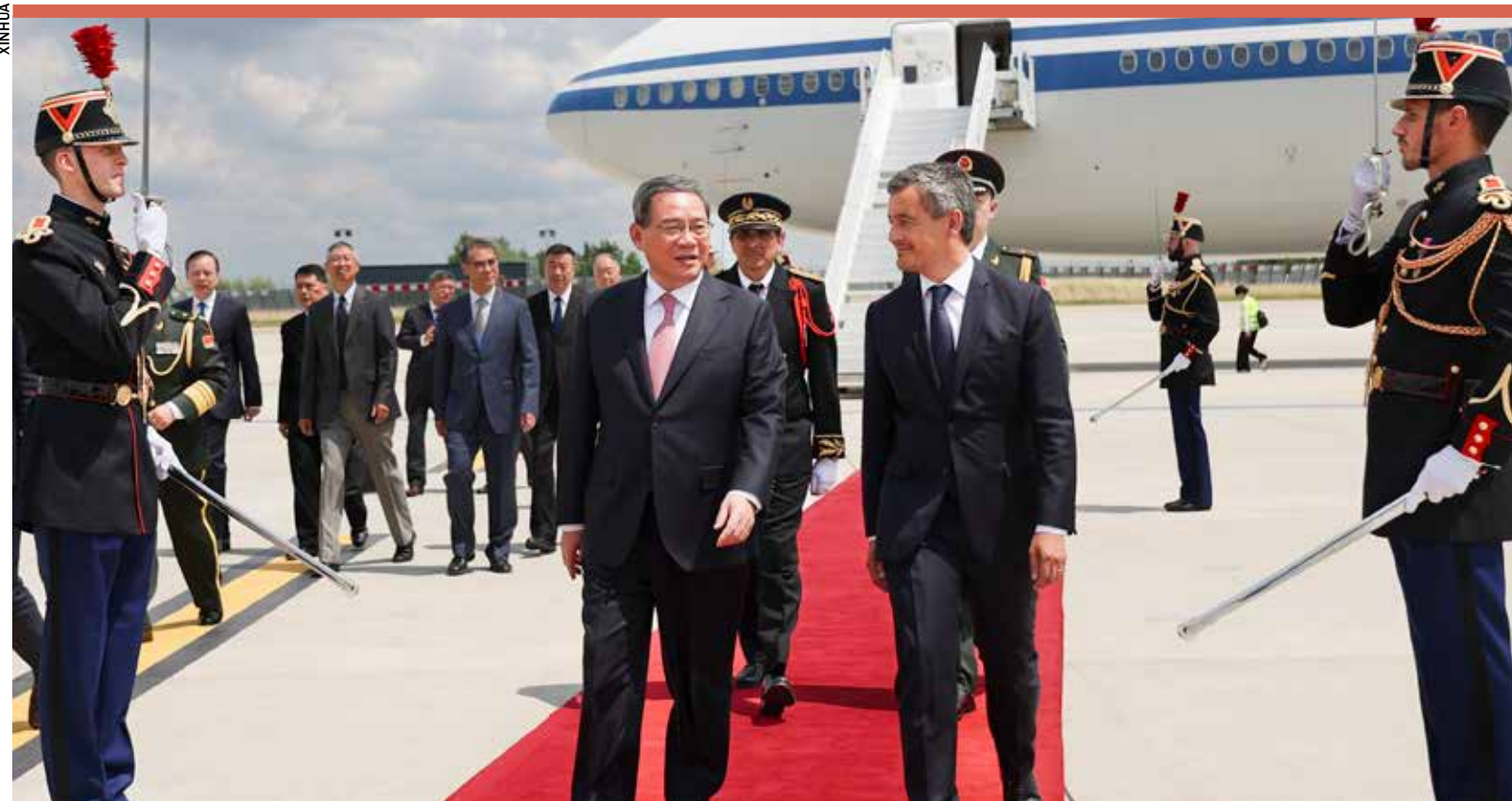
Chinese Premier Li Qiang arrives at the Paris Orly Airport in Paris, France, June 21

China's contribution will make it possible to underline the urgency of a new paradigm of international economic relations, greater equity, solidarity and stability, the