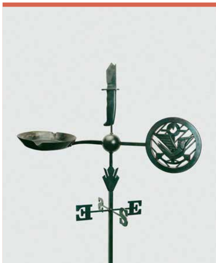
"Weathervanes" by Jason Isbell and the 400 Unit. (Southeastern Records)