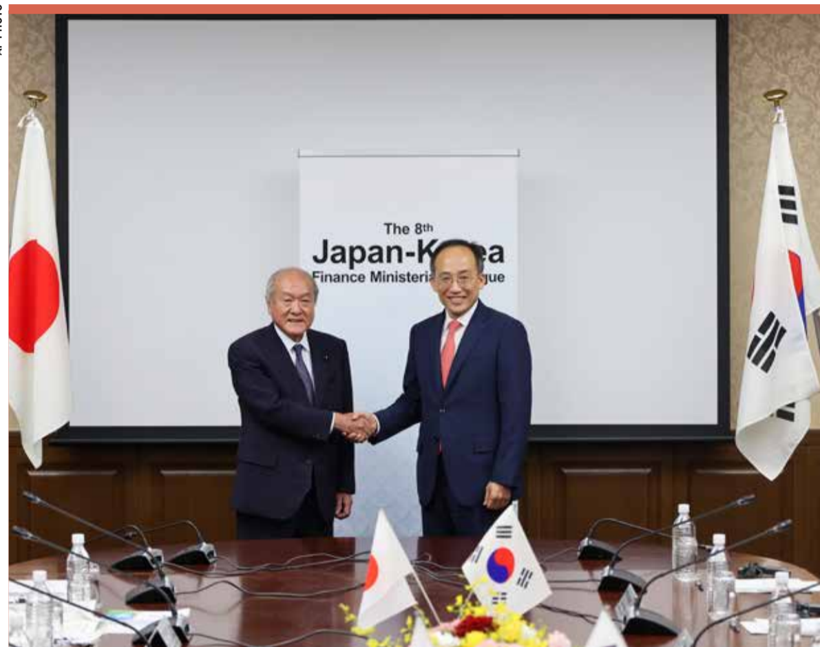
Japanese Finance Minister Shunichi Suzuki, left, and South Korea's Economy and Finance Minister Choo Kyungho, in Tokyo, yesterday

The two major Asian economies, both U.S. allies, have recently mended ties as they contend with challenges posed by China and North Korea, despite