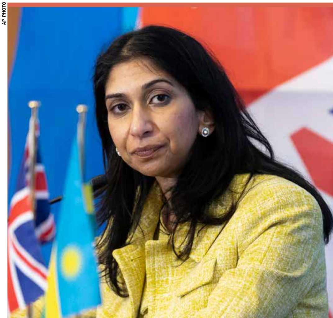
Britain's Home Secretary Suella Braverman pauses, during a press conference in the capital Kigali, Rwanda Saturday, March 18, 2023

Human rights groups say it is immoral and inhumane to send people more than 4,000 miles (6,400 kilometers) to a country they don't want to live in, and argue that most Channel migrants are desperate people who have no authorized way to come to the U.K. They also cite Rwanda's poor hu-