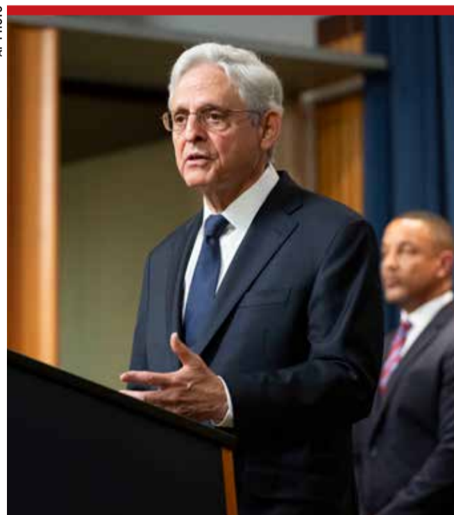
Attorney General Merrick Garland speaks at a press conference to announce arrests and disruptions of the fentanyl precursor chemical supply chain, June 23, 2023 in Washington

In one case filed in the Southern District of Florida, investigators said they found nearly $2 billion in fraudulent telemedicine claims submitted to government-funded coverage programs like Medicare and Medicaid, which mainly cover people age 65 and over and those with low incomes,