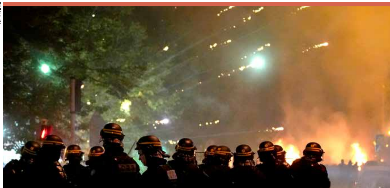
Police forces clash with youths in Nanterre, outside Paris, yesterday

Two magistrates have been named to lead the in-