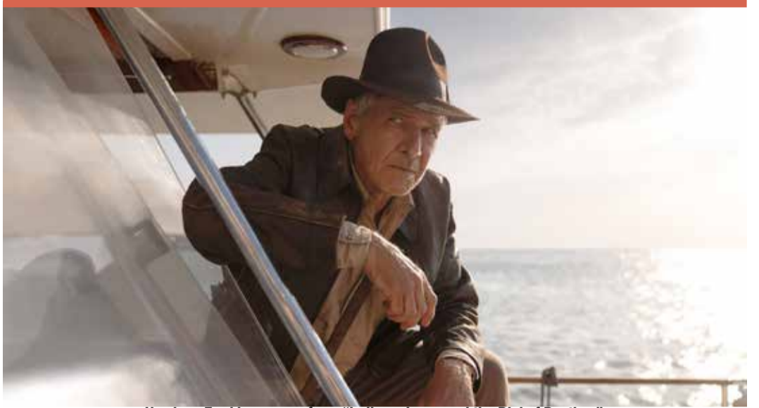
Harrison Ford in a scene from "Indiana Jones and the Dial of Destiny."