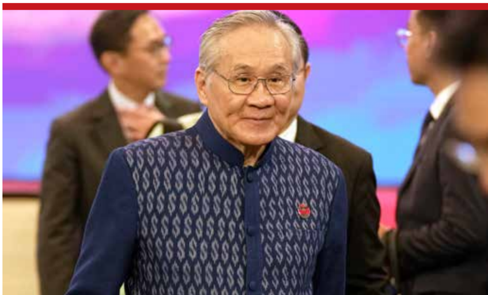
Thailand's Foreign Minister Don Pramudwinai