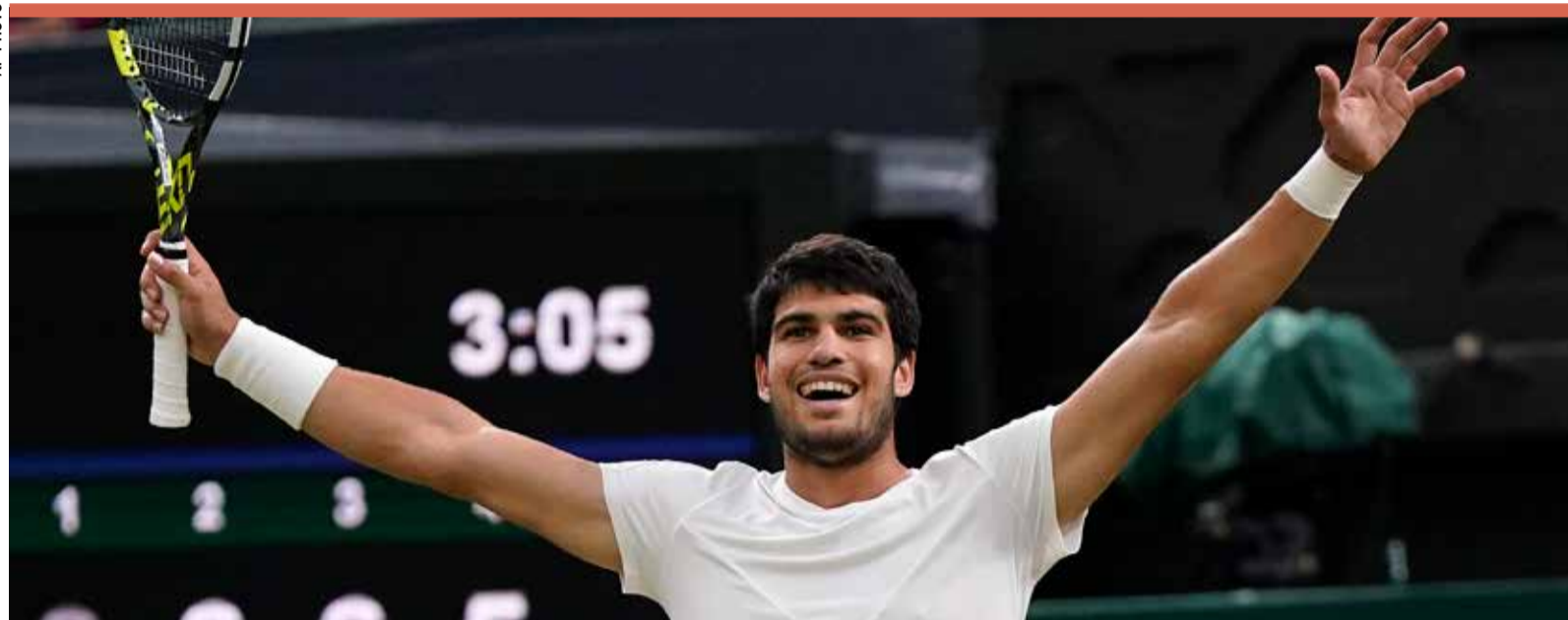
Spain's Carlos Alcaraz

loves playing on Court No. 1 — and that's where he'll face Chris Eubanks, a big-serving American making his Wimbledon debut at age 27, in the other men's quarterfinal.