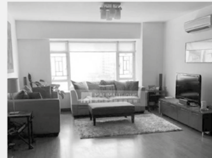
Supreme Flower City HKD 22,000/mth 4 bed 3 bath