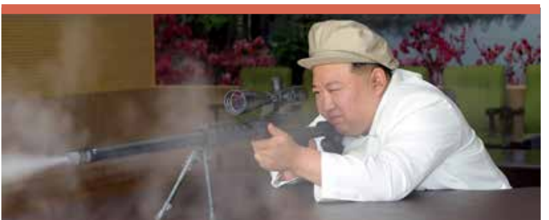
Kim Jong Un tries a weapon during his three-day inspection from Aug. 3 until Aug. 5, 2023 at major munitions factories in North Korea