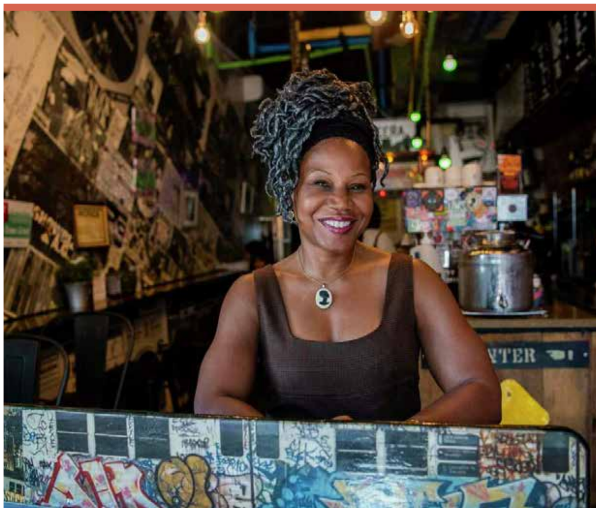
Majora Carter, owner of the Boogie Down Grind, poses for a portrait in the Bronx in New York, this week