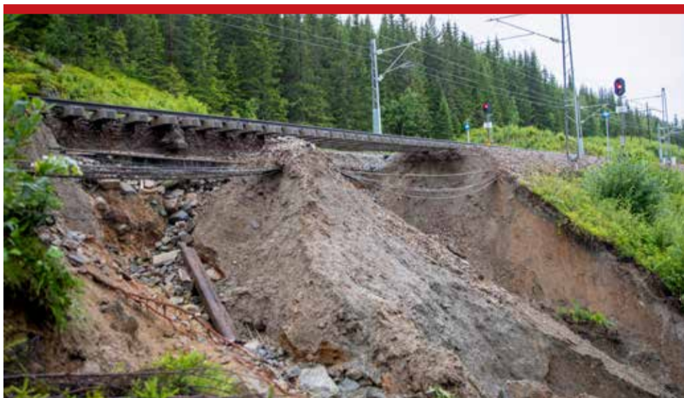
Collapsed parts of the Bergen Trainline due to the extreme weather are seen in Hole, Norway, yesterday