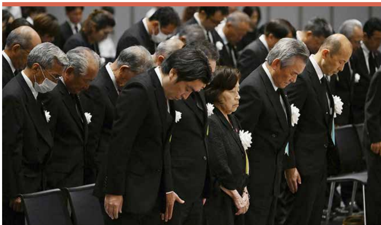
Nagasaki Mayor Shiro Suzuki (right) with other attendees takes a moment of silence during a ceremony to mark the 78th anniversary of the atomic bombing in Nagasaki, yesterday