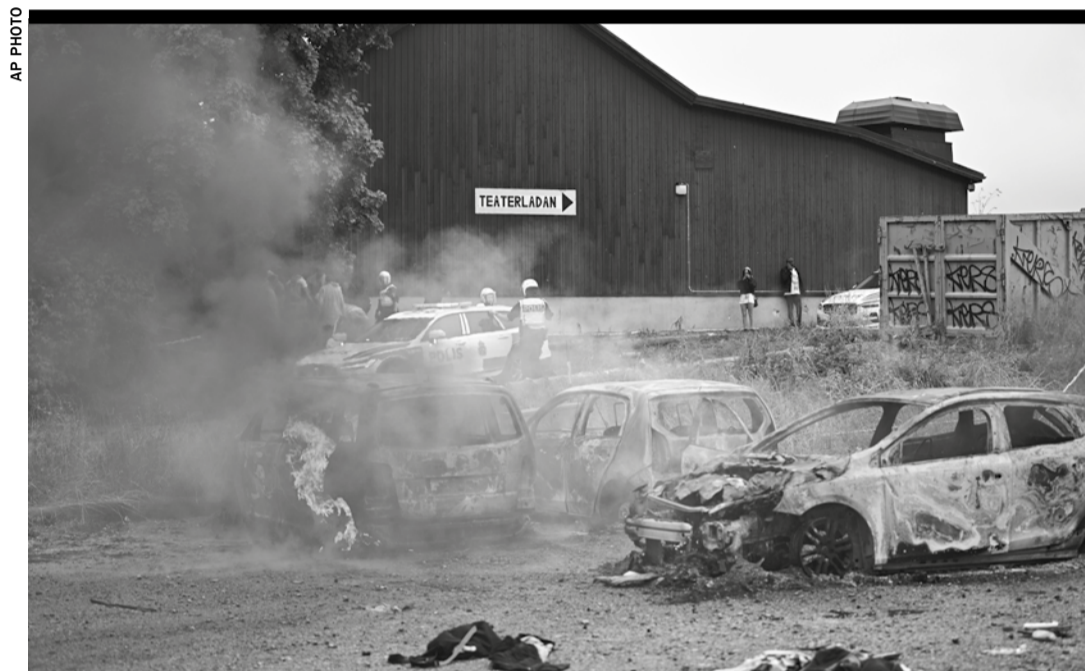
Police stand near the gutted remains of cars, at the Eritrean cultural festival "Eritrea Scandinavia" in Stockholm, last week

"Complicity in attempts to disrupt decades-old Eritrean festivals using foreign thugs reflects abject failure of asylum scam," he said in a message posted on social media. He later criticized the