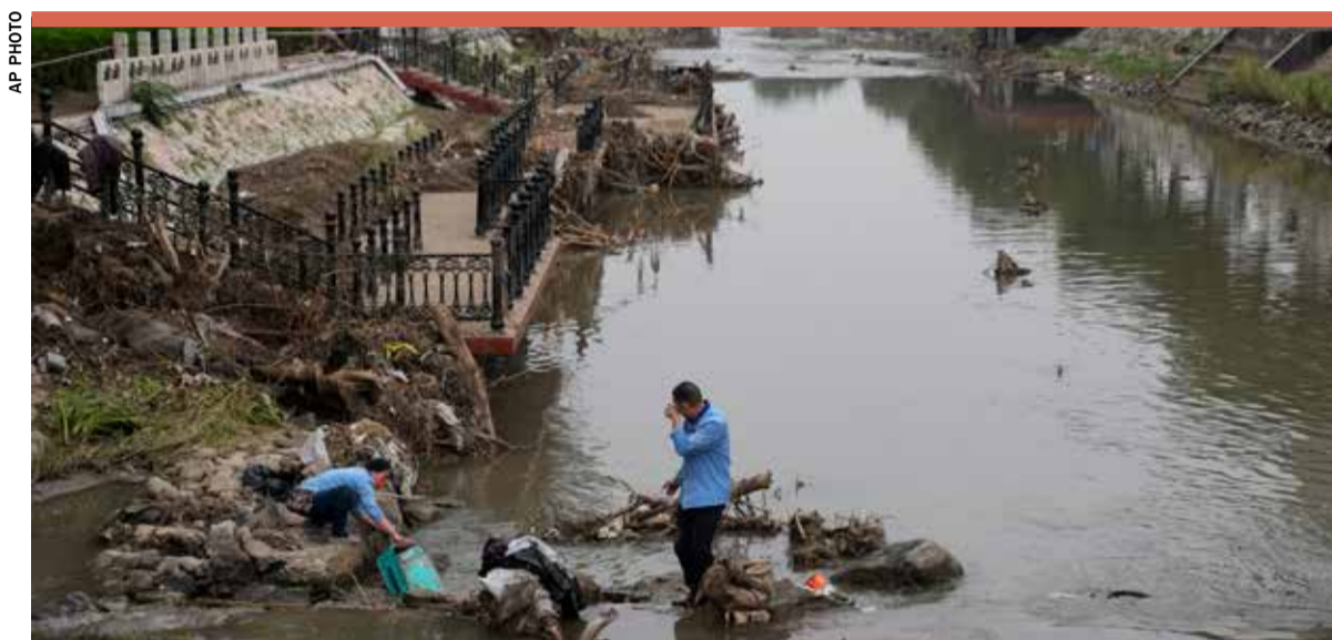
Mentougou district on the outskirts of Beijing

The area, which includes the districts of Mentougou and Fanshan, are kilometers away