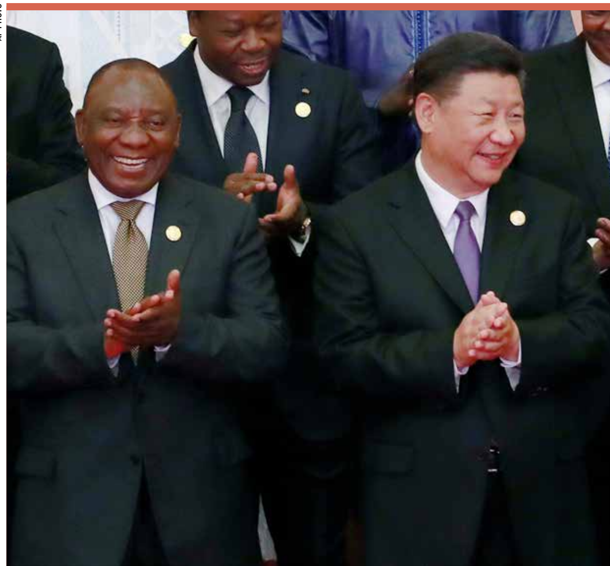
President Xi Jinping with South African President Cyril Ramaphosa (left) at the Forum on China-Africa Cooperation in Beijing, in 2018

Saudi Arabia is one of more than 20 countries to have formally applied to join BRICS in another