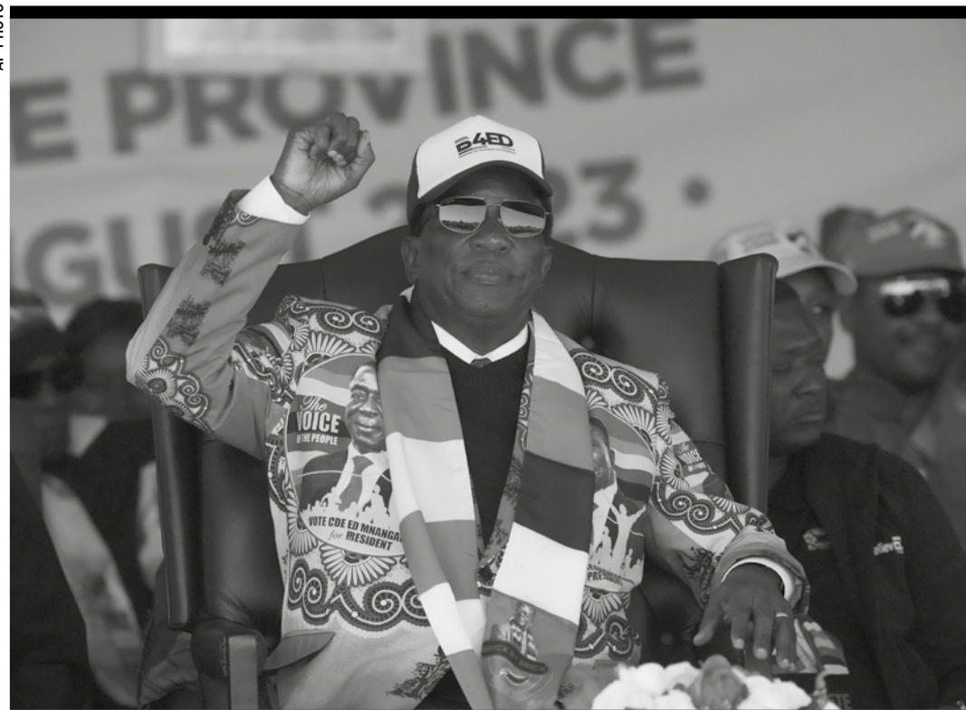
Zimbabwe's President Emmerson Mnangagwa at a campaign rally in Harare, last week

At stake is the direction of a nation with rich agricul-