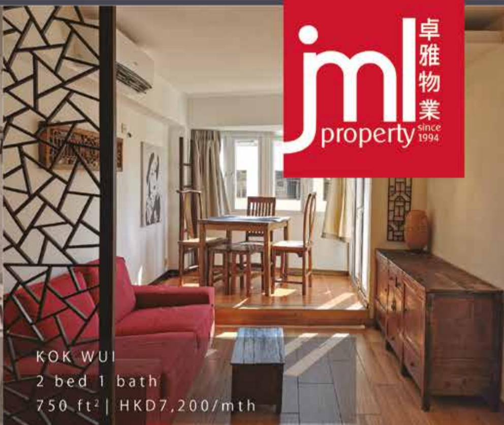
KOK WUI 2 bed 1 bath 750 ft 2 | HKD7,200/mth