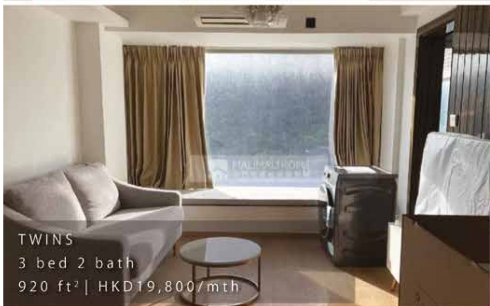
TWINS 3 bed 2 bath 920 ft 2 | HKD19,800/mth