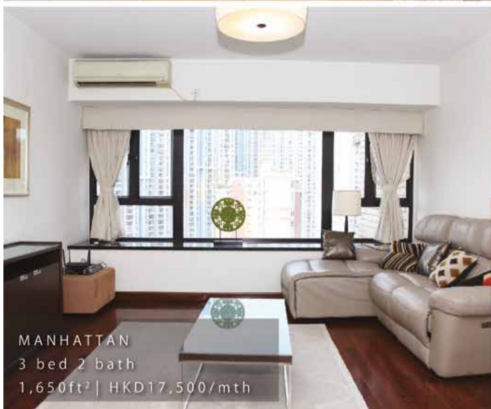
MANHATTAN 3 bed 2 bath 1,650ft 2 | HKD17,500/mth