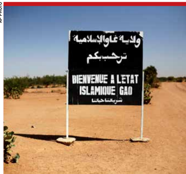
A sign on the northern road exiting in Gao, Northern Mali, reads "welcome to the Islamic state of Gao on Jan. 30, 2013"

The panel of experts said in the report circulated Friday that the impasse in implementing the agreement — especially the disarmament, demobilization and