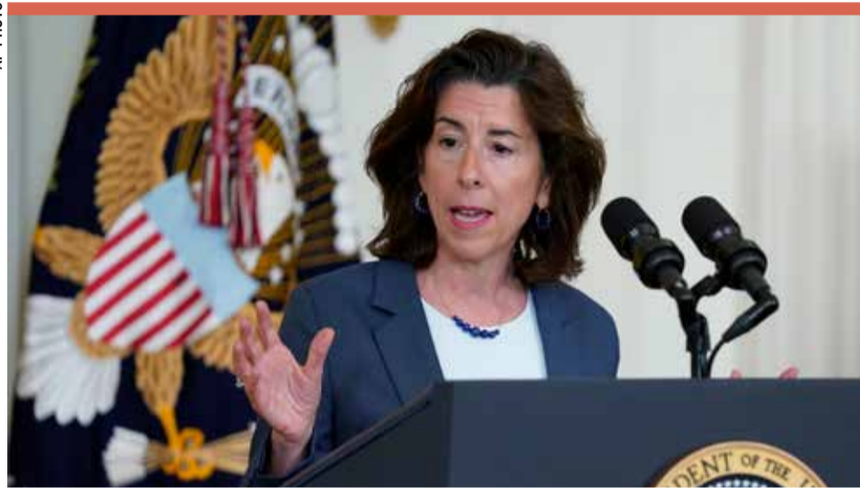
Commerce Secretary Gina Raimondo

Secretary of State Antony Blinken made a two-day stop in Beijing in June, the highest-level meetings in China in the past five