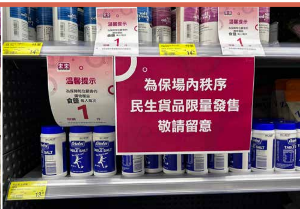
A notice that reads goods are sold in limited quantities per person

pliers need time to deliver stocks to supermarkets, which had thus created a window period.