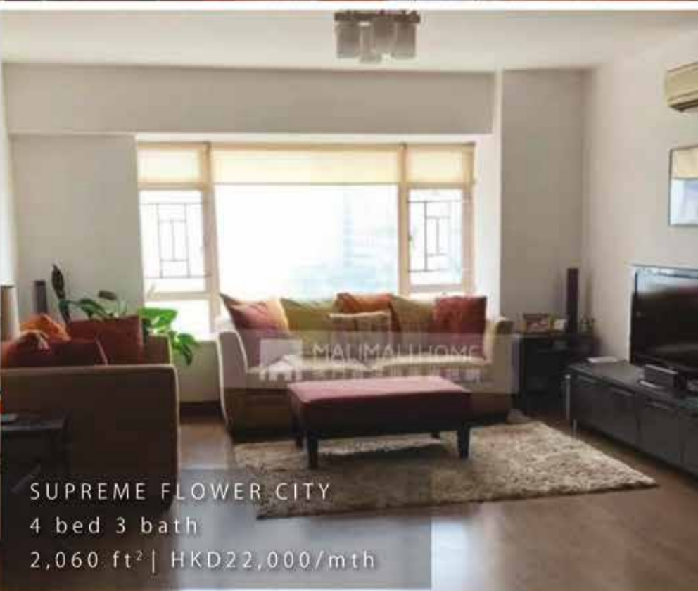
SUPREME FLOWER CITY 4 bed 3 bath 2,060 ft 2 | HKD22,000/mth