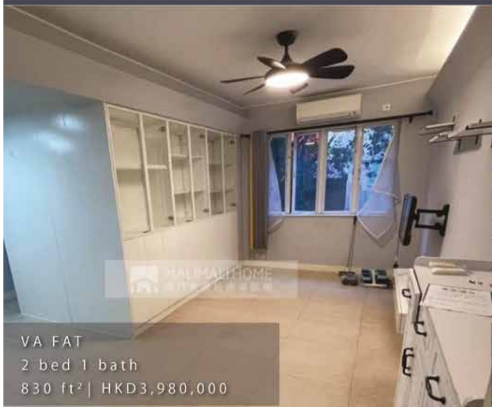
VA FAT 2 bed 1 bath 830 ft 2 | HKD3,980,000