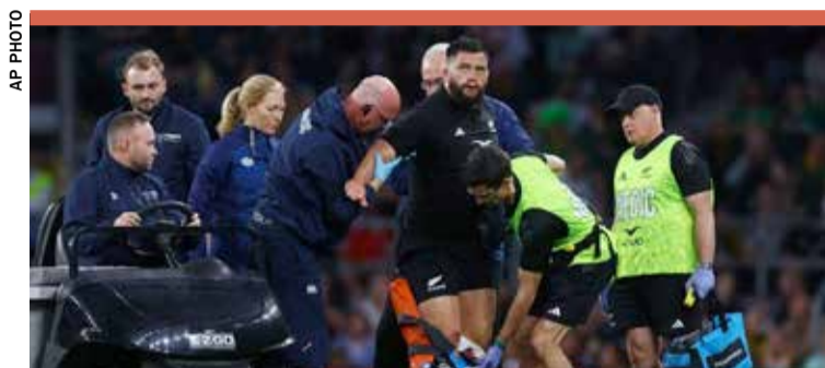
New Zealand's Tyrel Lomax being assisted by medical team

Cane ran some but didn't train on Monday. He's treating