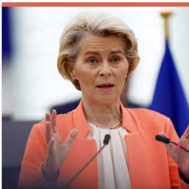
Ursula von der Leyen

Electric vehicle makers including BYD Auto and Geely Group's Zeekr unit began sales this year in Japan and Europe. Geely also owns Sweden's Volvo Cars and its all-electric luxury brand, Polestar.