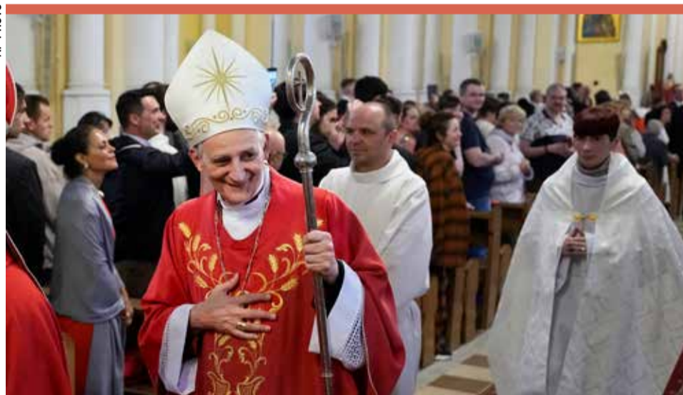
Pope Francis' Ukraine peace envoy, Cardinal Matteo Zuppi

Francis tapped Zuppi, a veteran of the Catholic Church's peace diplomacy, in May as his envoy, aiming to "initiate paths of peace." Over time, Zuppi's mission has concentrated on the humanitarian front and in particular in trying to establish a mechanism