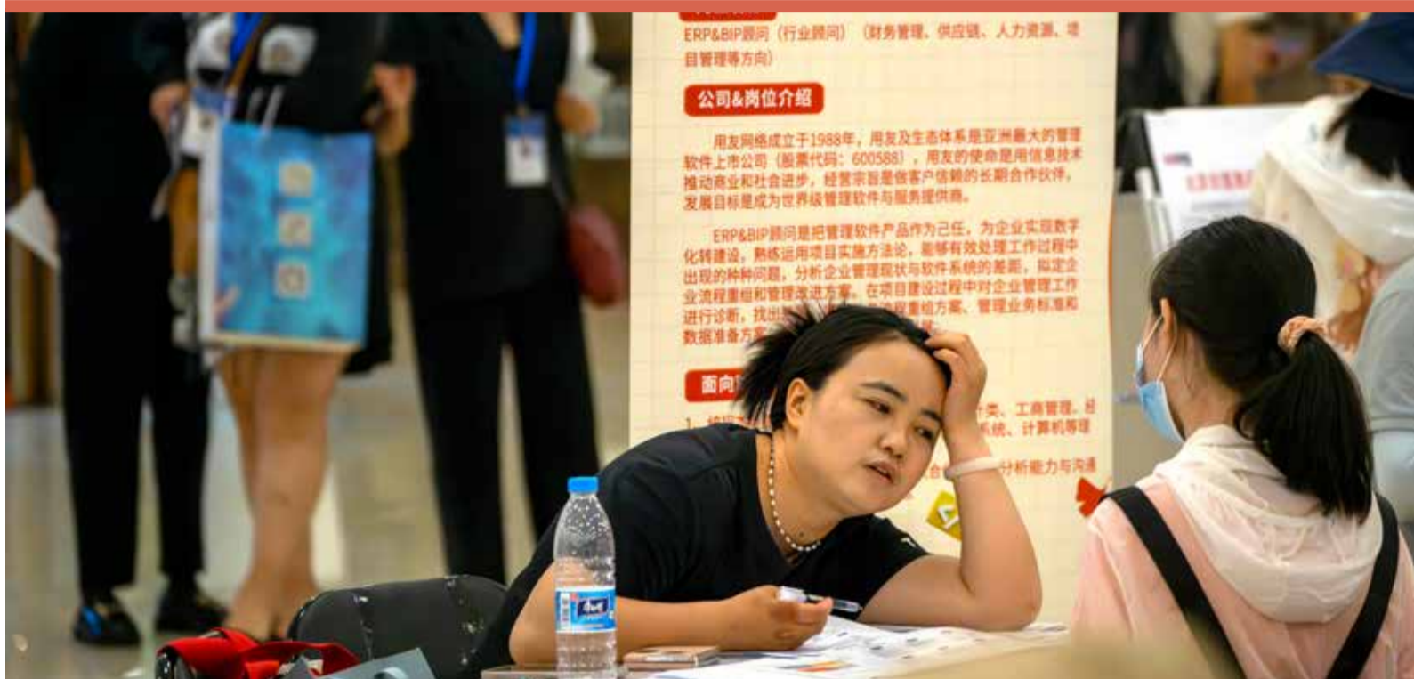
A recruiter talks with an applicant at a booth at a job fair at a shopping center in Beijing, last June