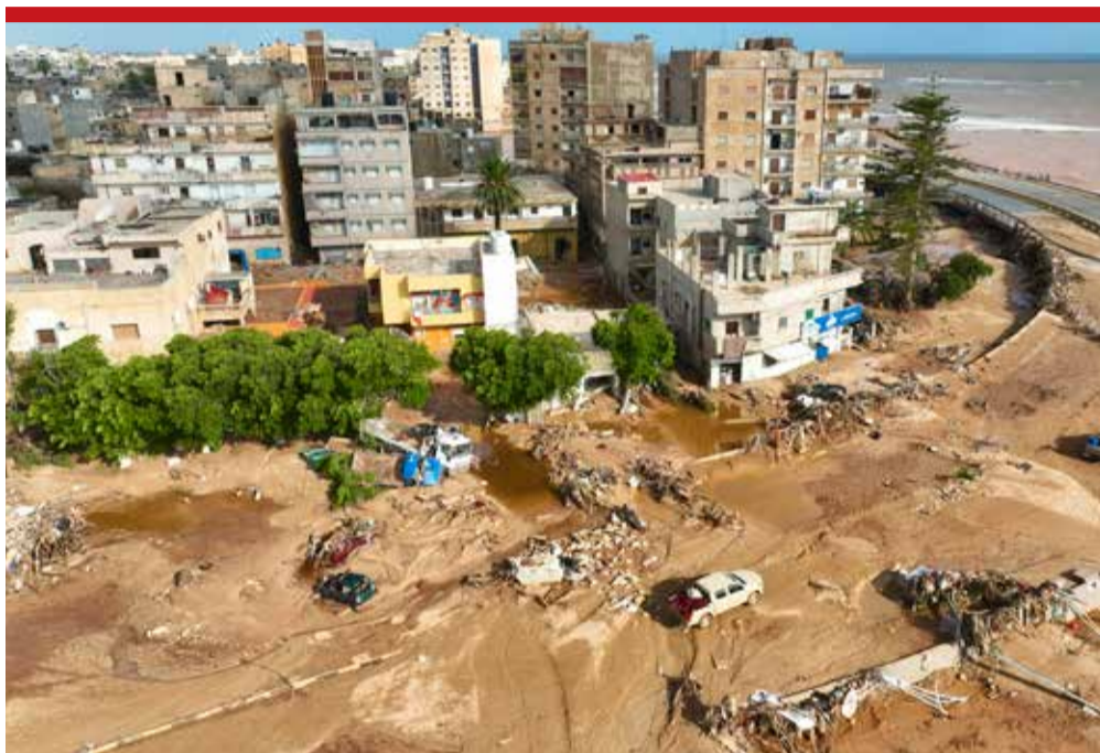
A general view of the coastal city of Derna after the floods