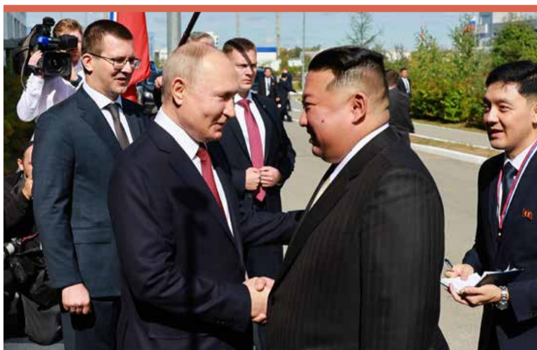
Vladimir Putin (left) and Kim Jong Un shake hands during their meeting at the Vostochny cosmodrome outside the city of Tsiolkovsky, yesterday

South Korea's Joint Chiefs of Staff didn't immediately say how far the North Korean missiles flew. Japan's Coast Guard, citing Tokyo's Defense Ministry, said the missiles