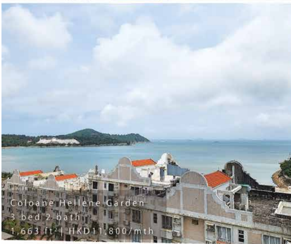
Coloane Hellene Garden 3 bed 2 bath 1,663 ft 2 | HKD11,800/mth