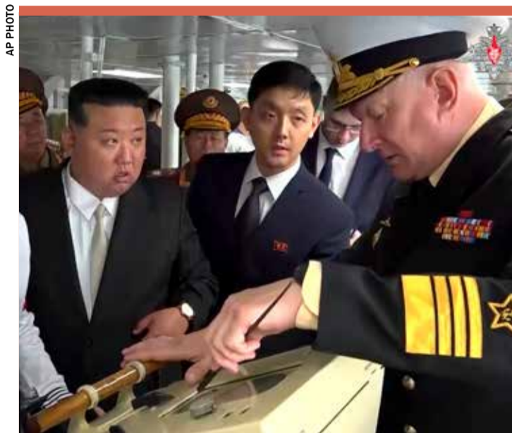
In this image taken from video released by Russian Defense Ministry, Kim Jong Un listens to explanations by Admiral Nikolai Yevmenov (right) while visiting a frigate of the Russian navy in the port of Vladivostok

Kim and Shoigu later traveled to Vladivostok, where they inspected the Admiral Shaposhnikov frigate. Russia's navy commander, Adm. Nikolai Yevmenov, briefed Kim on the ship's capabilities and weapons, which include long-range Kalibr cruise missiles that Russian warships have regular-