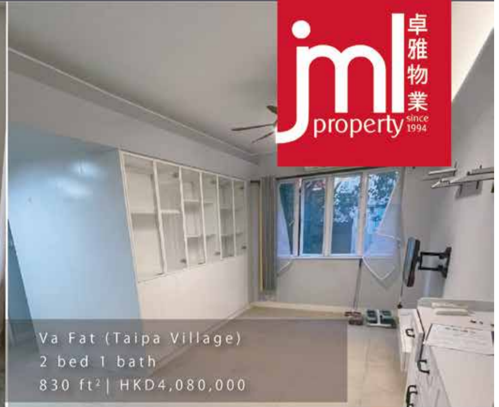
Va Fat (Taipa Village) 2 bed 1 bath 830 ft 2 | HKD4,080,000