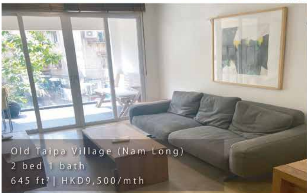
Old Taipa Village (Nam Long) 2 bed 1 bath 645 ft 2 | HKD9,500/mth