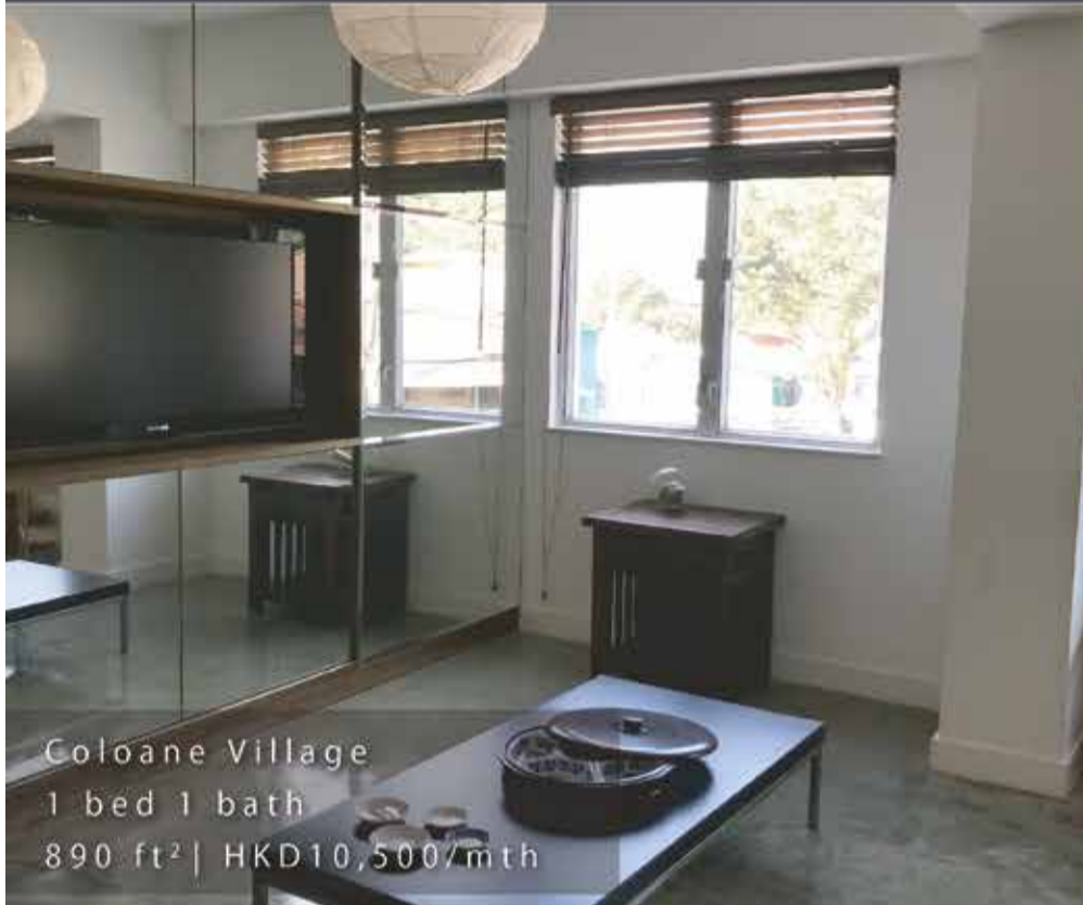
Coloane Village 1 bed 1 bath 890 ft 2 | HKD10,500/mth