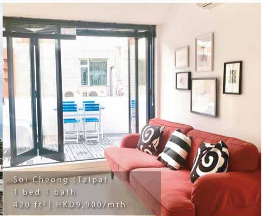
Soi Cheong (Taipa) 1 bed 1 bath 420 ft 2 | HKD9,900/mth