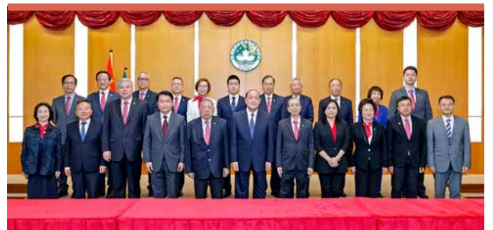
Ho Iat Seng with Macau Chinese Chamber of Commerce

In another meeting, local delegates to the National People's Congress expressed their hopes for clearer policies and guidelines related to the administration of Hengqin. Ho promised corresponding studies will be undertaken. AL