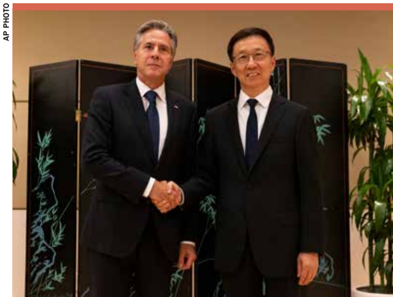
U.S. Secretary of State Antony Blinken and Vice President Han Zheng at the Chinese mission to the UN

"I think it's a good thing that we have this opportunity to build on the recent high-level engagements that our countries have had to make sure that we're maintaining open communications and demonstrate that we are responsibly managing the