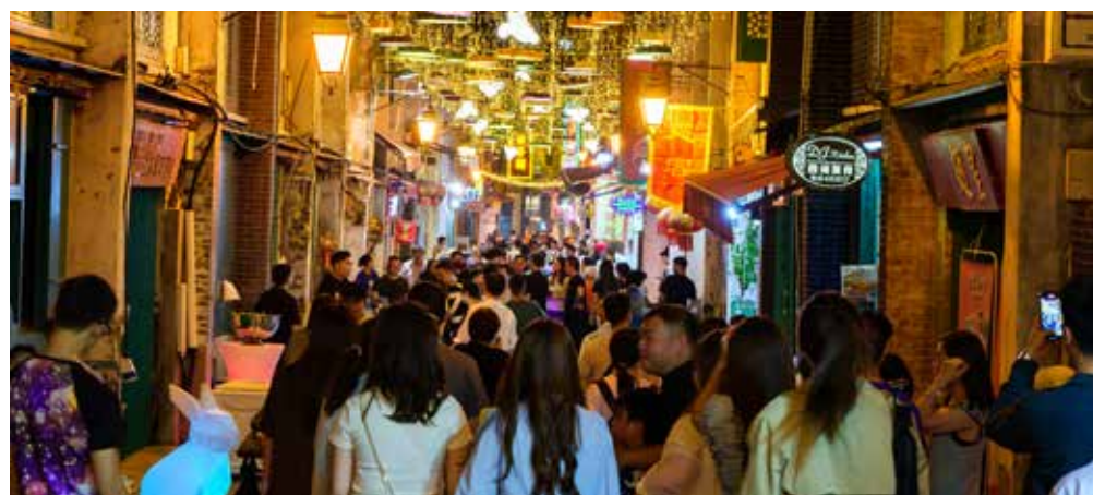
Embellished lanterns illuminated the prosperous and festive atmosphere in Rua da Felicidade