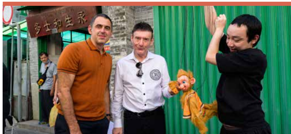
International sport stars enjoyed the pedestrian zone with other visitors

But what are festivities without great food? Macao is renowned for being a "City of Gastronomy" in addition to its abundant art and culture, so to enrich the nighttime experience of the Rua da Felicidade community, Wynn set up a roadside bar and food trucks in the market and provide colorful tables for public use along the street, assisting the neighborhood to gradually develop a unique night market ambience.