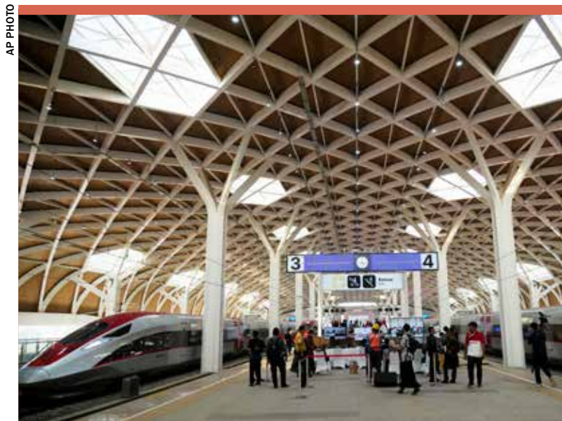
Train launching in Southeast Asia's first high-speed railway, a key project under China's Belt and Road infrastructure initiative, at Halim station in Jakarta

Since it was launched, the Belt and Road Initiative, or BRI, has backed projects carried out mostly by Chinese construction com-