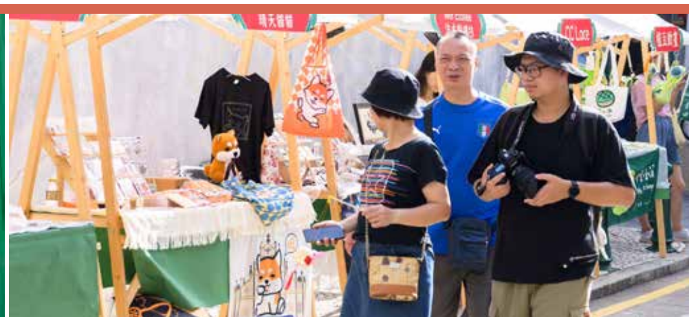
Local cultural and creative brands were invited to open stalls in the daytime cultural market