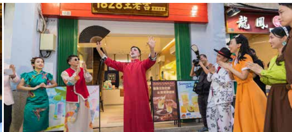
"Back to Rua da Felicidade" theater introduced the public to the elegance of the street