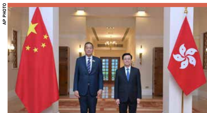
Chief Executive John Lee (right) and Thailand's Prime Minister Srettha Thavisin before their meeting at Government House in Hong Kong

Lee's administration wants to expand the city's role in Southeast Asia to boost economic growth for the financial hub after years of COVID-19