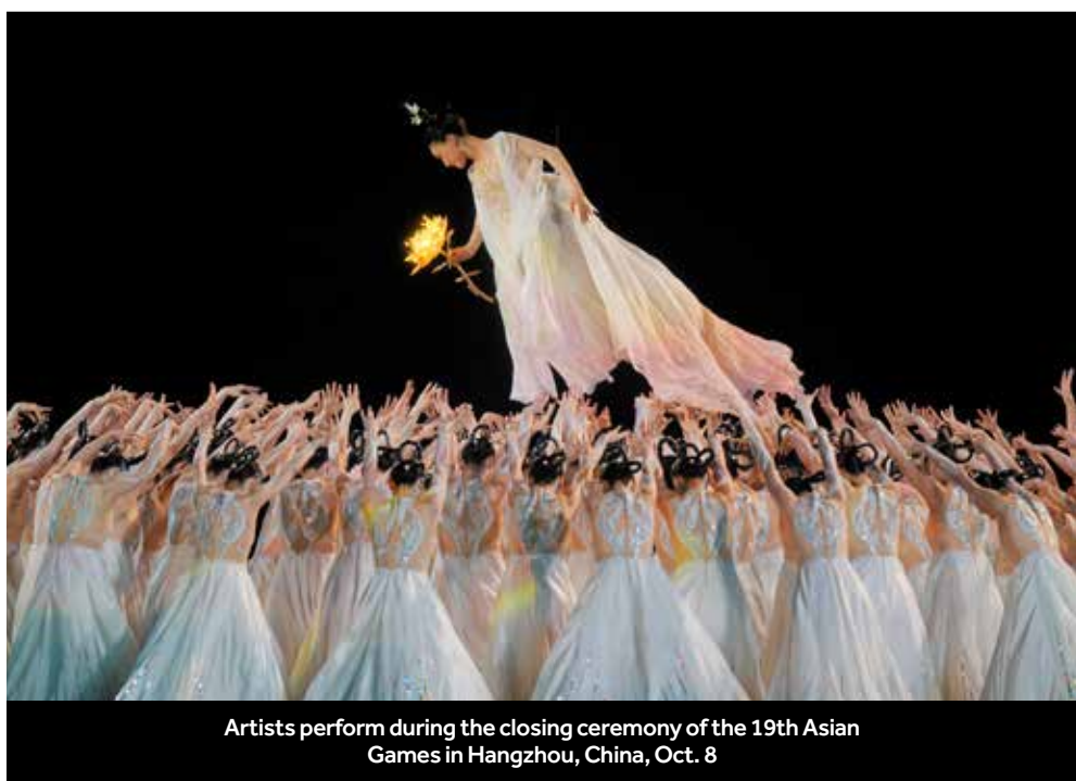
Artists perform during the closing ceremony of the 19th Asian Games in Hangzhou, China, Oct. 8