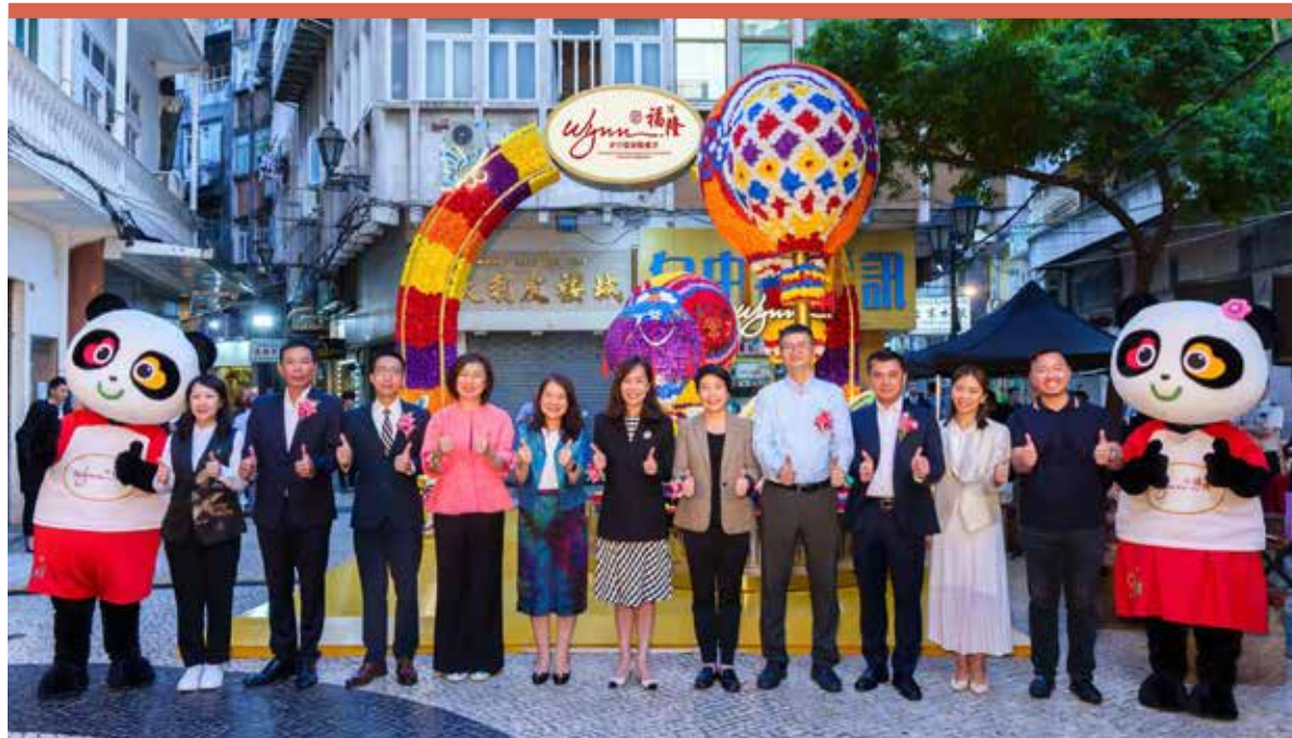
Wynn held the "Rua da Felicidade Pedestrian Zone" launch ceremony during the Mid-Autumn Festival and National Day.

resources and business expertise, to enrich the cultural and tourism elements of Rua da Felicidade, such as elevating the street atmosphere and introducing large-scale art installations, a cultural market, art and cultural activities, an interactive check-in game, and a night market experience. By creating a vibrant and artistic atmosphere filled with cultural and tourism experiences, the project attracts tourists to visit the community, unleashes new vitality in the old street, drives community tourism, and boosts the economy of the entire central district.