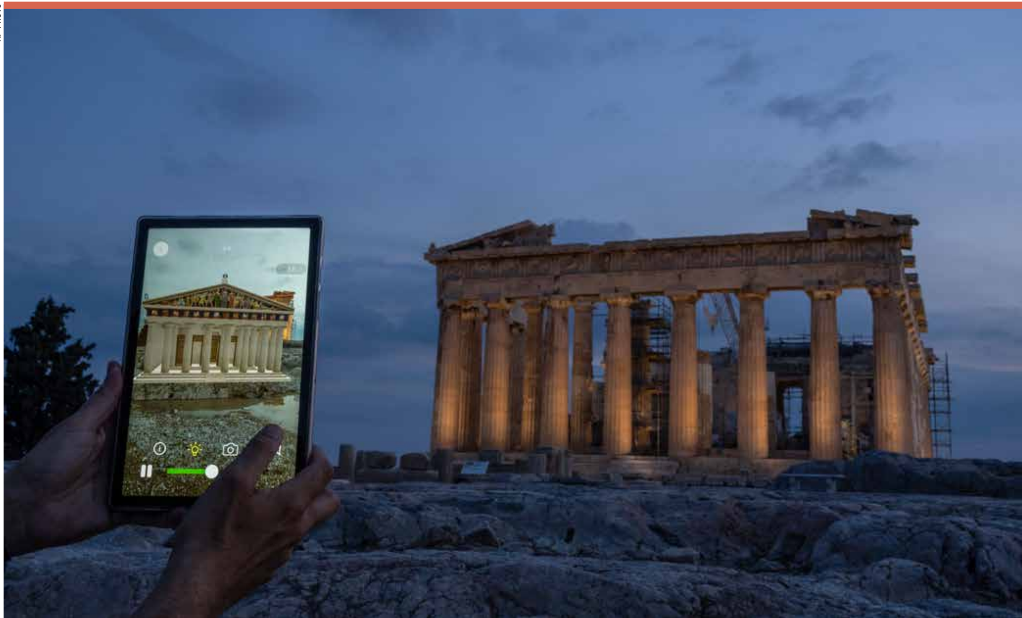
A man holds up a tablet showing a digitally overlaid virtual reconstruction of the ancient Parthenon temple, at the Acropolis Hill in Athens, Greece