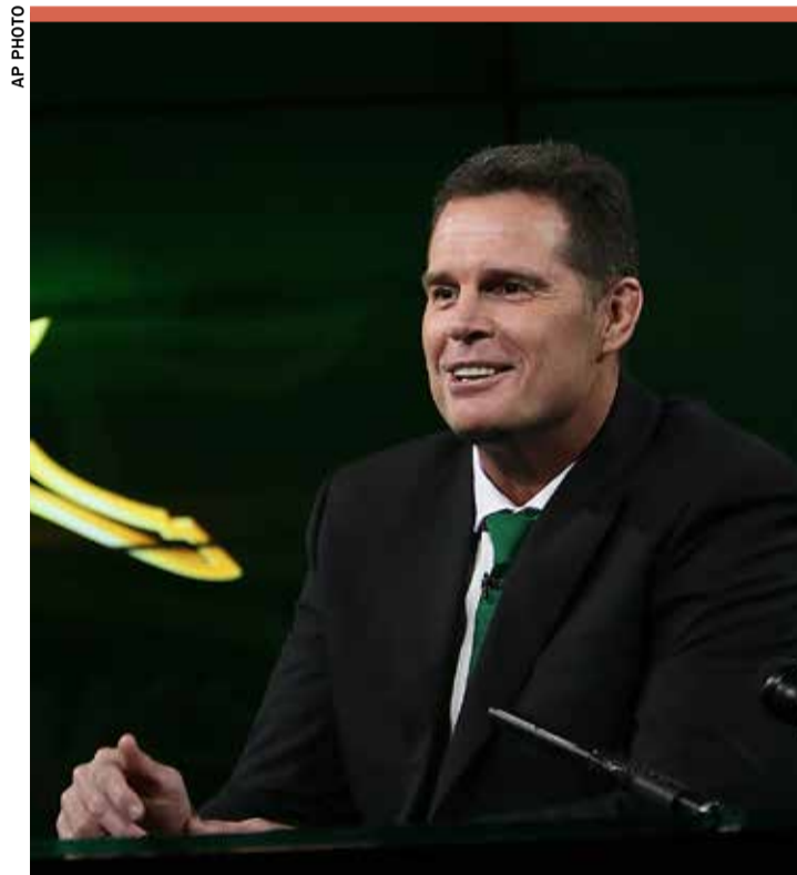
Rassie Erasmus, South Africa's coach

Not long ago, Erasmus was enemy No. 1 among referees for a scathing hour-long video critique of the match officials in