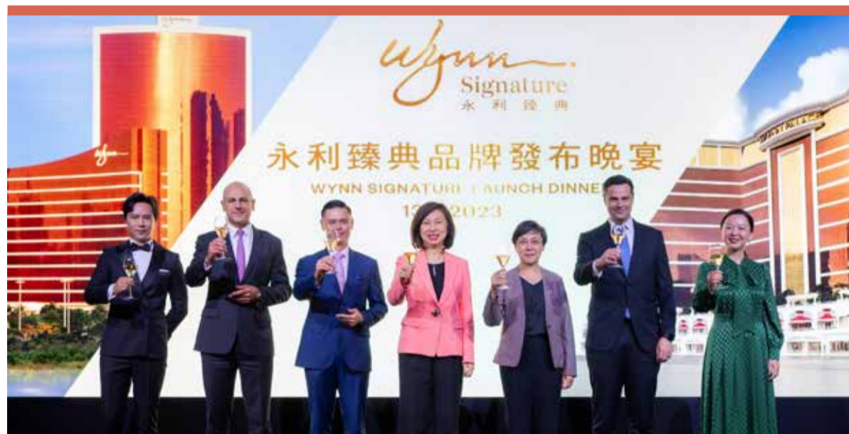
Officiating guests unveiled the "Wynn Signature" brand

To promote the future development of the Chinese wine industry and provide an excellent exchange platform for wine industry professionals from China, Wynn will hold the "Wynn Signature - Chinese Wine Competition" in March-April next year. A number of wine connoisseurs from China and abroad will be invited to serve as judges to select the most outstanding Chinese wines as well as wineries and individuals whose contributions