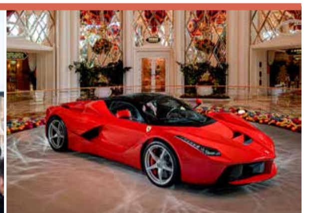
16 limited-edition hypercars are being showcased at Wynn Macau and Wynn Palace