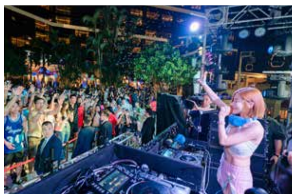
World's hottest DJs livened up the holiday with performances