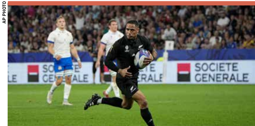
Aron Smith, New Zealand

Recent history weighs in favor of Ireland, which has beaten New Zealand in three of their last four tests, and five of their last eight. But Smith, who is retiring after the Rugby World Cup, isn't looking back for motivation or inspiration, not even to the 2019 World Cup quarterfinal when the All Blacks crushed Ireland 46-14 and Smith scored two