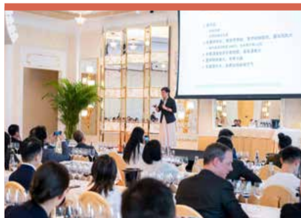
Wynn held masterclasses to introduce wine-related knowledge to industry practitioners