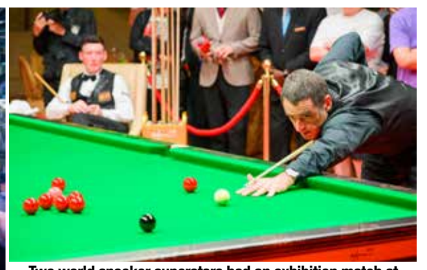
Two world snooker superstars had an exhibition match at Wynn Macau