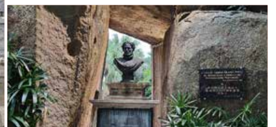
A statue of Luís Camões was erected not far from the "cave" in which he composed the greatest of Portuguese literary works "Os Lusíadas"