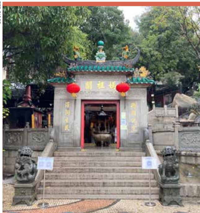
The name Macau probably comes from A-Ma Temple

Zhuhai station is within walking distance of the Zhuhai-Macau border. D941 runs only from Friday to Monday, and the same applies to its return service, D942, which leaves Zhuhai at 18:14 and reaches Hongqiao at 07:00 the next day.