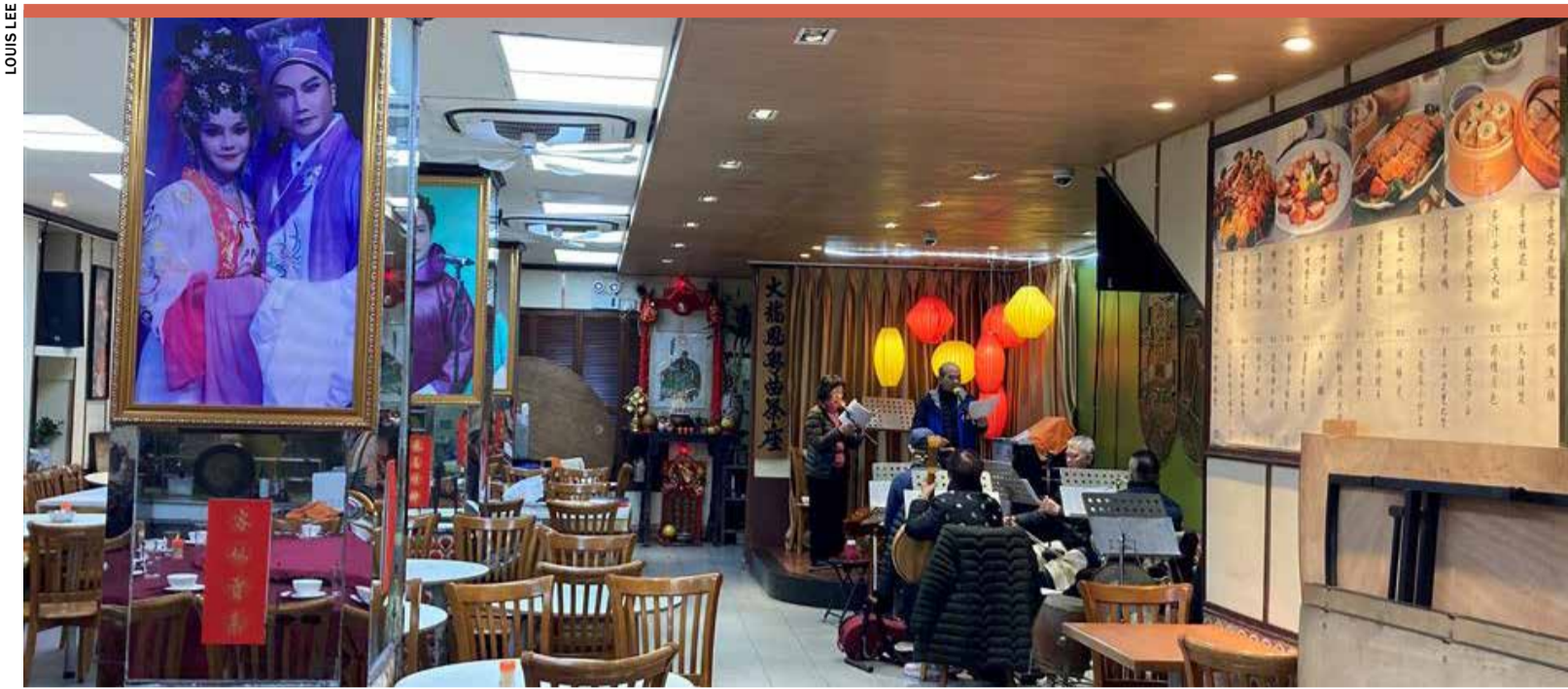
The 92-year-old Tai Long Fong Casa de Cha, a relic from a bygone era