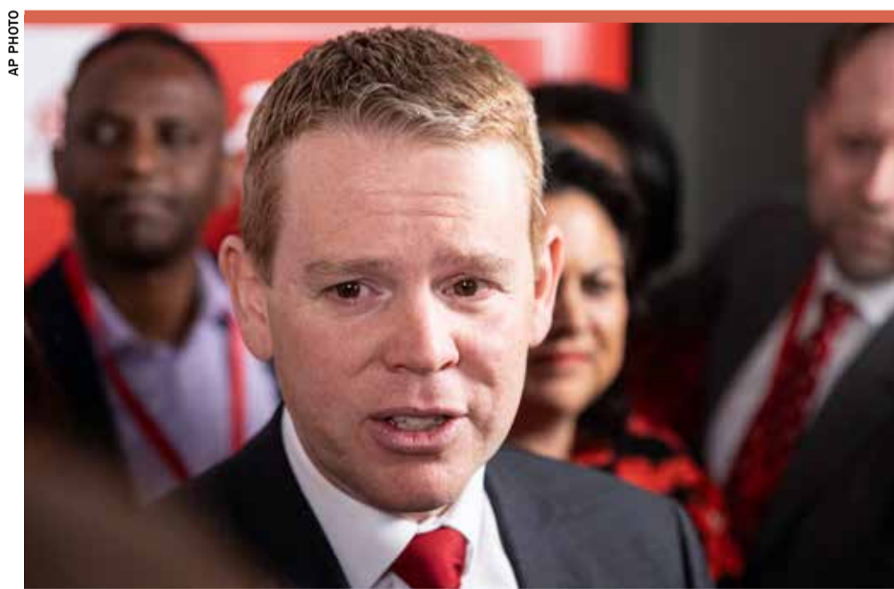
New Zealand Prime Minister Chris Hipkins

"Obviously the election result was one that