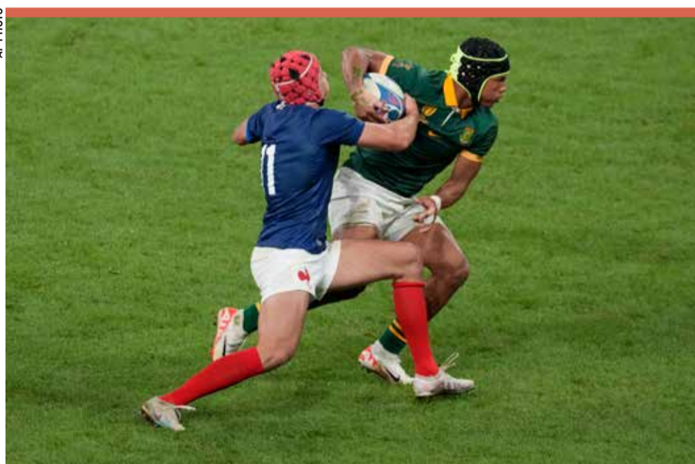
South Africa's Cheslin Kolbe (right) and France's Louis Bielle-Biarrey challenge for the ball

The Springboks are unlikely to ever go too far from the power game that has always defined them, but Erasmus and coach Jacques Nienaber have spoken often this year about finding another method of attack to complement — and not replace — South Africa's big pack of forwards. That's meant more backline tries.