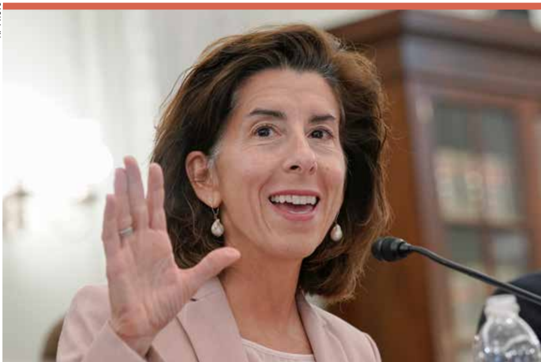
U.S. Commerce Secretary Gina Raimondo