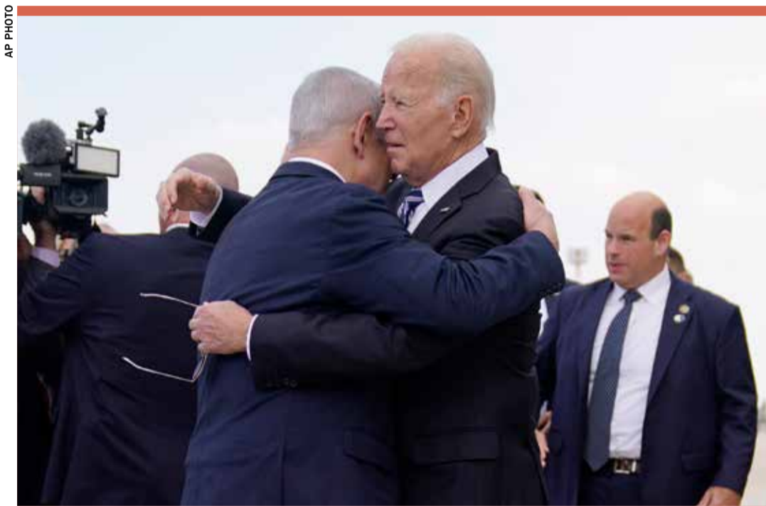
President Joe Biden is greeted by Israeli Prime Minister Benjamin Netanyahu in Tel Aviv, yesterday

But he also said Hamas had "slaughtered" Israelis in the Oct. 7 attack that killed 1,400 people. Biden described at length the horror of