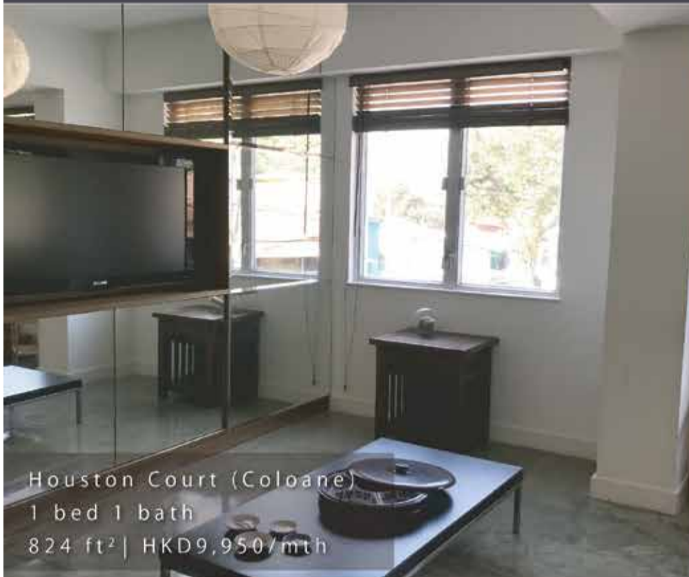
Houston Court (Coloane) 1 bed 1 bath 824 ft 2 | HKD9,950/mth