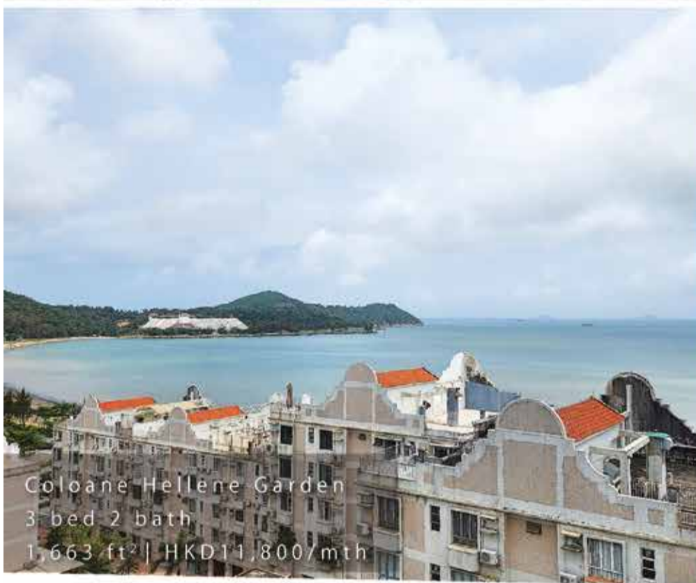
Coloane Hellene Garden 3 bed 2 bath 1,663 ft 2 | HKD11,800/mth