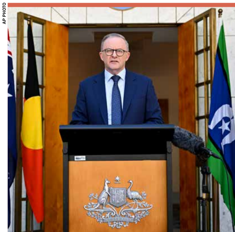
Australian Prime Minister Anthony Albanese speaks to the media during a press conference at Parliament House in Canberra, yesterday

Under the trilateral pact, the U.S. and Britain will cooperate to provide Australia with a fleet of submarines powered by U.S.