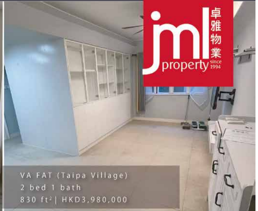
VA FAT (Taipa Village) 2 bed 1 bath 830 ft 2 | HKD3,980,000