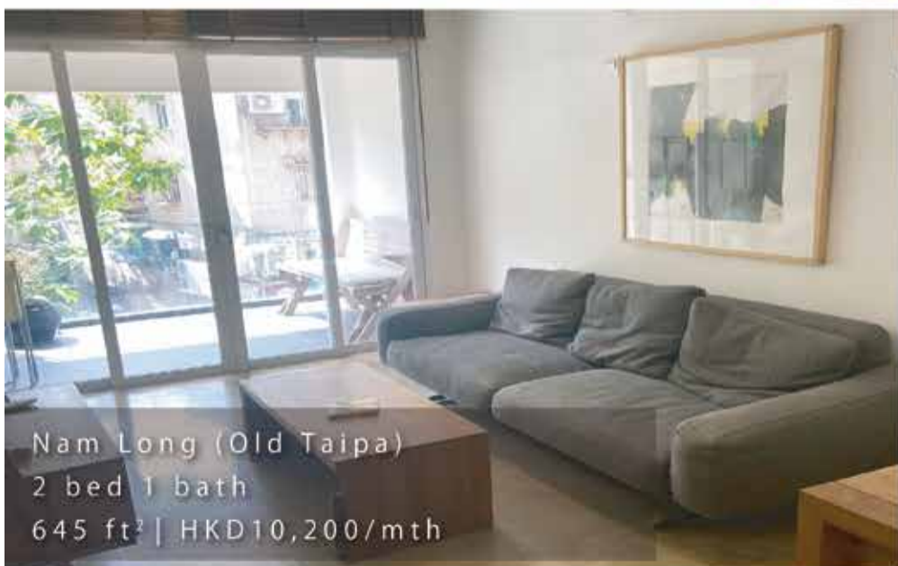
Nam Long (Old Taipa) 2 bed 1 bath 645 ft 2 | HKD10,200/mth