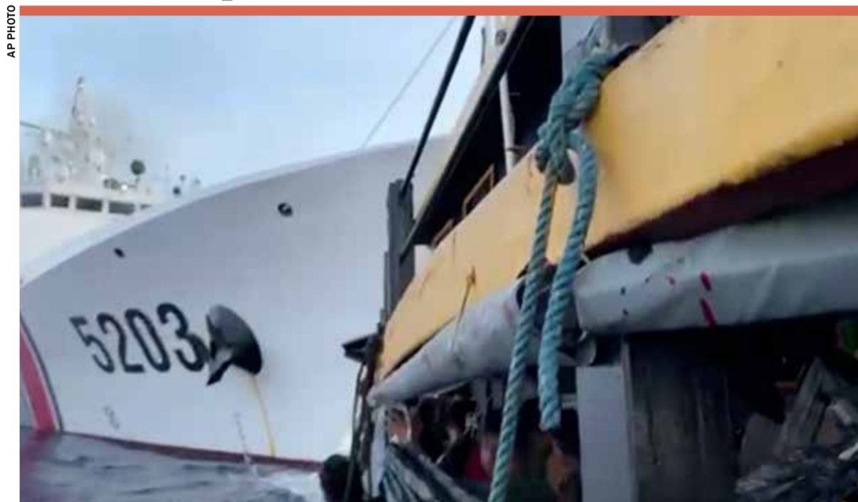
In this image from a video released by the Armed Forces of the Philippines, Filipino sailors, bottom, look after a Chinese coast guard ship with bow number 5203 bumps their supply boat as they approach Second Thomas Shoal, yesterday

The Chinese coast guard said the Philippine vessels "trespassed" into what it said were Chinese waters "without authorization" despite repeated radio warnings, prompting its ships to stop them. It blamed the Philippine vessels for causing the collisions.