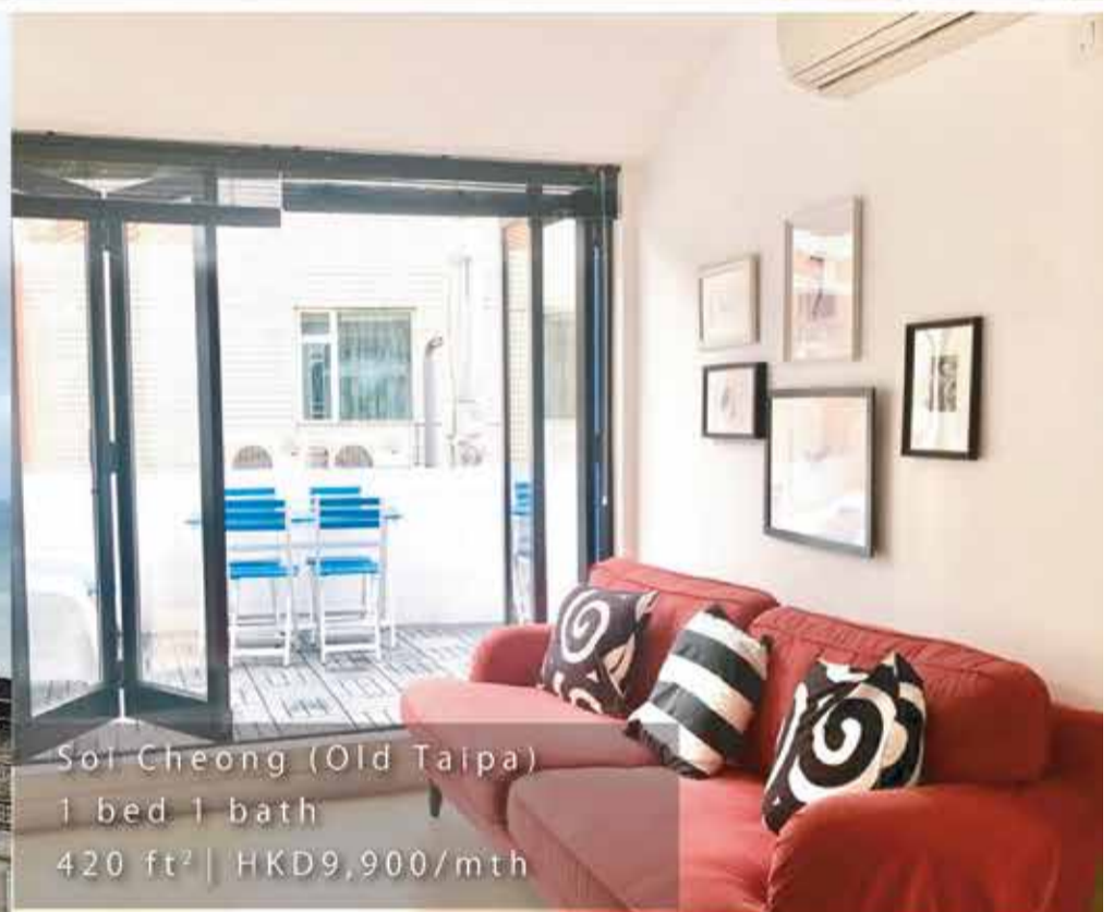
Soi Cheong (Old Taipa) 1 bed 1 bath 420 ft 2 | HKD9,900/mth