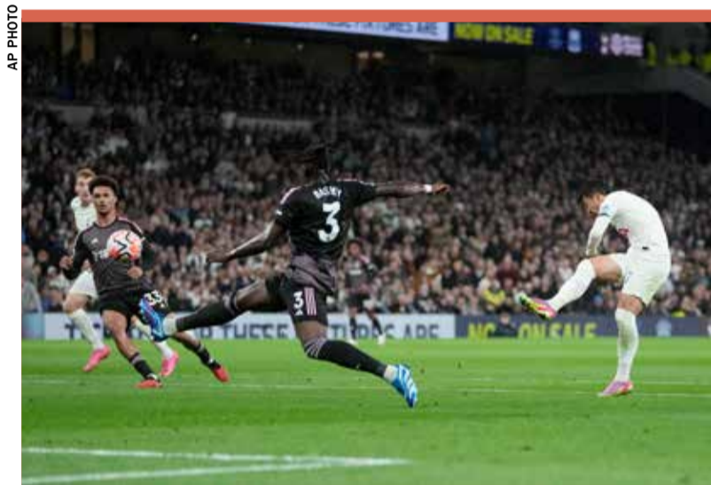
Tottenham's Son Heung-min (right) scores his side's opening goal

Both of Tottenham's goals came from the same source — Fulham defender Calvin Bassey giving away possession when passing out from the back under pressure — and Son had a key role in each of them.