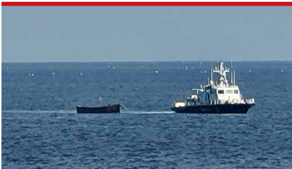
A small wooden boat is towed into a port in Yangyang, South Korea