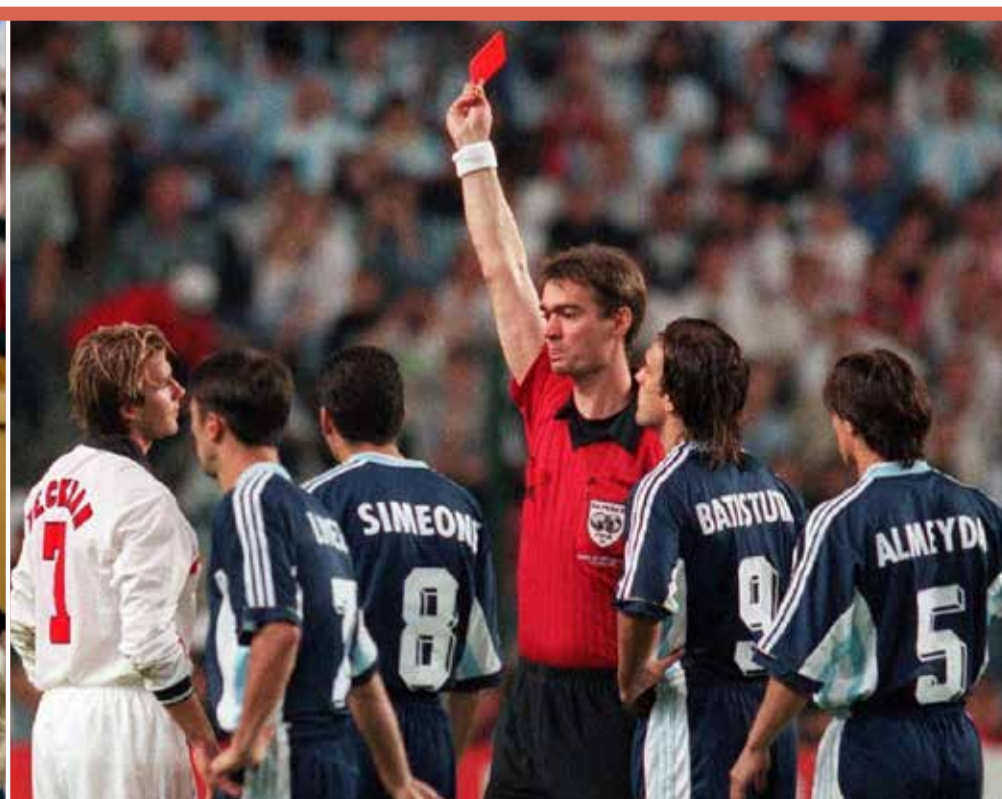
David Beckham and Bobby Charlton, who died this week: two greats of England's football