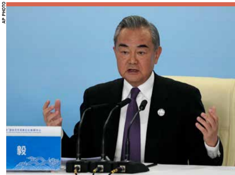
Foreign Minister Wang Yi

The officials did not confirm the leaders' meeting, nor did they