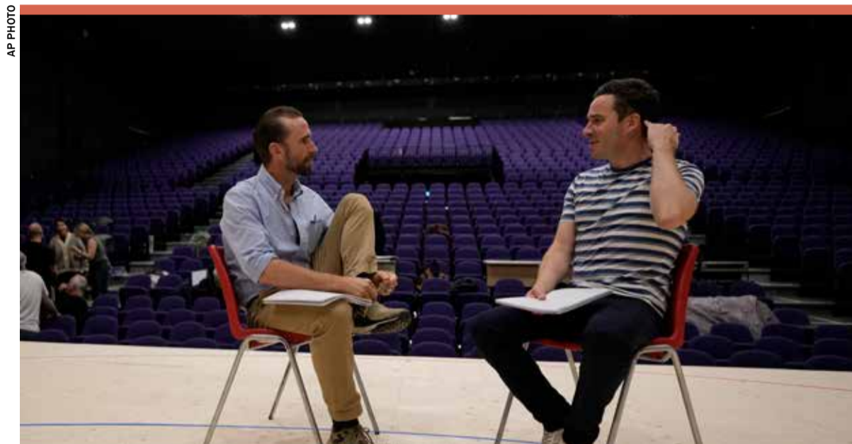
Actor Joseph Fiennes, left, and writer James Graham on stage as they look at the script for the play based around the England soccer manager Gareth Southgate entitled 'Dear England'

ford ourselves a healthier response to losing whereby you then reset and reform and reinvent -- which is what Gareth tried to do," Graham told The Associated Press during a break in rehearsals.