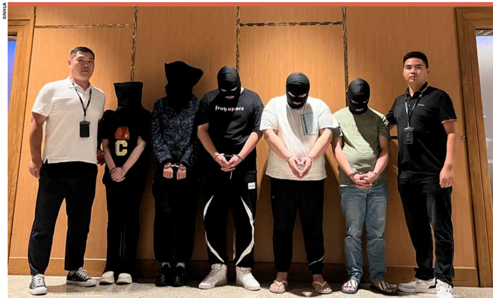
Myanmar police hand over five telecom and internet fraud suspects to Chinese police at Yangon International Airport in Yangon, late August