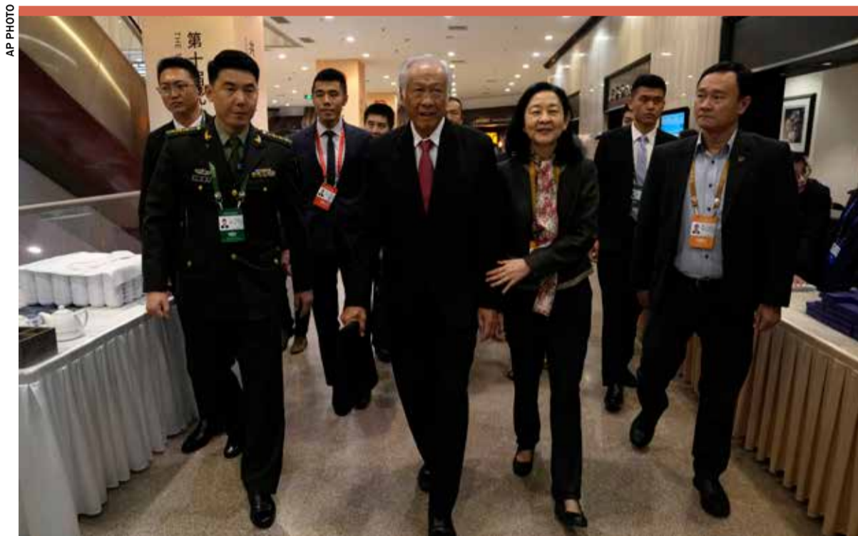
Singapore's Defense Minister Ng Eng Hen arrives for the 10th Beijing Xiangshan Forum in Beijing, yesterday

Russian Defense Minister Sergei Shoigu used the forum to highlight Russia's deepening ties with China as it faces isolation from the West over its invasion of