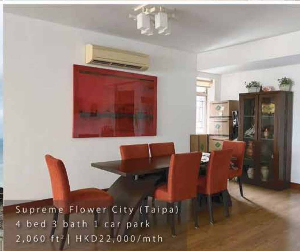
Supreme Flower City (Taipa) 4 bed 3 bath 1 car park 2,060 ft 2 | HKD22,000/mth