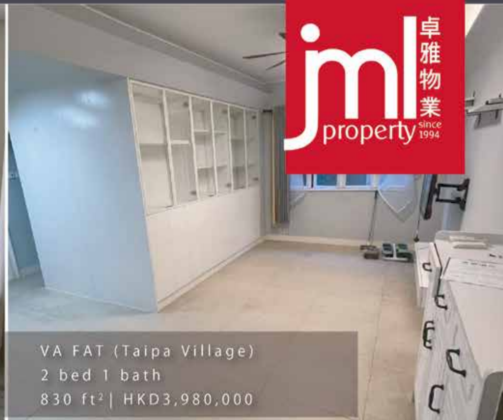
VA FAT (Taipa Village) 2 bed 1 bath 830 ft 2 | HKD3,980,000