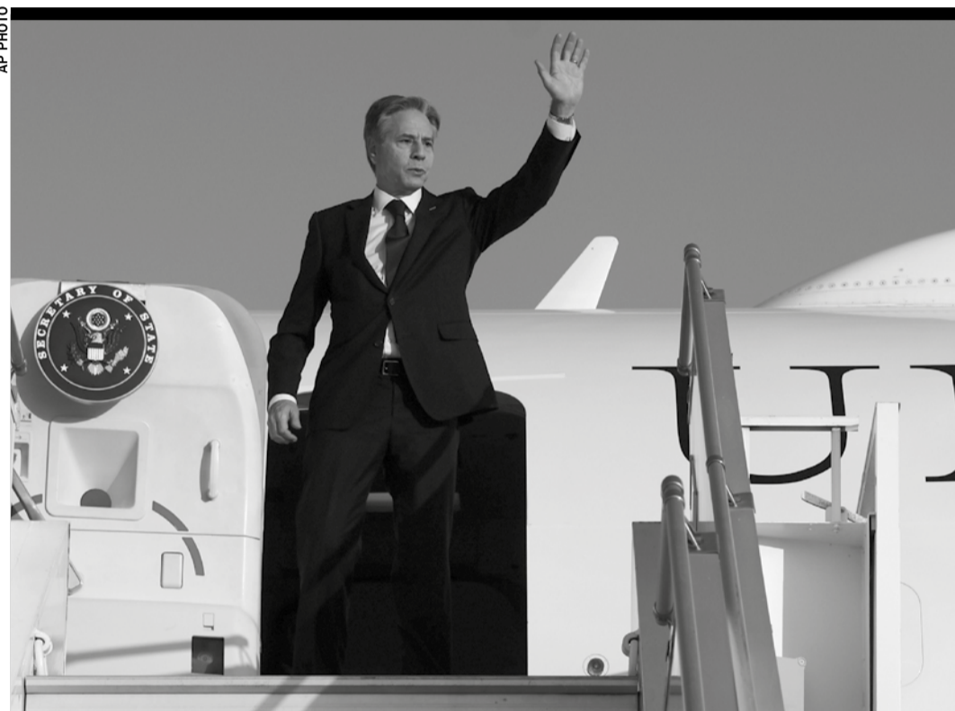
U.S. Secretary of State Antony Blinken waves as he boards his plane to depart after meetings, amid the conflict between Israel and Hamas, in Amman, Jordan, yesterday

The meeting with Abbas, whose Ramallah-based Palestinian Authority has not