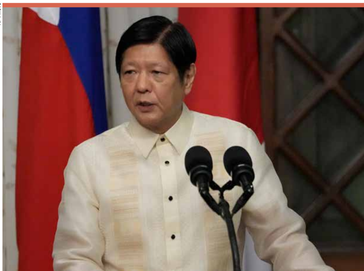
Philippine President Ferdinand Marcos Jr.

gunned down 58 people, including 32 media workers, in a brazen execution-style attack in southern Maguindanao province. It was the deadliest single attack on journalists in recent history.