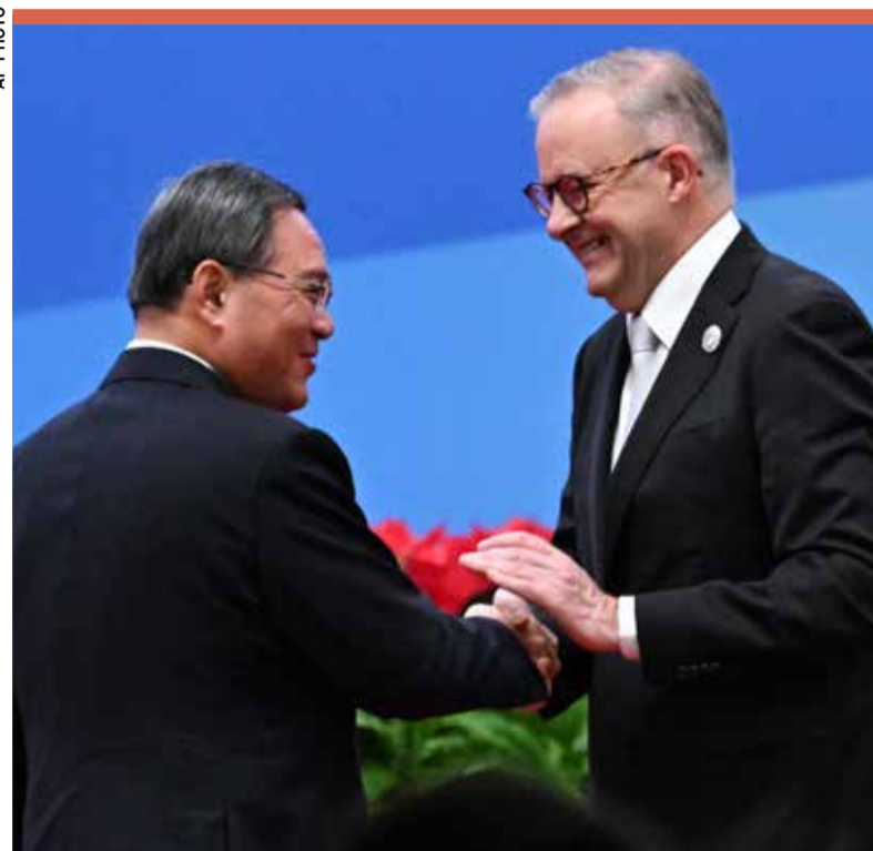
China's Premier Li Qiang, left, greets Australia's Prime Minister Anthony Albanese during the China International Import Expo opening session in Shanghai, China, yesterday

The Chinese government has adopted various policies to help the economy; raising spending on building ports and other infrastructure, cutting interest rates and easing curbs on home-buying. But economists say wider reforms are needed to address long-term problems that are stifling growth.