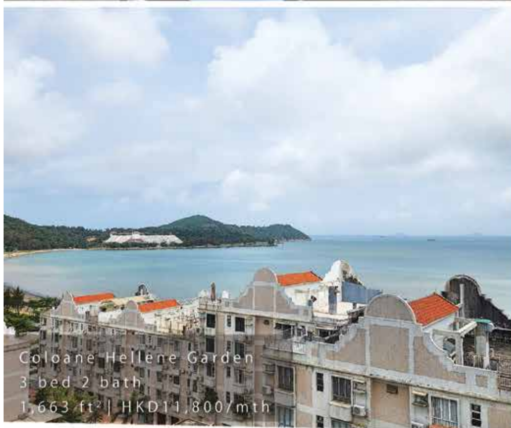
Coloane Hellene Garden 3 bed 2 bath 1,663 ft 2 | HKD11,800/mth