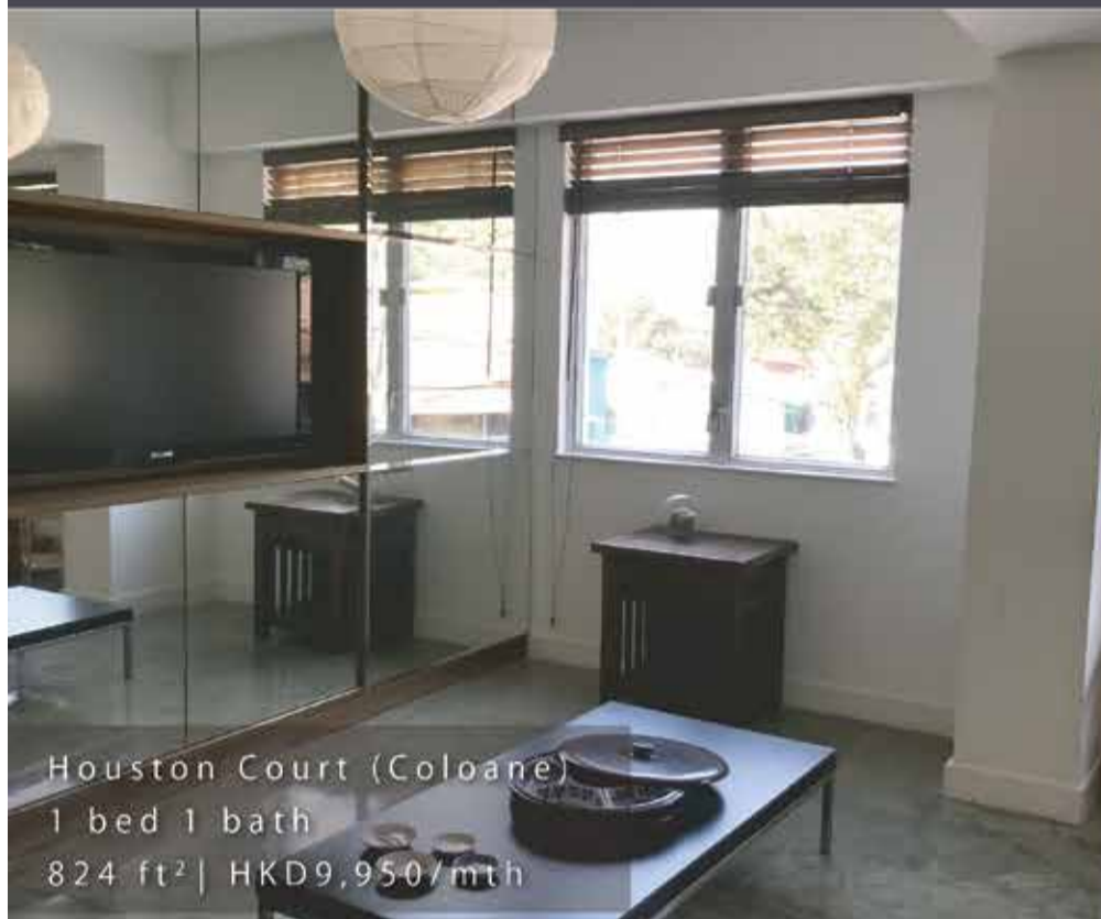
Houston Court (Coloane) 1 bed 1 bath 824 ft 2 | HKD9,950/mth