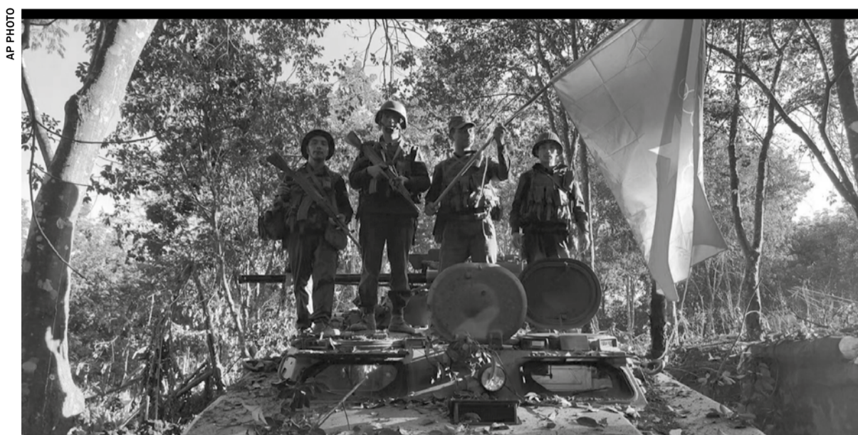
Members of the Myanmar National Democratic Alliance Army hold the group's flag as they pose for a photograph on a captured army armored vehicle in Myanmar

Loosely organized resistance groups opposed to army rule, known as the People's Defense Force, or PDF, have sprung up around the country since the army's takeover. They have made alliances with well-established armed ethnic minority groups such as the Kachin and Karen, who have been fighting in border areas for greater autonomy from the central government for more than half a century.