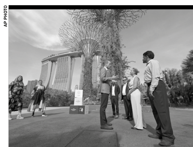
Prince William meets the 2023 Earthshot Prize finalists at the base of the Supertrees at the Gardens by the Bay in Singapore

William spoke to the finalists -- all whom are attending the ceremony for the first time for networking opportunities -- at Gardens by the Bay, an artistic horticulture attraction. The winners are grouped into five categories: nature protection, clean air, ocean re-