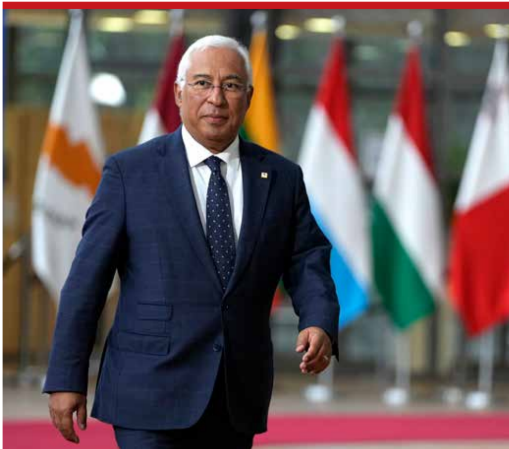
Portugal's Prime Minister Antonio Costa