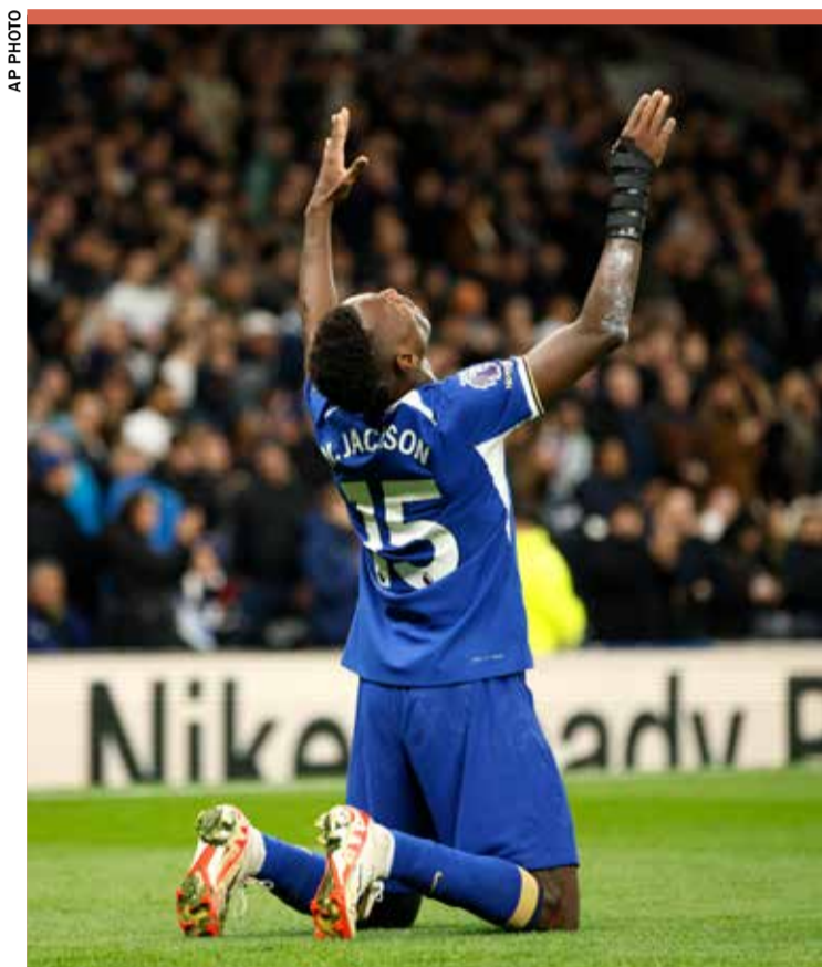
Hat trick: Chelsea's Nicolas Jackson celebrates after scoring his side's third goal