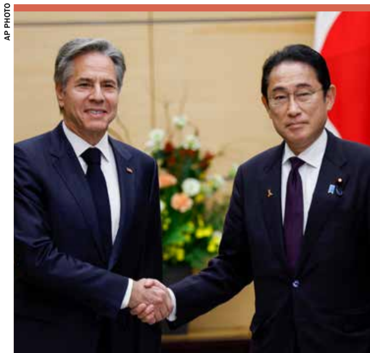
U.S. Secretary of State Antony Blinken, left, shakes hands with Japanese Prime Minister Fumio Kishida ahead of G7 meeting

In Tokyo, Blinken and foreign ministers from Britain, Canada, France, Germany, Japan and Italy will be looking for common ground on approaches to the Israel-Hamas war that threatens to destabilize already shaky se-